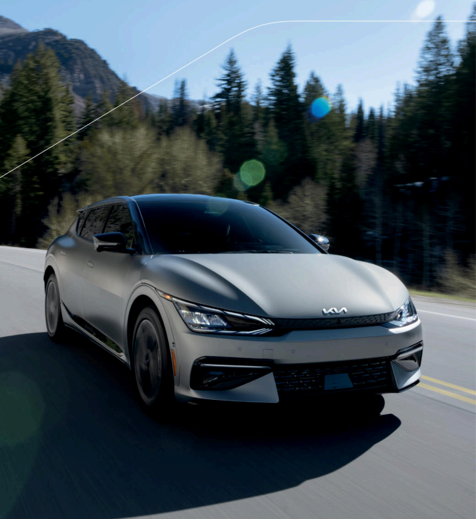
GT-Line e-AWD shown.

576 hp 545 lb.-ft. of Torque* (GT e-AWD)