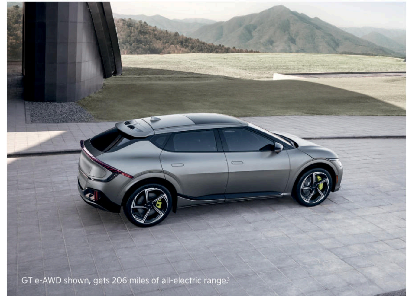
GT e-AWD shown, gets 206 miles of all-electric range. 3

310-mile All-electric Range 3 (Wind, GT-Line RWD)