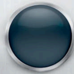
SMOKE BLUE (EX)

YOU ARE OPEN TO EXPLORING ENDLESS POSSIBILITIES. YOUR GLASS IS ALWAYS HALF-FULL.