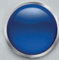
DEEP-SEA BLUE (S, EX)

YOU ARE CALM BEFORE, DURING, AND AFTER THE STORM AND EXCEL AT PLAYING HIDE-AND-SEEK.