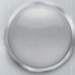
SILKY SILVER (LX, S, EX)

YOU LIKE LISTENING TO THE BLUES AROUND A CAMPFIRE AT TWILIGHT. CURRENT MOOD: MELLOW.