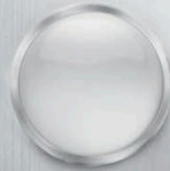
CLEAR WHITE (LX, S, EX)

Actual colors may vary from printed brochure. See kia.com/rio for interior combinations. RIO EX SHOWN