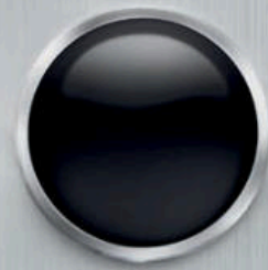
AURORA BLACK (LX, S)

YOU ARE DRAWN TO THE WATER AND YOUR SOUL RUNS DEEP. DOLPHINS GRAVITATE TOWARD YOU.