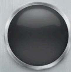
PHANTOM GRAY (EX)

YOU SEEK ADVENTURE AND ARE THE LIFE OF THE PARTY. NO CHILI PEPPER IS OFF LIMITS TO YOU.