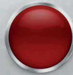
CURRENT RED (S, EX)

YOU'RE A SPARKLING CONVERSATIONALIST AND NEVER FORGET YOUR COOLER ON A HOT DAY.