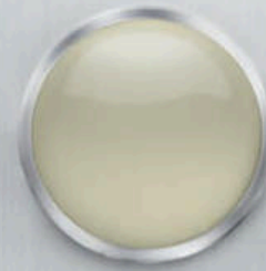
ICE WINE (S)

YOU NOTICE THE SUBTLE IRONIES IN LIFE. NOTHING IS EVER BLACK AND WHITE TO YOU.