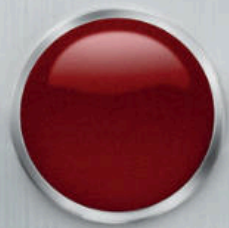
HYPER RED (LX, S, EX, SX) YOU CRAVE EXCITEMENT, AND YOUR POSITIVE ENERGY IS DOWNRIGHT CONTAGIOUS.