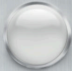
CLEAR WHITE (LX) YOU ARE OPEN TO EXPLORING ENDLESS POSSIBILITIES. YOUR GLASS IS ALWAYS HALF-FULL.

Actual colors may vary from printed brochure. See kia.com/sportage for interior combinations.