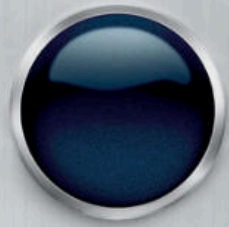
PACIFIC BLUE (LX, S, EX, SX) A WAVE OF CALM WASHES OVER YOU AS YOU REALIZE, YES, THIS IS DEFINITELY THE COLOR FOR YOU.

Find out which COLOR is your perfect match