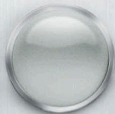
SPARKLING SILVER (LX, S, EX, SX) YOU NOTICE THE SUBTLE IRONIES IN LIFE. NOTHING IS EVER BLACK AND WHITE TO YOU.