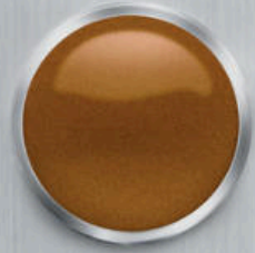
BURNISHED COPPER (LX, S, EX, SX) YOU HAVE A WARM Demeanor AND ALWAYS APPEAR POLISHED WHEN THE SITUATION CALLS FOR IT.

Find out which COLOR is your perfect match