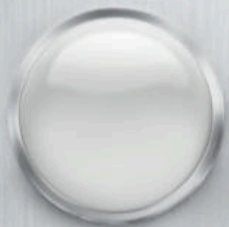
SNOW WHITE PEARL (S, EX, SX) YOU HAVE A PURE HEART AND GENTLE NATURE. YOU LOVE LONG NAPS.