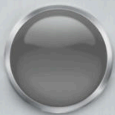
STEEL GRAY (LX, S, EX, SX) THOUGH YOU HAVE A SPARKLING PERSONALITY, YOUR SOUL REMAINS SALT-OF-THE-EARTH.