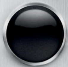
CHERRY BLACK (LX, S, EX, SX) YOUR SWEET NATURE IS SOMETIMES BELIED BY YOUR LOVE OF DARK COMEDIES.