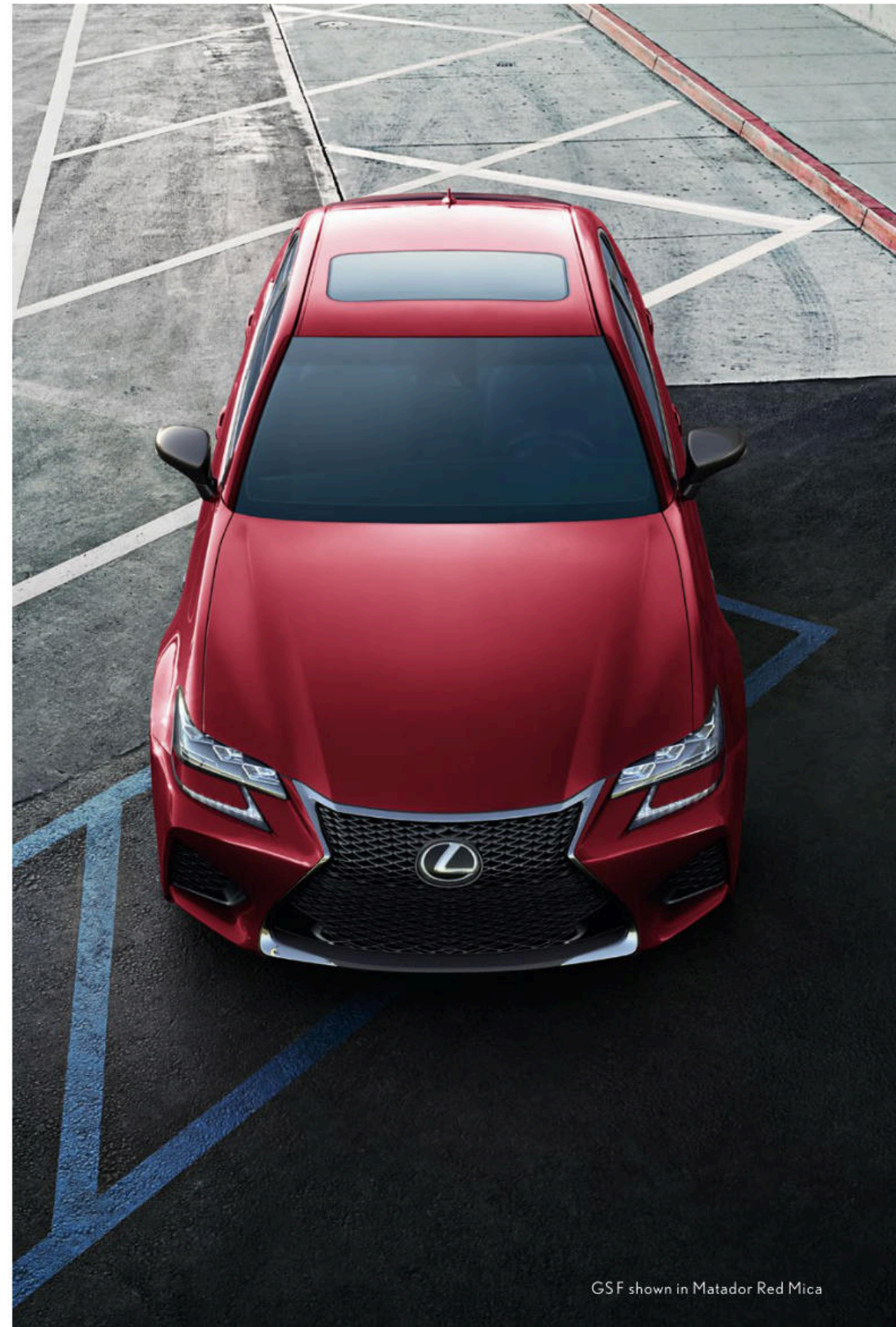
GSF shown in Matador Red Mica