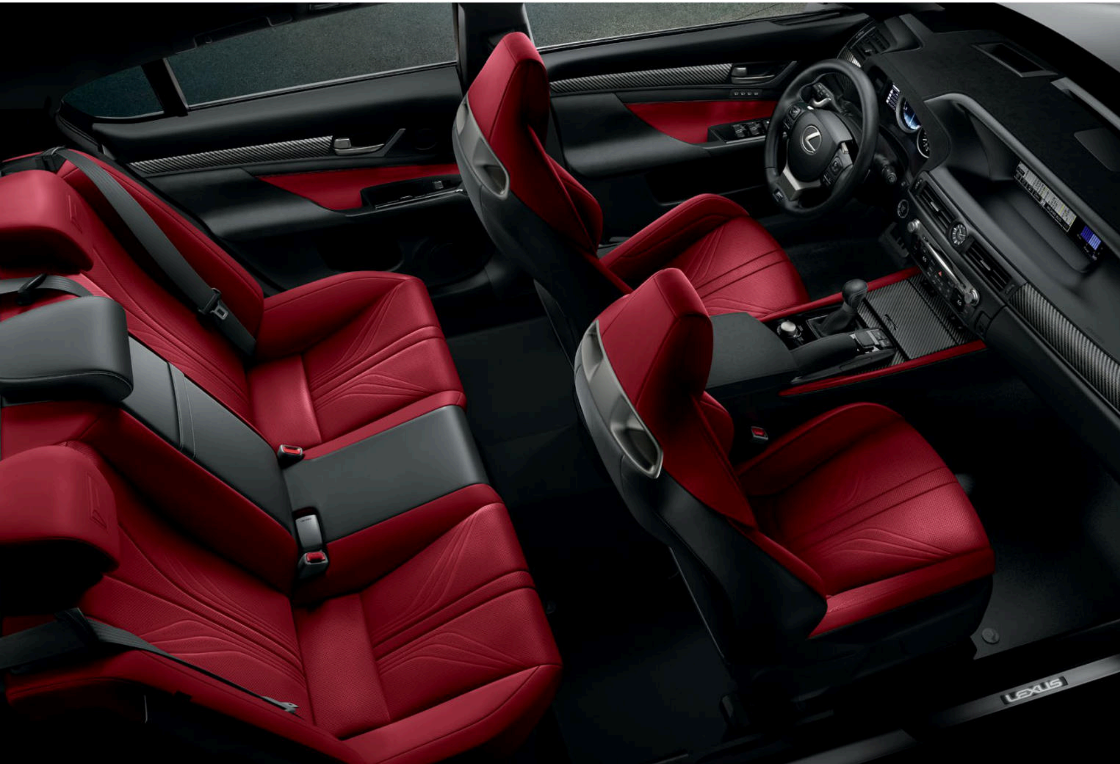
GSF shown with Circuit Red leather and Black Carbon Fiber interior trim // Options shown