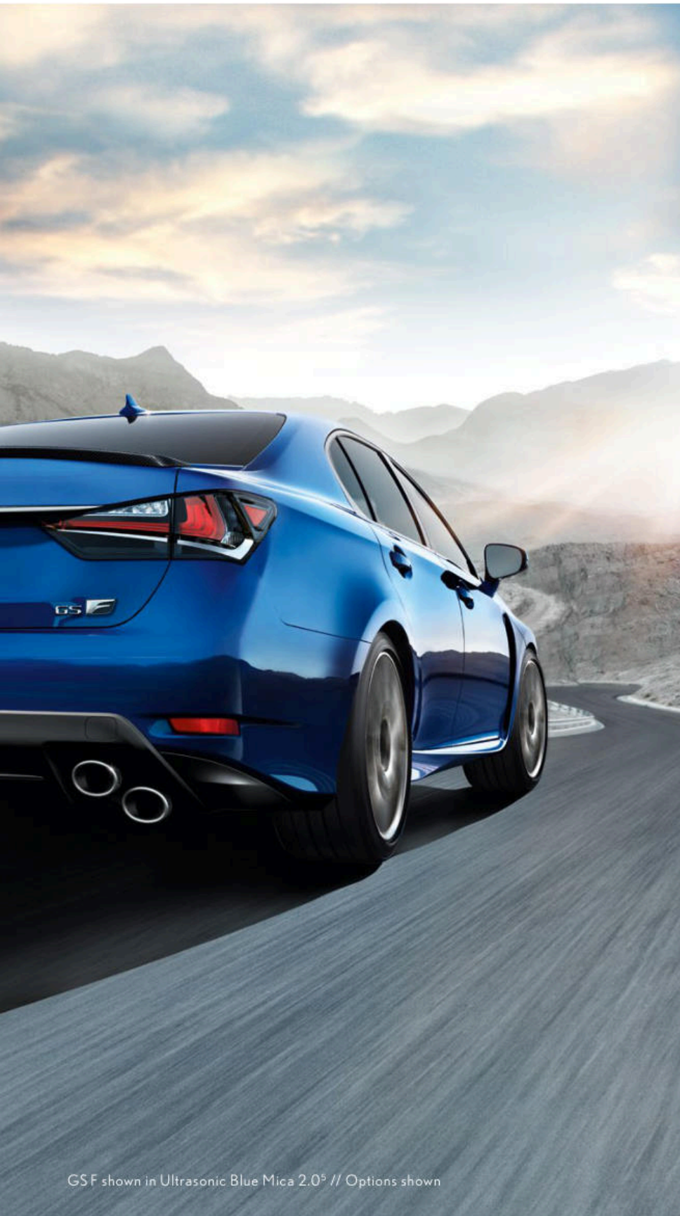
GSF shown in Ultrasonic Blue Mica 2.0 5 // Options shown