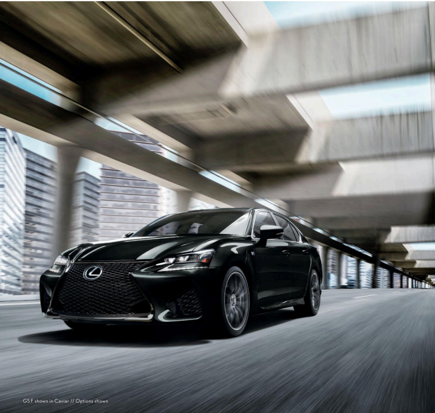
GSF shown in Caviar // Options shown