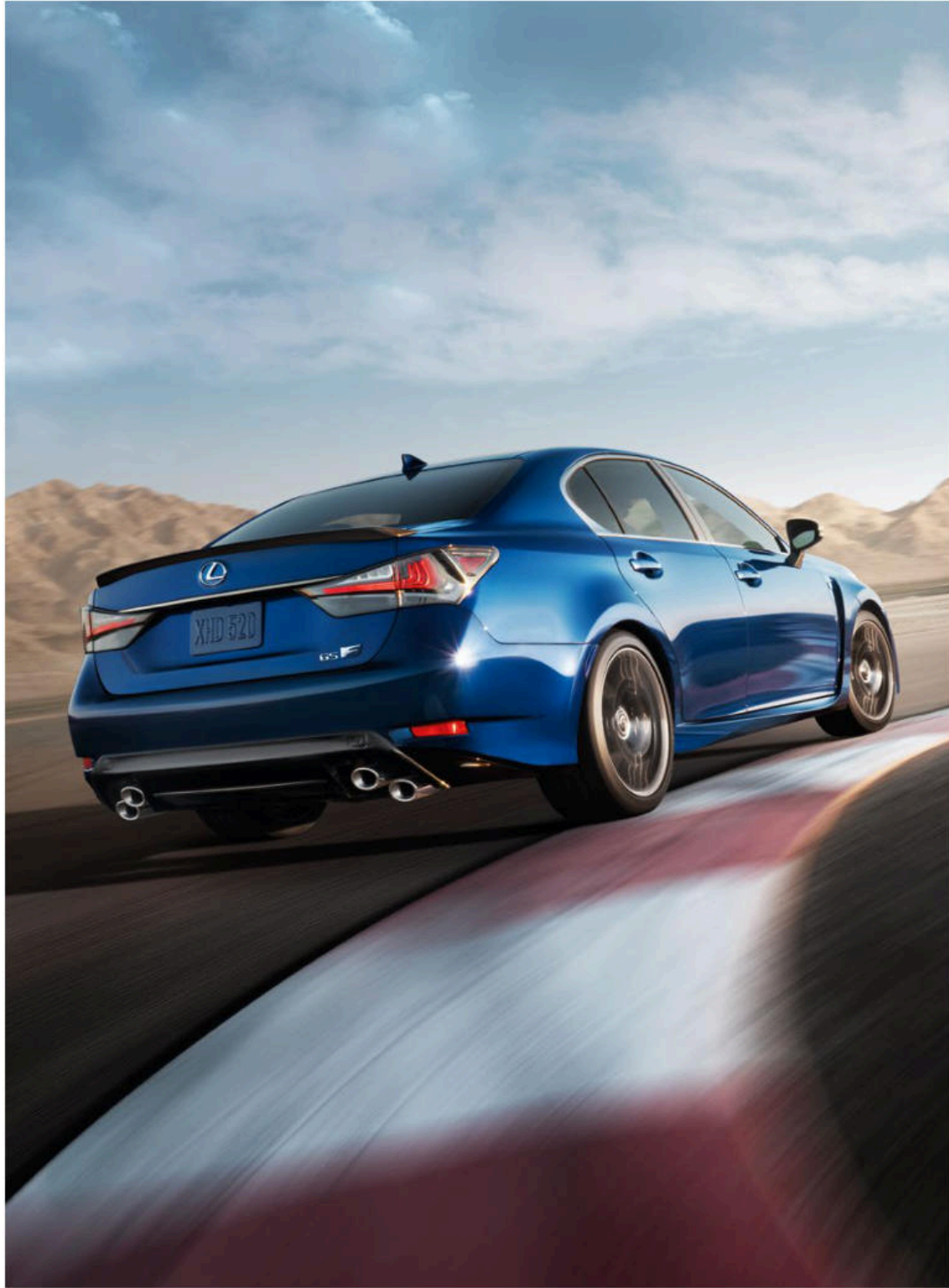
GS F shown in Ultrasonic Blue Mica 2.0 5 // Options shown

Born on the racetrack, built for the road.