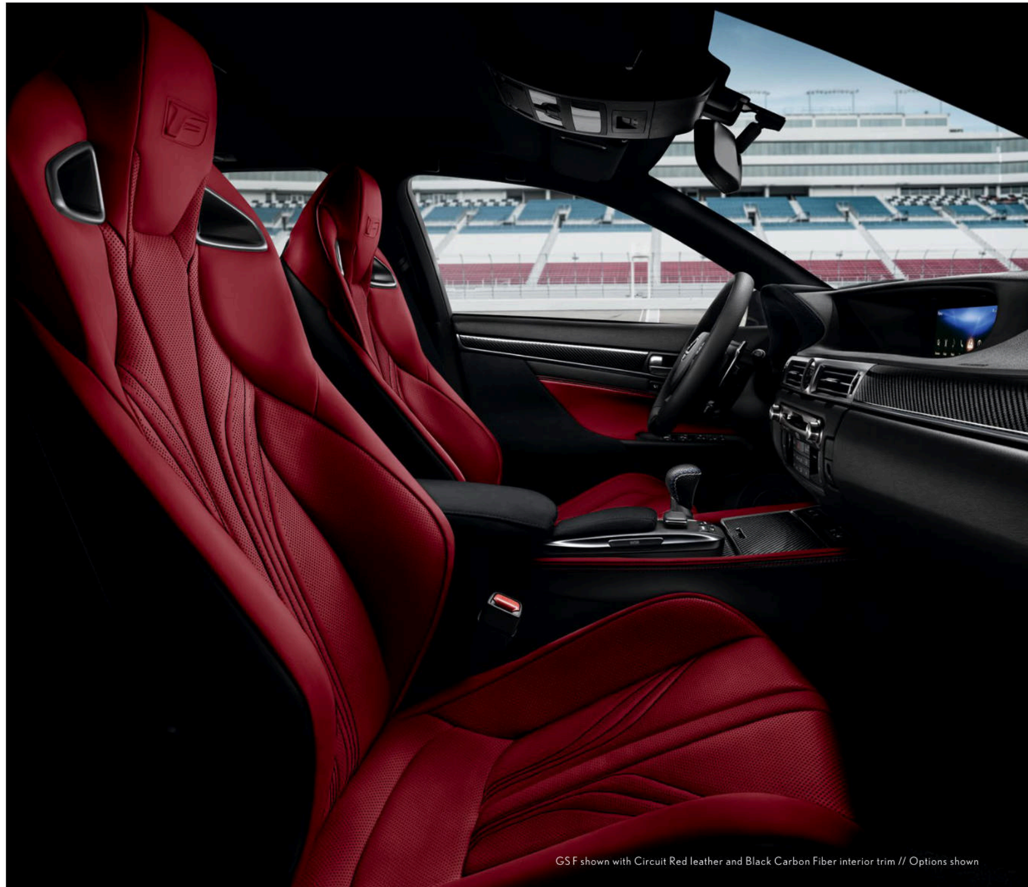
GSF shown with Circuit Red leather and Black Carbon Fiber interior trim // Options shown