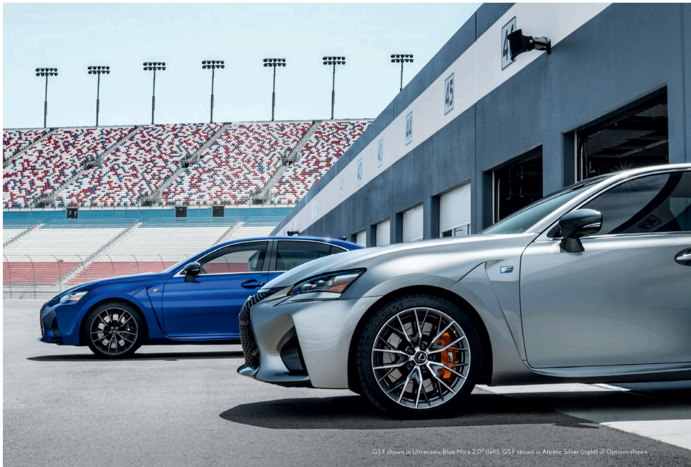
GS-F shown in Ultrasonic Blue Mica 2.0 ® (left), GS-F shown in Atomic Silver (right) // Options shown

Hand-polished split-10-spoke forged alloy wheels 4 by BBS AVAILABLE