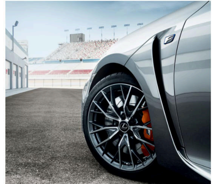
GS-F shown in Ultrasonic Blue Mica 2.0 5 // Options shown

The GS-F wasn't just built, but honed. Then honed again. Earning its F badge through exhaustive testing, tuning and engineering on iconic tracks like Fuji Speedway. Infused with knowledge gained from the RC F GT3 6 racing program and equipped with exclusive performance features, the GS-F is the most powerful sedan Lexus has ever made.