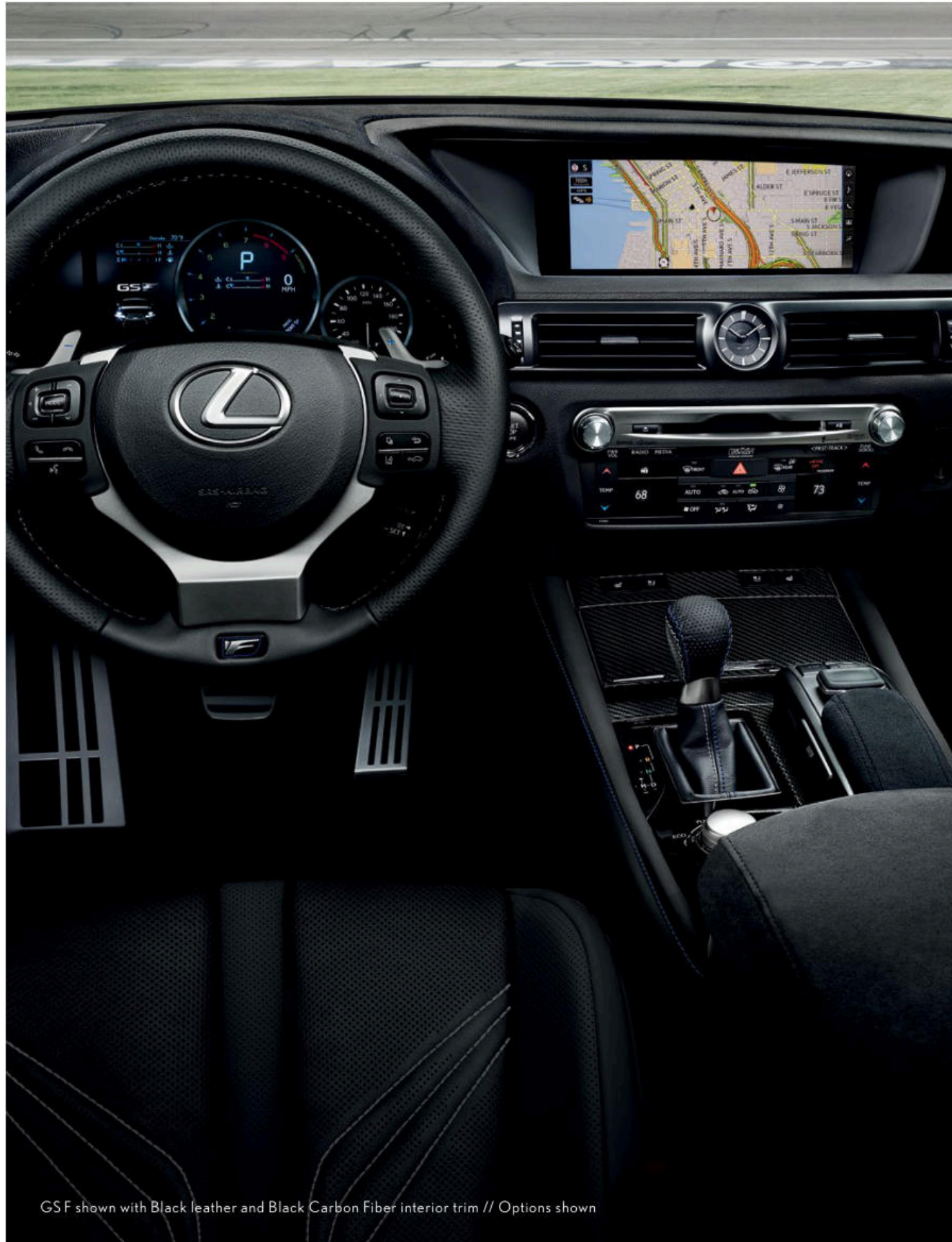
GS-F shown with Black leather and Black Carbon Fiber interior trim // Options shown