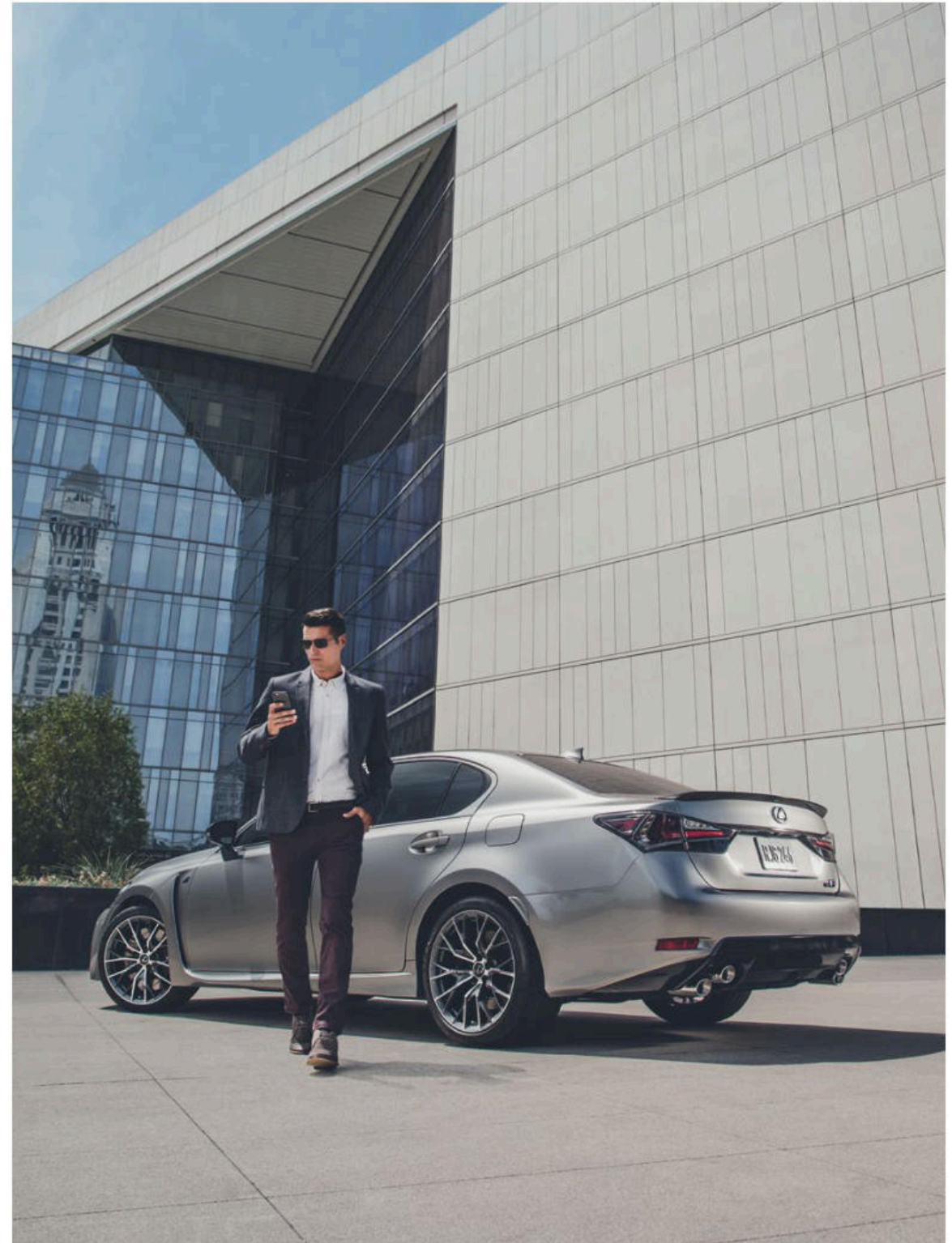
GSF shown in Atomic Silver // Options shown