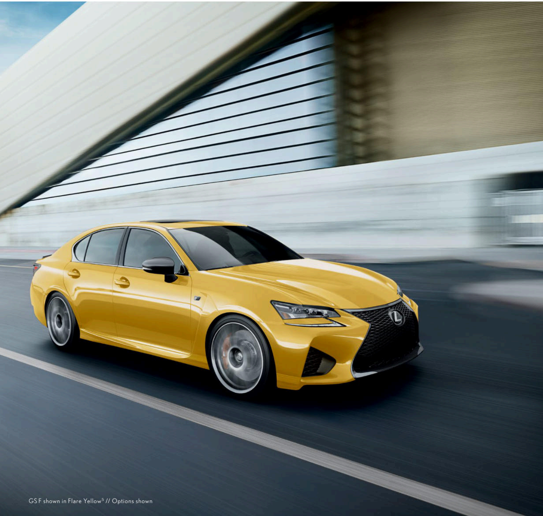
GSF shown in Flare Yellow 5 // Options shown