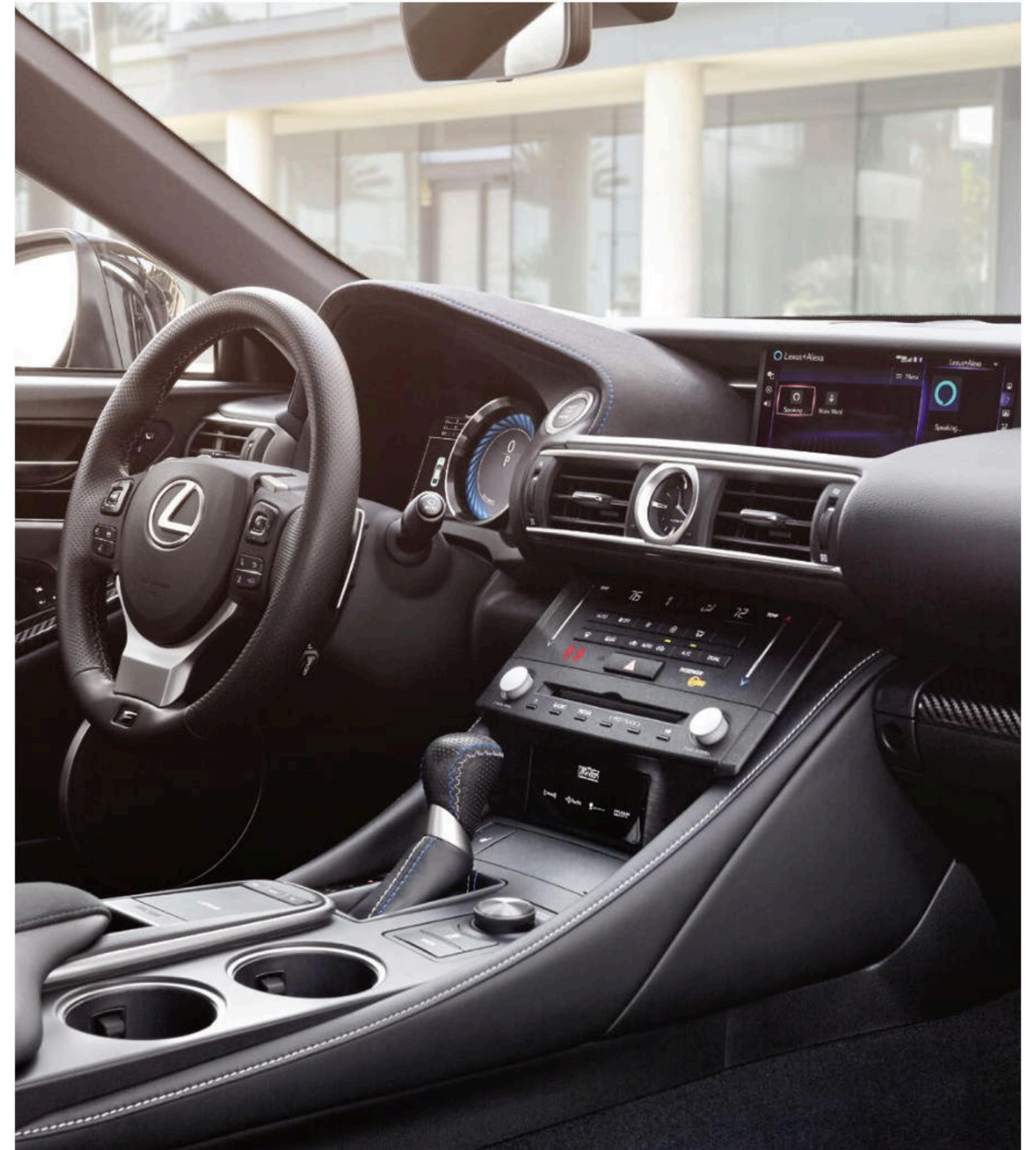
RC F shown with Black leather and Black Carbon Fiber interior trim // Options shown

Bring all the convenience of Amazon Alexa 3 on the road. Using only your voice, you can easily access thousands of the same skills you get with Alexa at home. Listen to audiobooks, stream Amazon Music, 3 make lists, check the weather, get news briefings and much more. You can also use it to control compatible smart-home devices such as lighting, thermostat and security systems. Offering added in-vehicle convenience, Alexa even syncs to your Navigation System 11 to provide on-the-go recommendations.