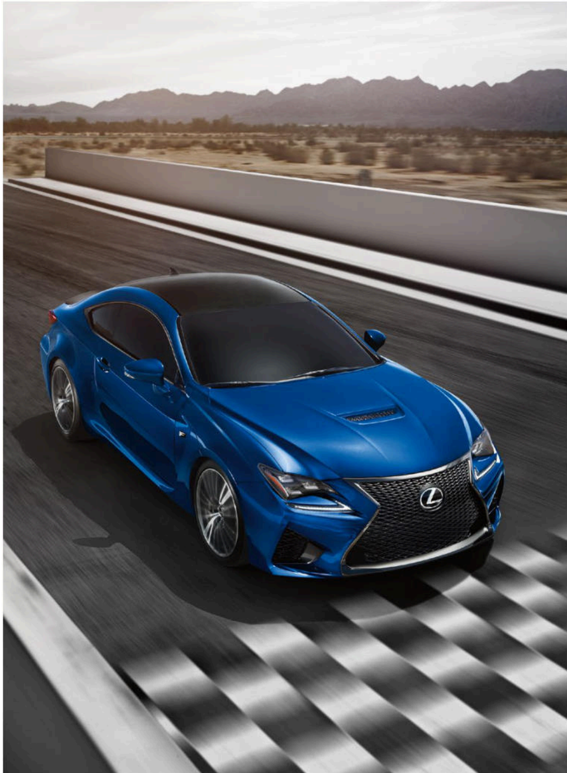
RC F shown in Ultrasonic Blue Mica 2.0 5 // Options shown