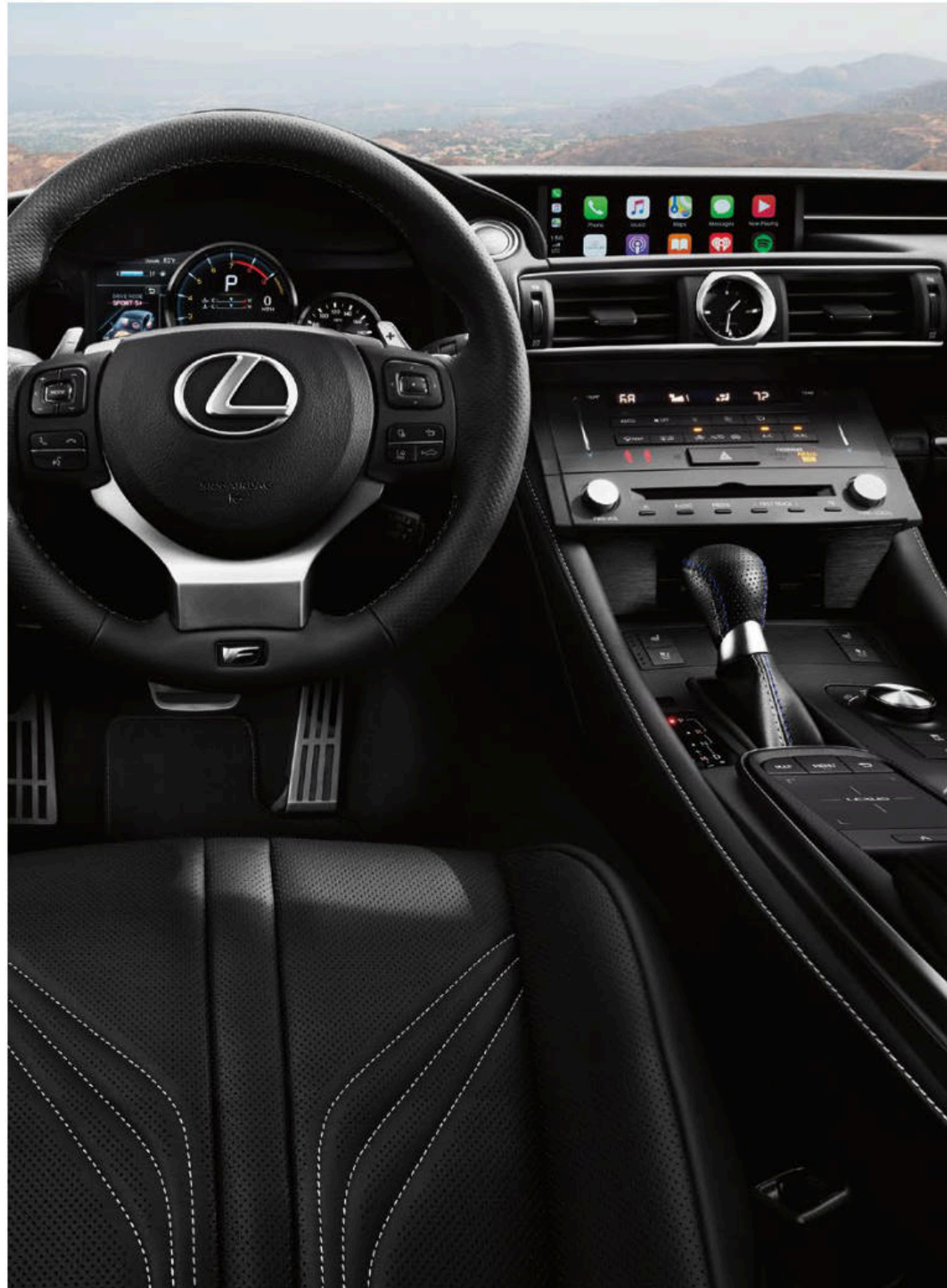
RC F shown with Apple CarPlay ®4 integration and Black leather interior trim // Options shown