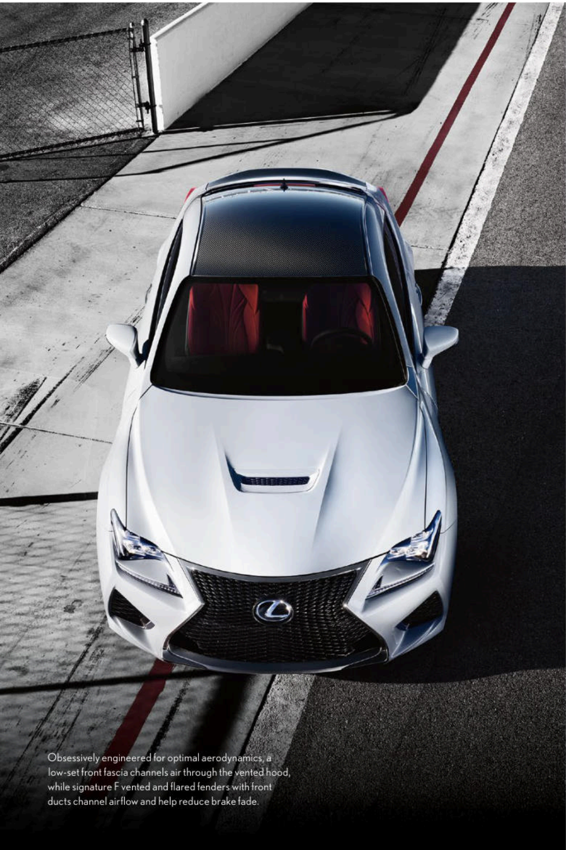
Obsessively engineered for optimal aerodynamics, a low-set front fascia channels air through the vented hood, while signature F vented and flared fenders with front ducts channel airflow and help reduce brake fade.