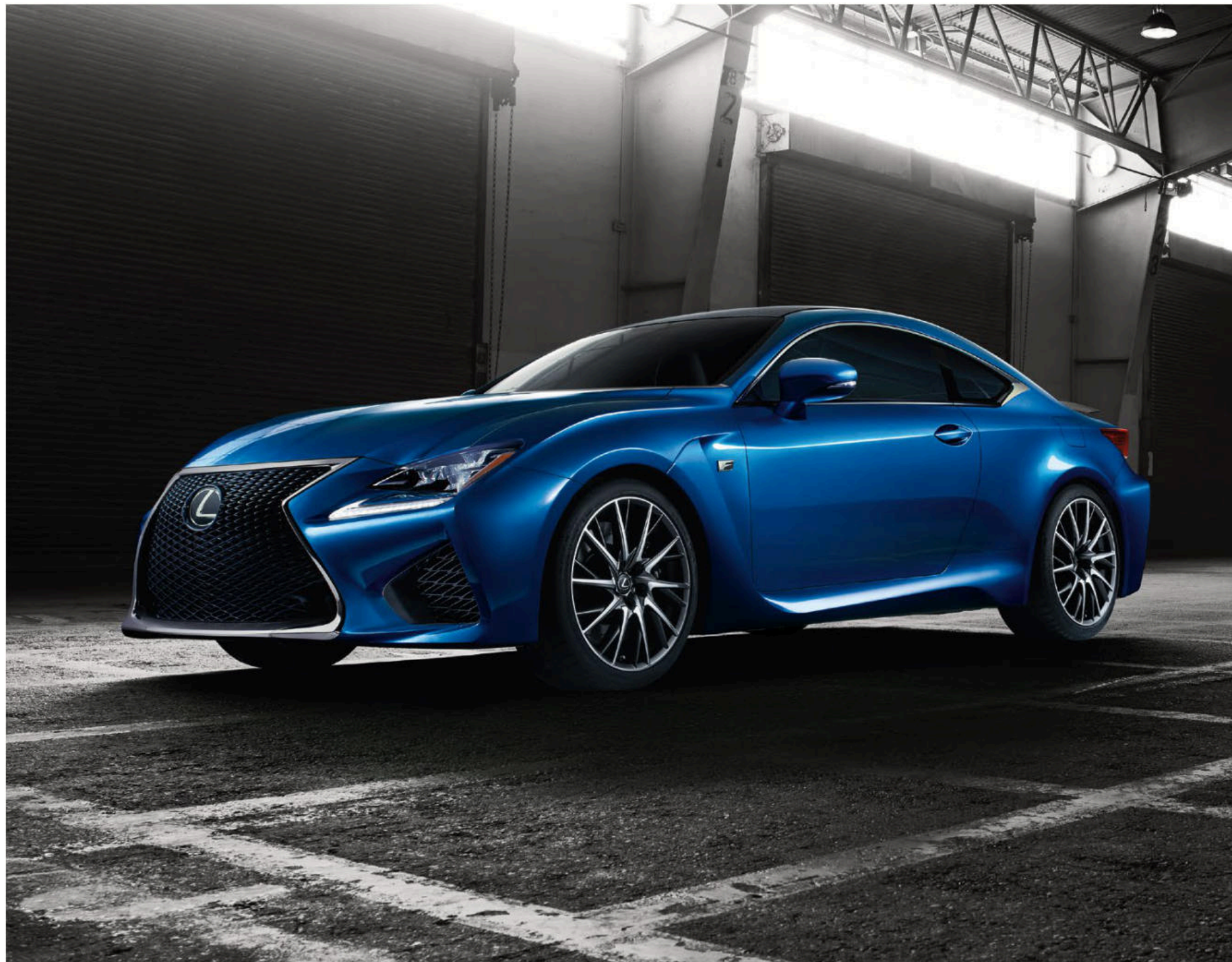
RC F shown in Ultrasonic Blue Mica 2.0 5 // Options shown