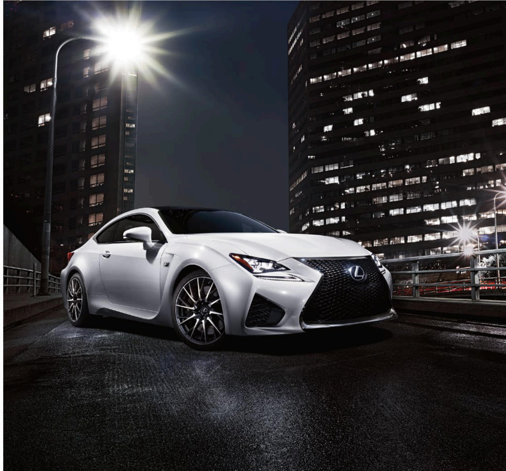
RC F shown in Ultra White // Options shown

Windshield wiper de-icer Headlamp washers Heated steering wheel