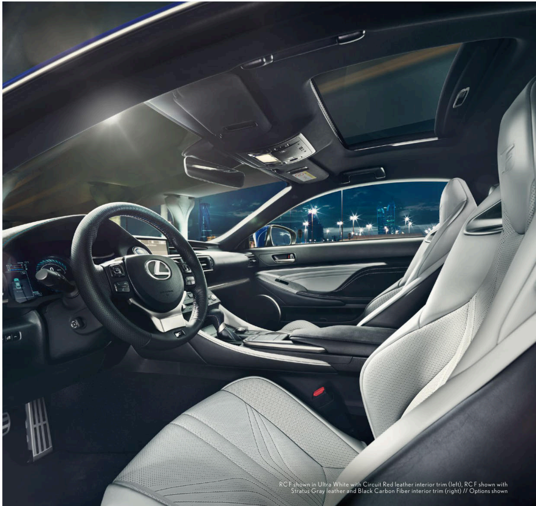
RC F shown in Ultra White with Circuit Red leather interior trim (left), RC F shown with Stratus Gray leather and Black Carbon Fiber interior trim (right) // Options shown