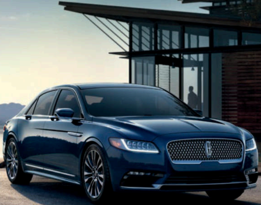
Lincoln Continental. Midnight Sapphire Blue Metallic. Available equipment. Pre-production model shown. Available Fall 2016.