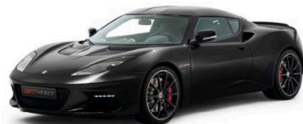
METALLIC DARK GREY C213

Images are for comparison use only, please speak to your local dealer for physical print samples.