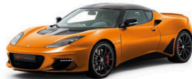
METALLIC ORANGE C205