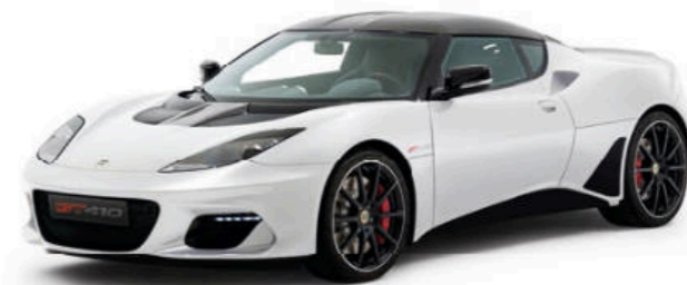
METALLIC WHITE C201