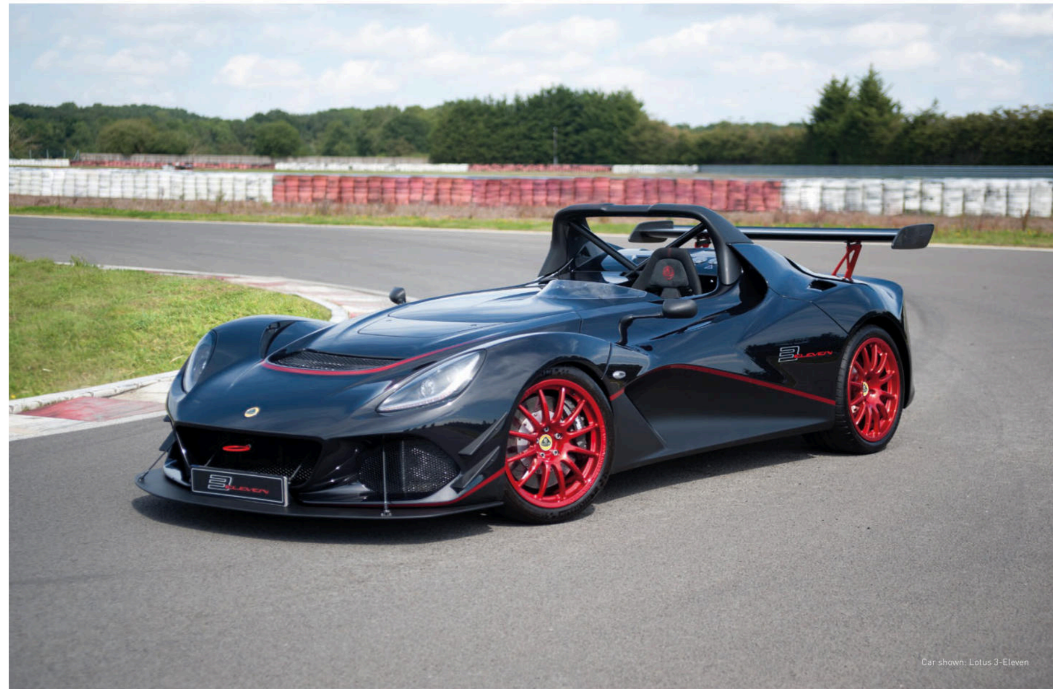
Car shown: Lotus 3-Eleven