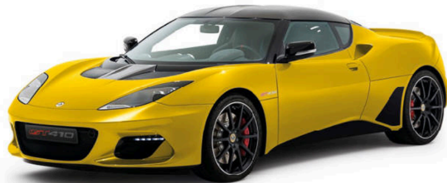
SOLID YELLOW C206