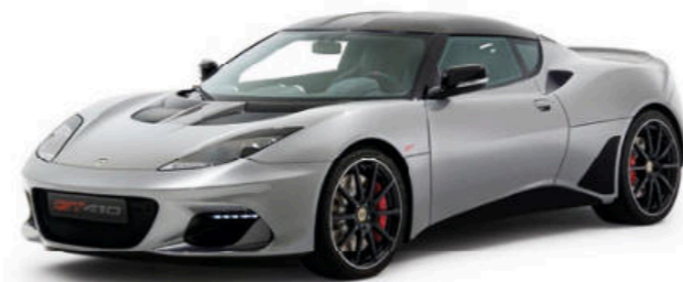
METALLIC SILVER C190