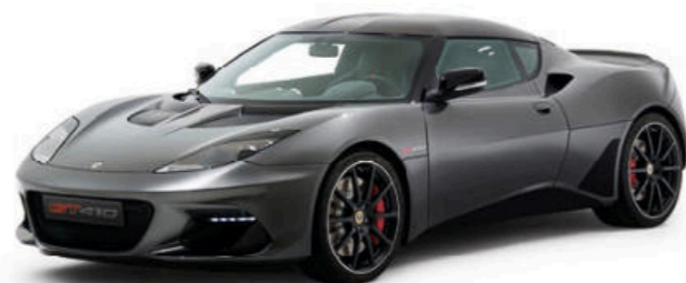
METALLIC GREY C185