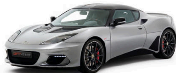
EVORA SILVER C180