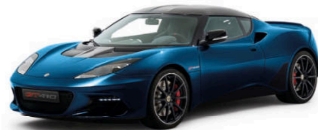
METALLIC BLUE C202