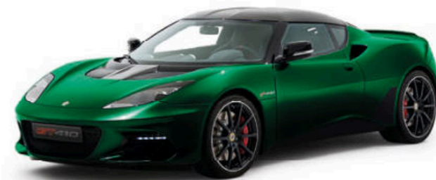
RACING GREEN C203