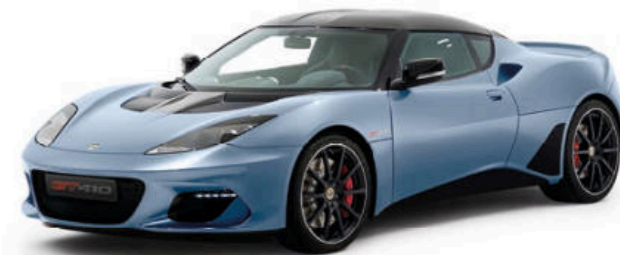
METALLIC LIGHT BLUE C208