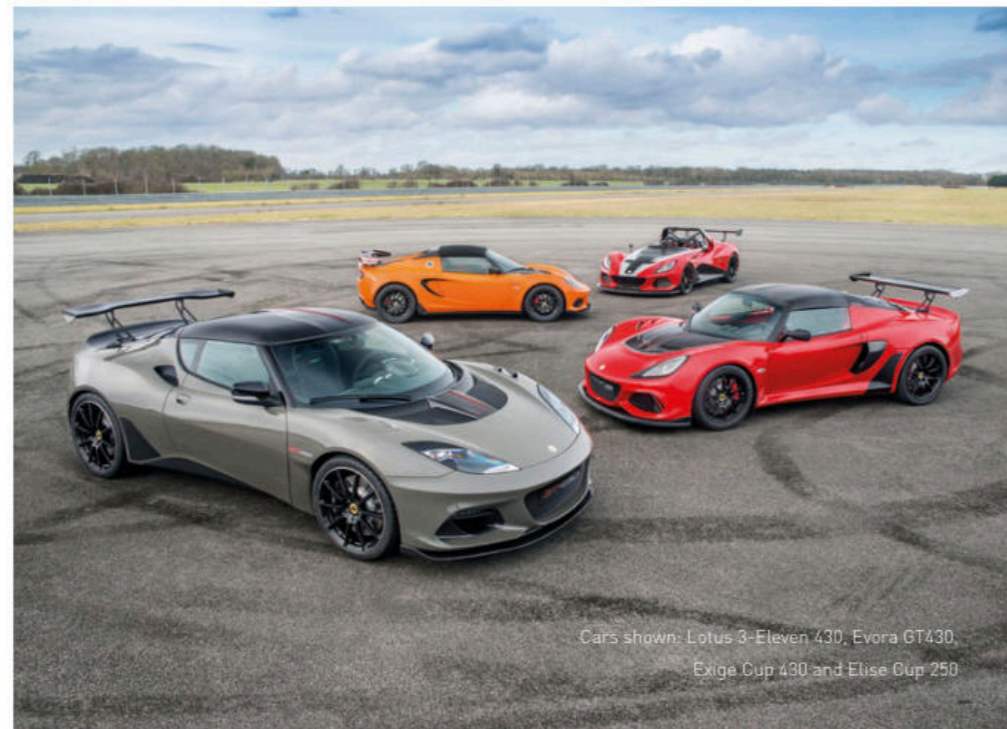
Cars shown: Lotus 3-Eleven 430, Evora GT430, Exige Cup 430 and Elise Cup 250

Today, the Lotus Lightweight Laboratory maintains Colin Chapman's legacy and ensures that his ethos is applied to every new model. After a complete strip down, every component is assessed and optimized through redesign, change of material, change of supplier or integration. If one part can be made to do the job of several, this is where it happens. Improvement is continuous. The quest to add lightness never ends. The result is the fastest, most exciting, most capable range of road cars Lotus has ever built.