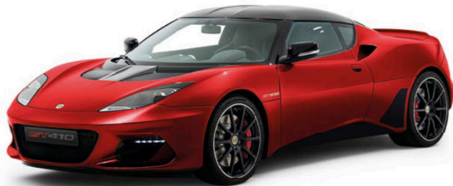
SOLID RED C183