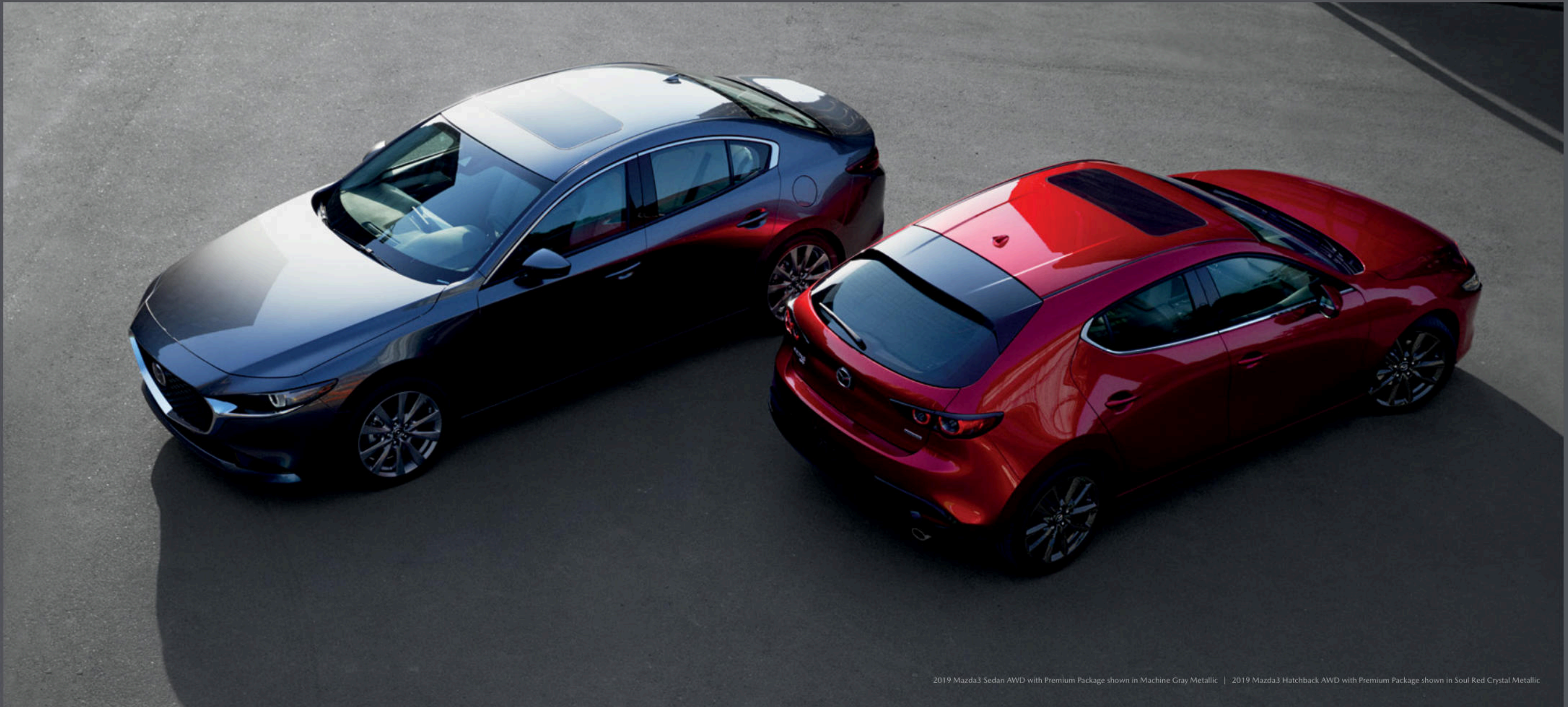
2019 Mazda3 Sedan AWD with Premium Package shown in Machine Gray Metallic | 2019 Mazda3 Hatchback AWD with Premium Package shown in Soul Red Crystal Metallic