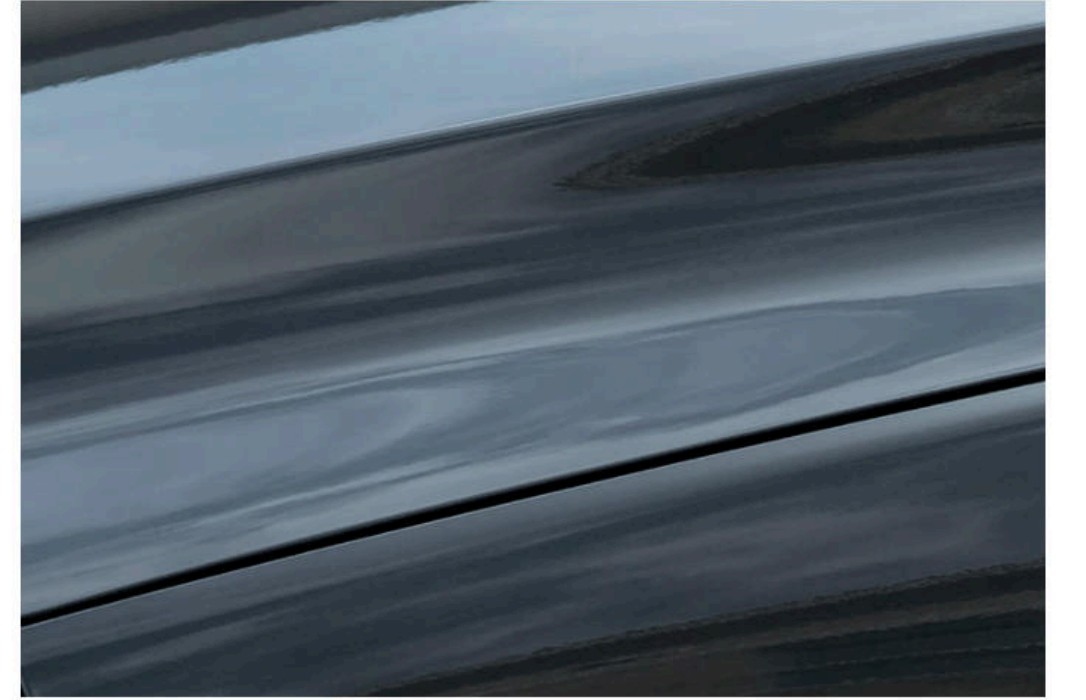
From left to right: Machine Gray Metallic, Soul Red Crystal Metallic, Polymetal Gray Metallic