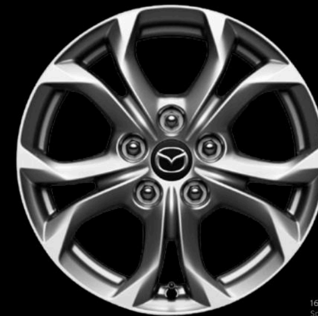
16" Alloy Sport

EVEN THE WHEELS TELL OUR STORY | Power. Balance. Beauty. Mazda's KODO design philosophy is evident across every aspect of the CX-3—right down to its alloy wheels.