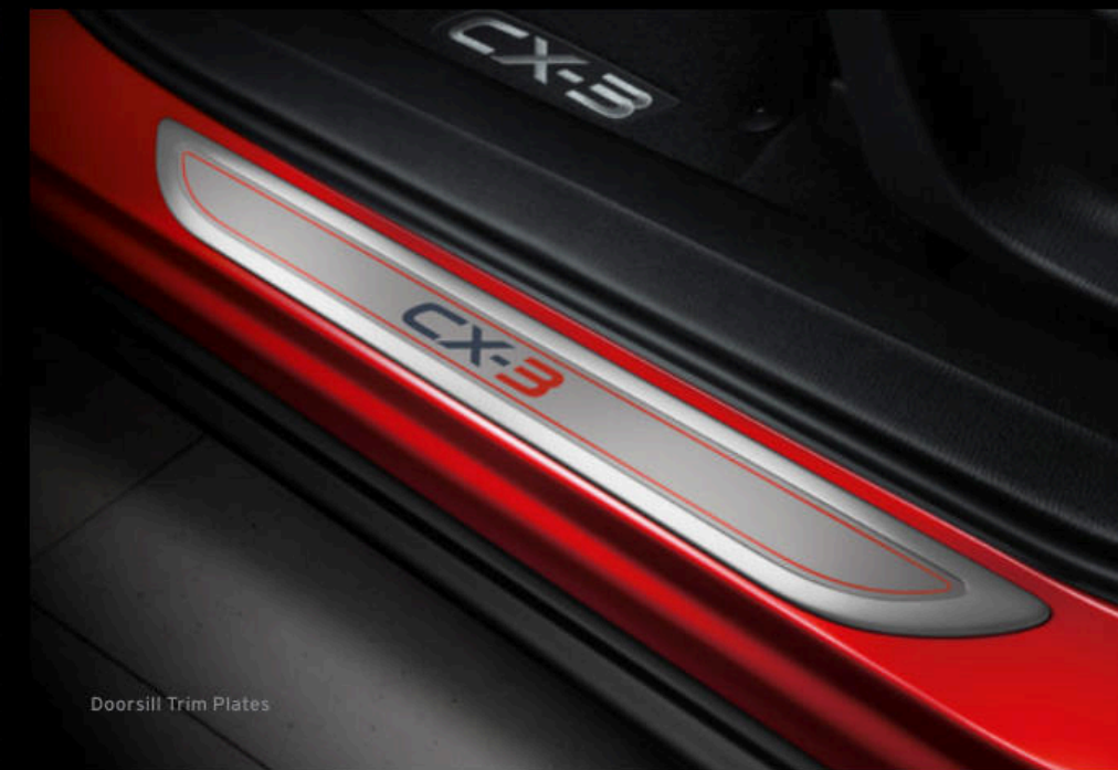
Doorsill Trim Plates