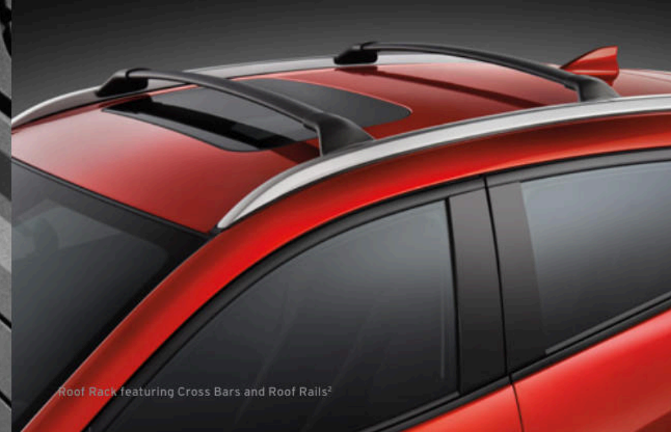
Roof Rack featuring Cross Bars and Roof Rails 2