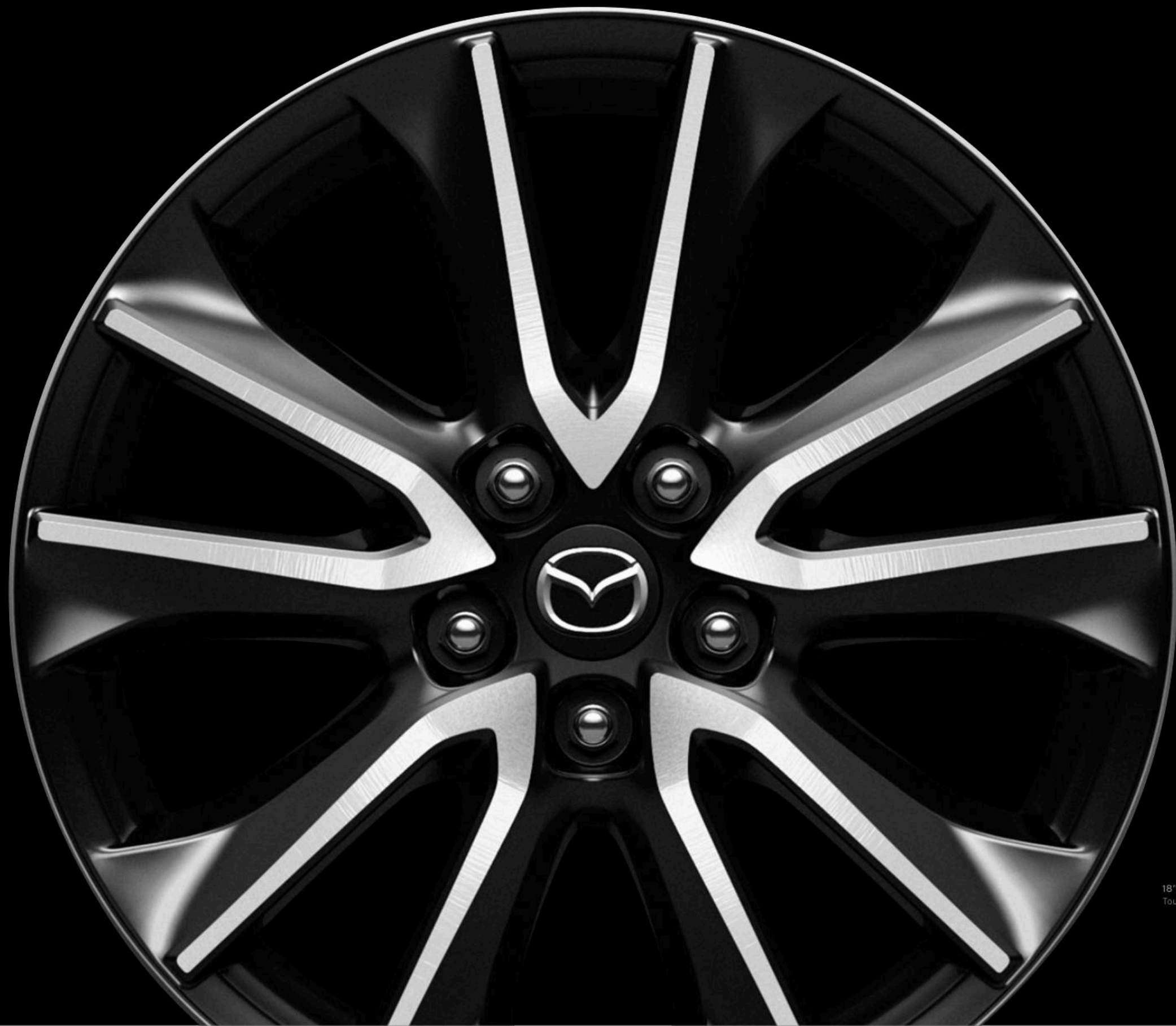
18" Alloy Touring and Grand Touring