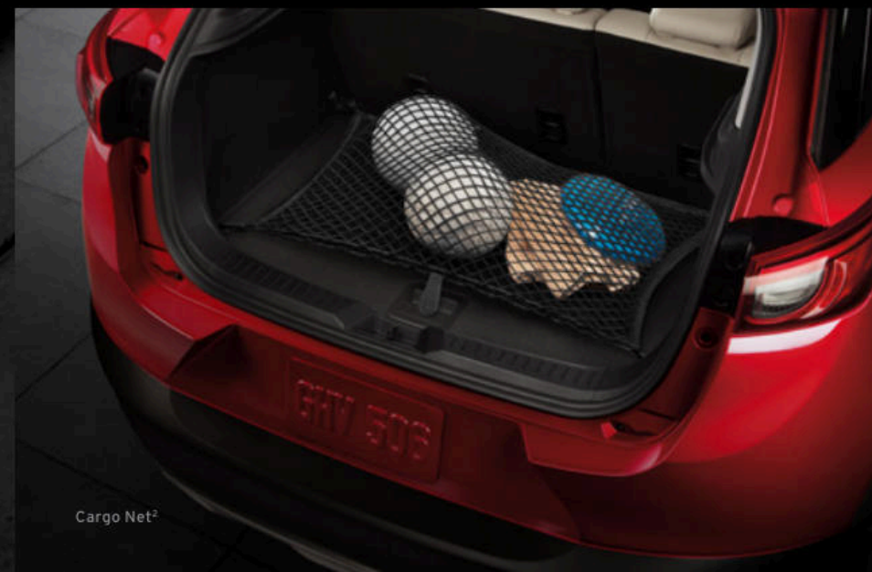
Cargo Net 2