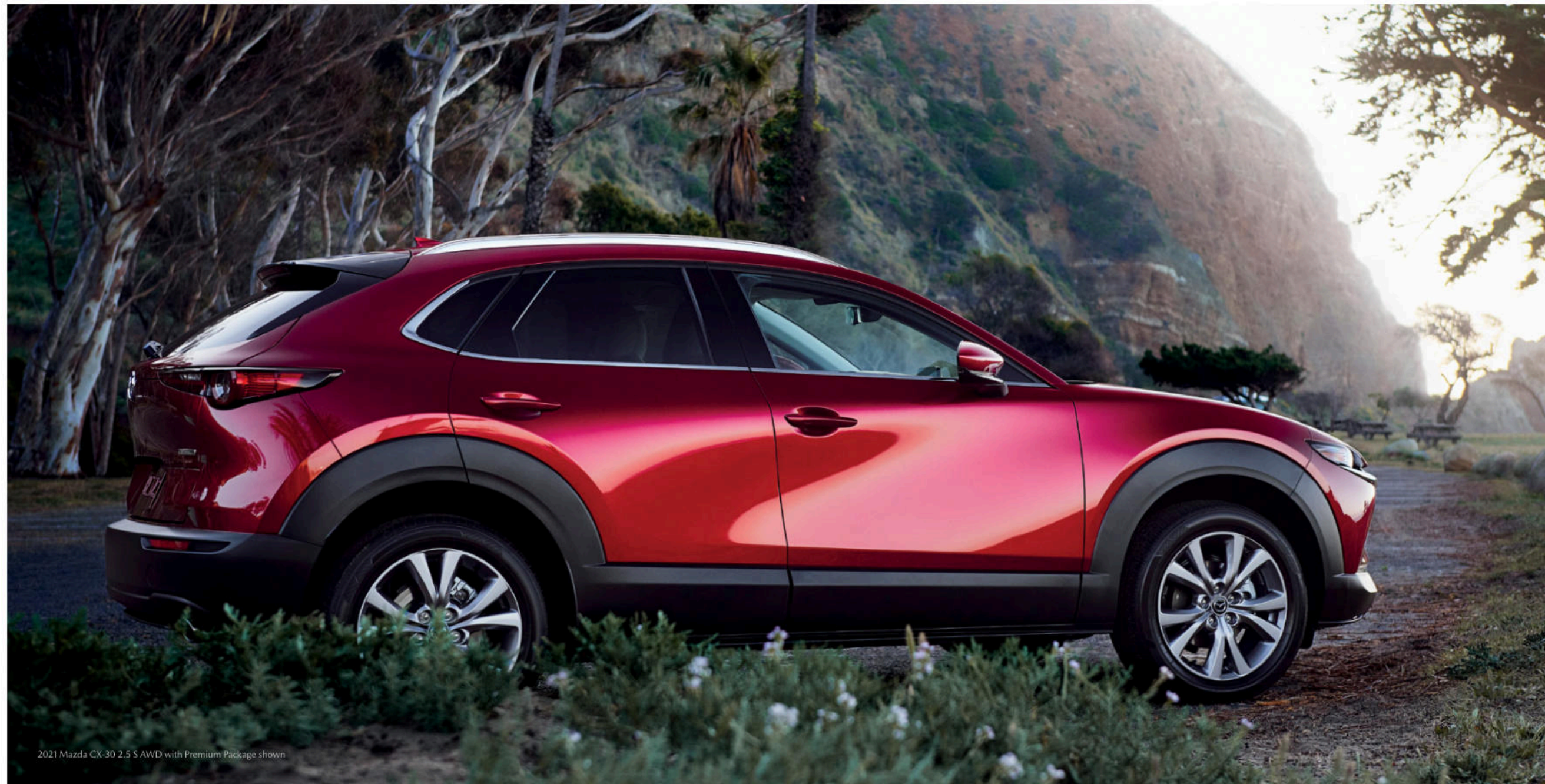
2021 Mazda CX-30 2.5 S AWD with Premium Package shown