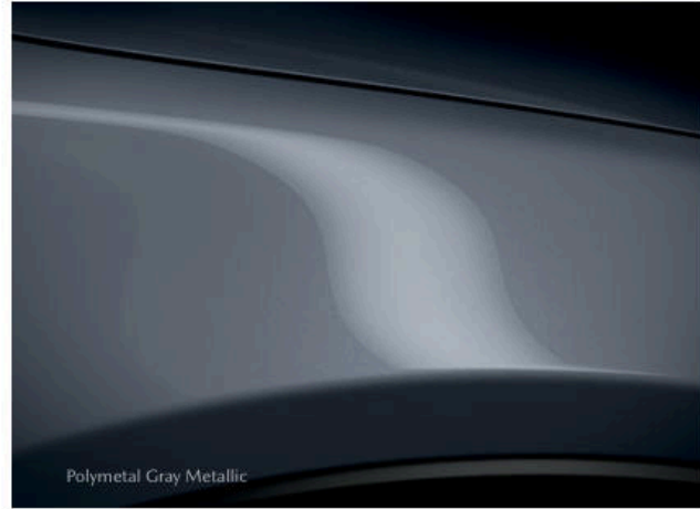
Polymetal Gray Metallic