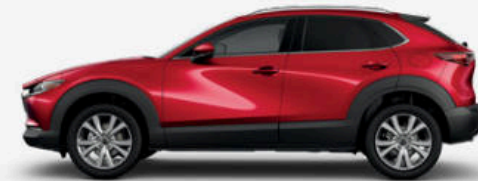
CX-30 2.5 S PREMIUM

Power side mirrors with memory and tilt-in-reverse function Front grille with Gloss Black finish 8-way power-adjustable driver's seat with power-adjustable lumbar support and 2-position memory Heated front seats with three-level adjustment Overhead console with sunglass holder Power sliding-glass moonroof with one-touch open and tilt feature Driver's and front passenger's illuminated vanity mirror