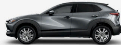
CX-30 2.5 S PREFERRED

18-inch alloy wheels with P215/55 R18 tires Body-color folding power side mirrors with integrated LED turn signals Rear privacy glass Dual-zone automatic climate control Rear air conditioning vents Leatherette-trimmed seats Leather-wrapped steering wheel and gear selector Mazda Advanced Keyless Entry System Rear-seat center armrest with cup holders Blind Spot Monitoring 5 Rear Cross Traffic Alert 5