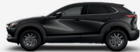
CX-30 2.5 S