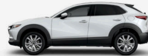
CX-30 2.5 S SELECT

Electronic parking brake Advanced front airbags, front side-impact airbags and side-impact air curtains 4 Driver's and front passenger's knee airbag 4 Smart Brake Support 6 Driver Attention Alert 7 Mazda Radar Cruise Control with Stop & Go 8 Lane Departure Warning System 9 Lane-keep Assist 9 High Beam Control Dynamic Stability Control 10 and Traction Control System Rearview camera 11 Engine-immobilizer anti-theft system Tire Pressure Monitoring System LATCH child-seat anchors and upper tethers