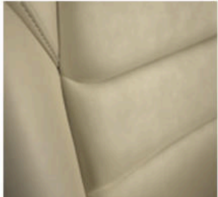
Silk Beige Leatherette/Lux Suede® inserts Touring