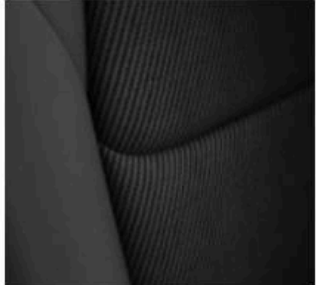
Black Cloth Sport