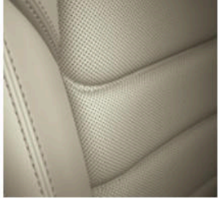
Parchment Leather Grand Touring and Grand Touring Reserve