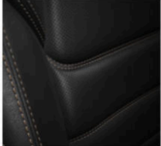
Black Leather Grand Touring and Grand Touring Reserve

Upholstery plays a unique role in automotive design. It is the one element that makes direct contact with the driver and passengers throughout the entire drive. Every inch of our carefully constructed upholstery elevates your journey in both beauty and comfort. Expert fabricators experiment with textures, stitching and seam placements to create a range of distinct and expressive designs. So you can enjoy an elegant level of refinement in every Mazda CX-5. It's one more way we consider you in every aspect of your drive.