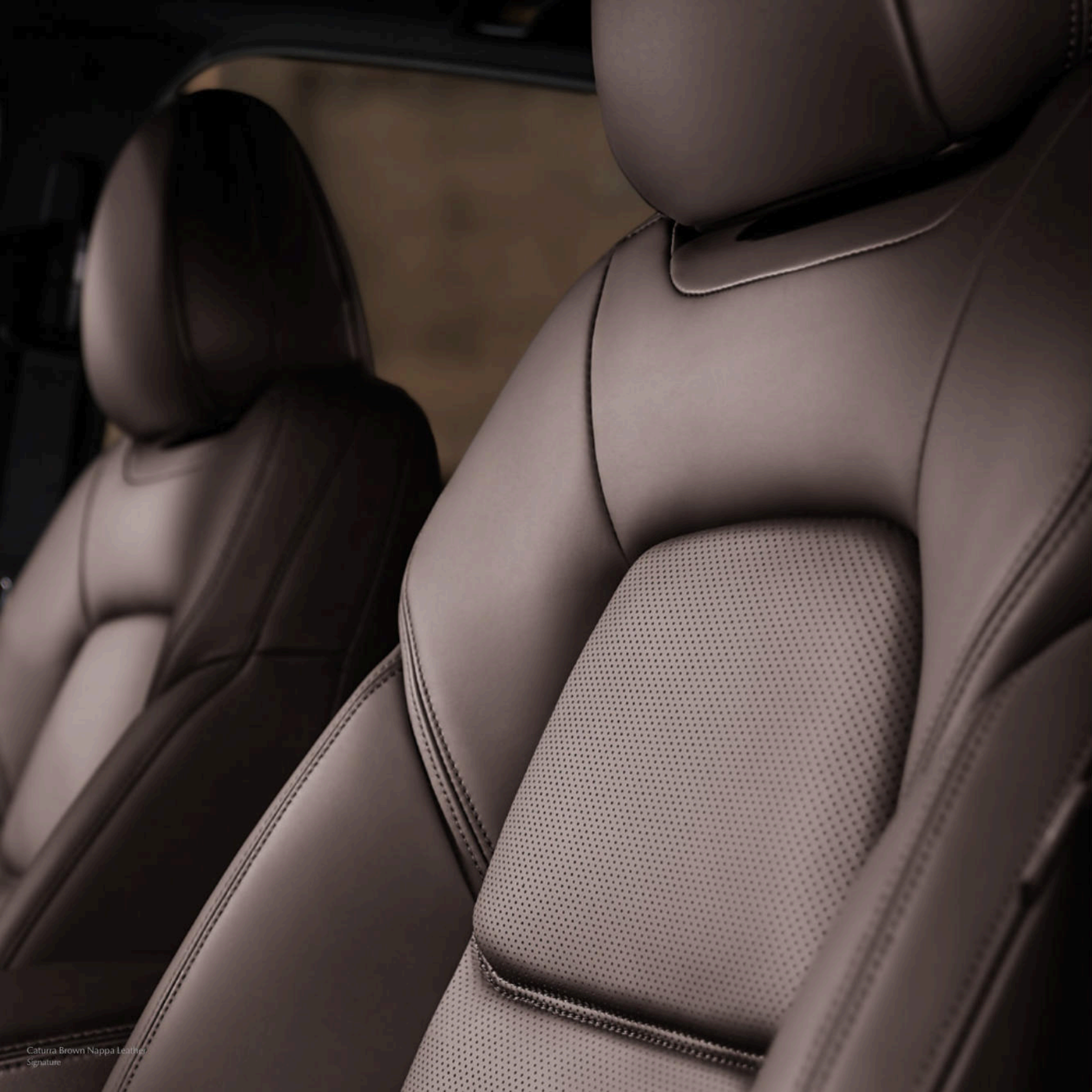
Caturra Brown Nappa Leather Signature