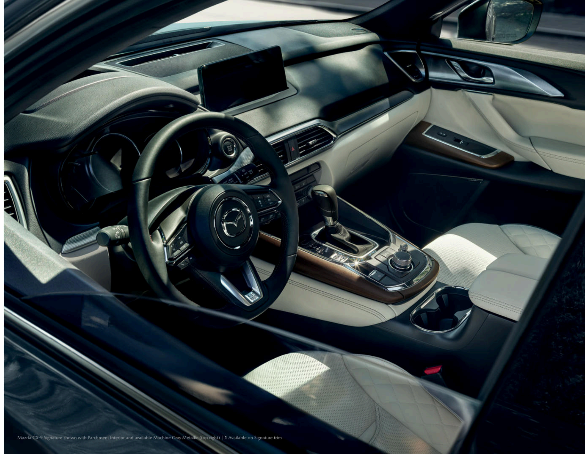
Mazda CX-9 Signature shown with Parchment Interior and available Machine Gray Metallic (top right) | 1 Available on Signature trim