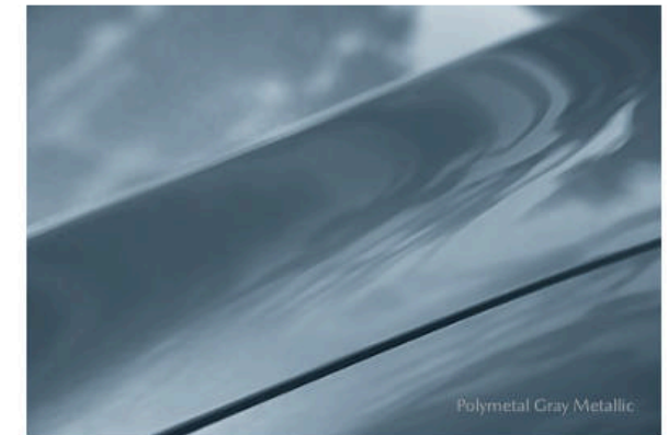
Polymetal Gray Metallic

Our daring array of lustrous finishes—including the new Polymetal Gray Metallic offered on Carbon Edition models—may be the final touch on the CX-9, but it is the first thing that will catch your eye. And it will continue to draw your gaze, time and time again.