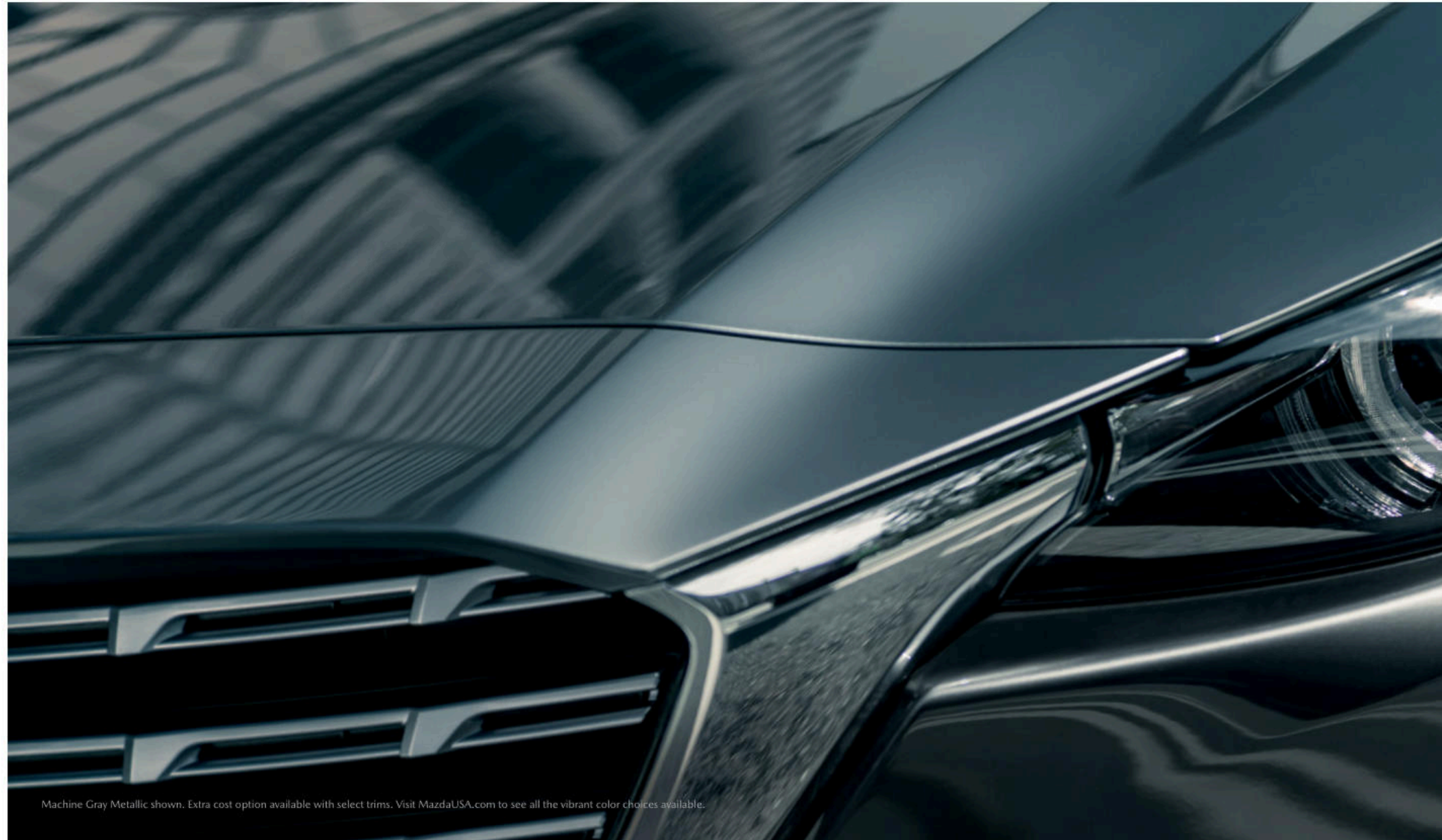
Machine Gray Metallic shown. Extra cost option available with select trims. Visit MazdaUSA.com to see all the vibrant color choices available.