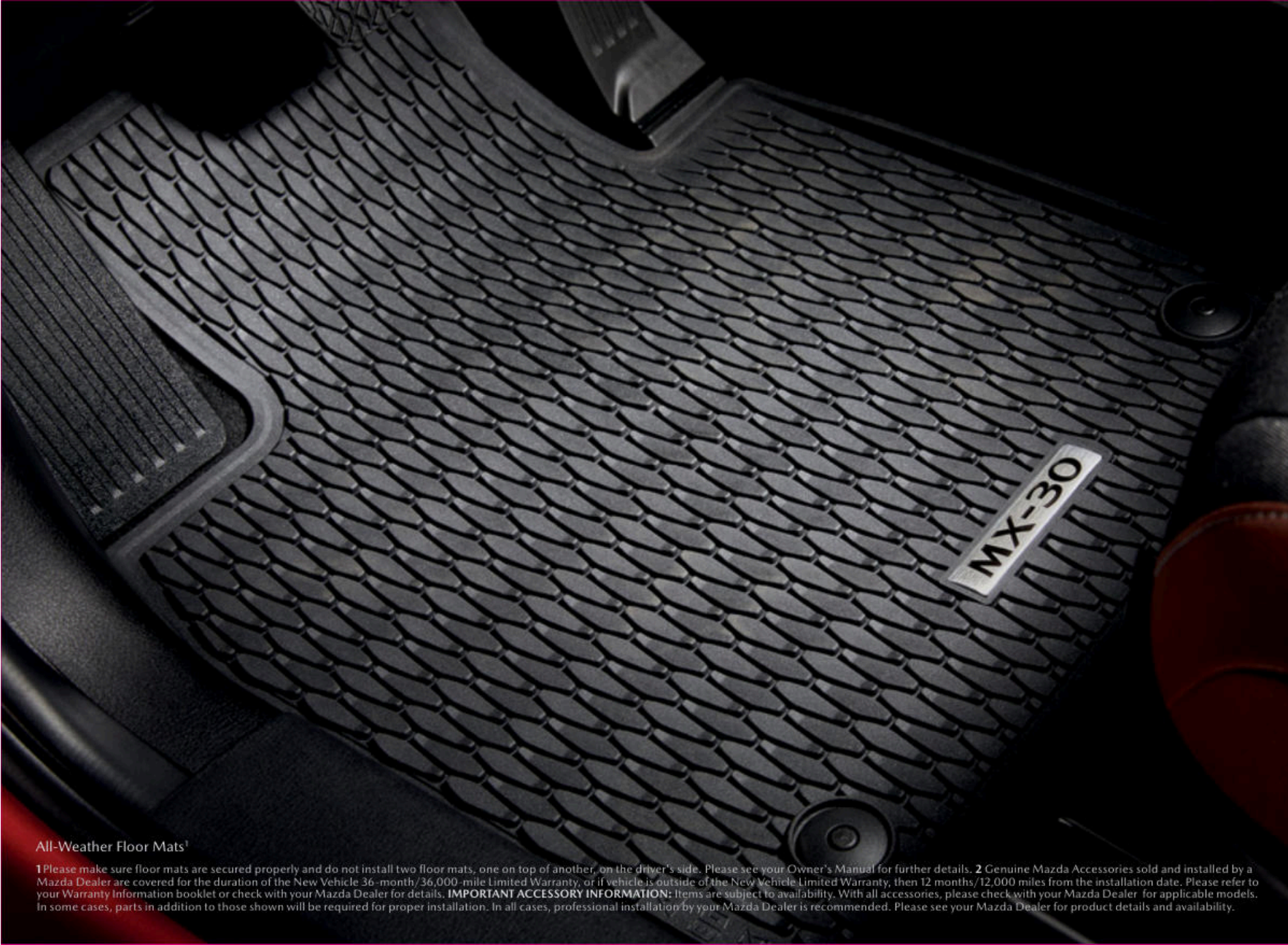
All-Weather Floor Mats 1

1 Please make sure floor mats are secured properly and do not install two floor mats, one on top of another, on the driver's side. Please see your Owner's Manual for further details. 2 Genuine Mazda Accessories sold and installed by a Mazda Dealer are covered for the duration of the New Vehicle 36-month/36,000-mile Limited Warranty, or if vehicle is outside of the New Vehicle Limited Warranty, then 12 months/12,000 miles from the installation date. Please refer to your Warranty Information booklet or check with your Mazda Dealer for details. IMPORTANT ACCESSORY INFORMATION: Items are subject to availability. With all accessories, please check with your Mazda Dealer for applicable models. In some cases, parts in addition to those shown will be required for proper installation. In all cases, professional installation by your Mazda Dealer is recommended. Please see your Mazda Dealer for product details and availability.