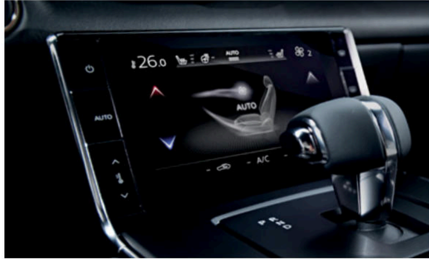
Standard touchscreen automatic climate control