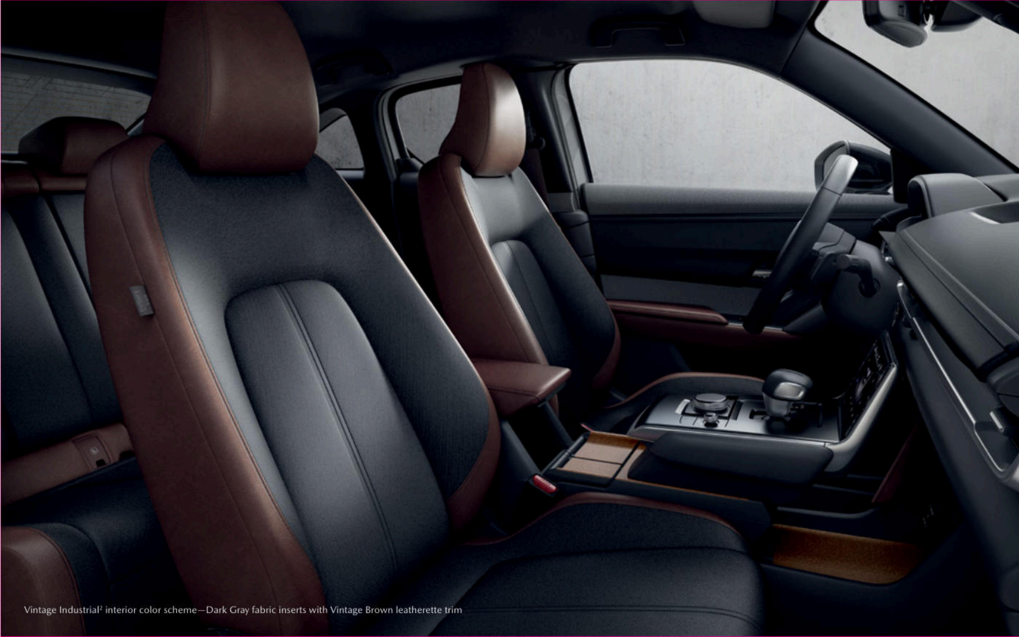
Vintage Industrial 2 interior color scheme—Dark Gray fabric inserts with Vintage Brown leatherette trim