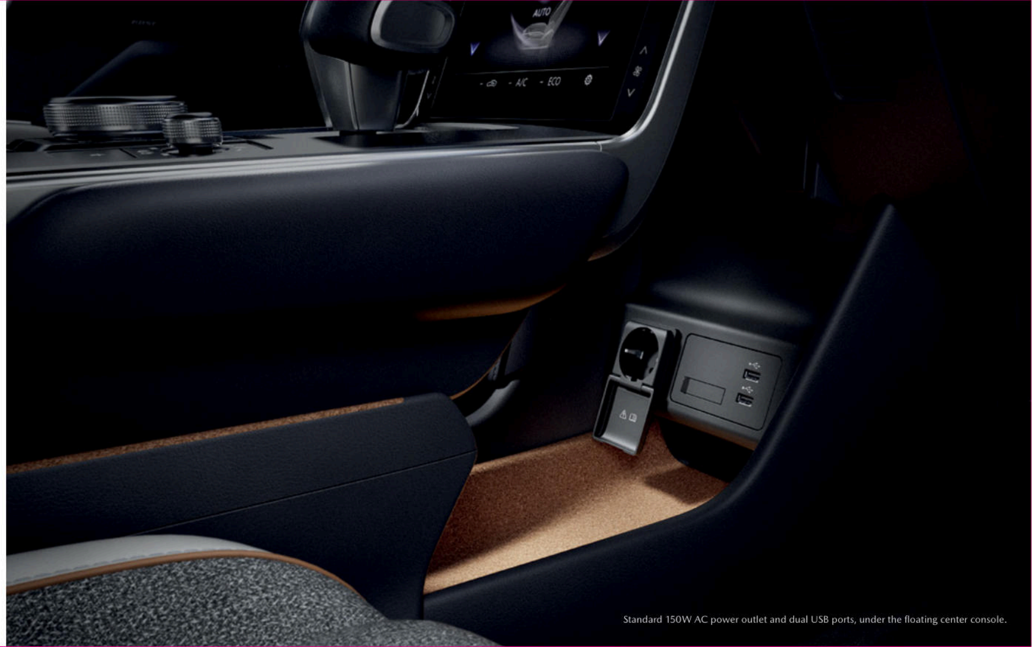
Standard 150W AC power outlet and dual USB ports, under the floating center console.