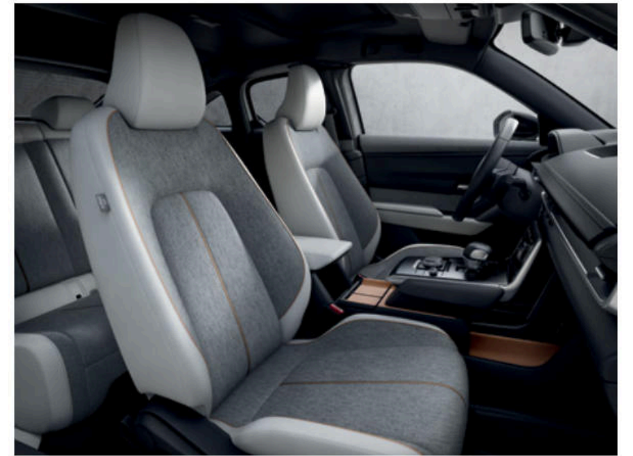
Modern Confidence 1,2 interior color scheme—Light Gray fabric inserts with Pure White leatherette trim