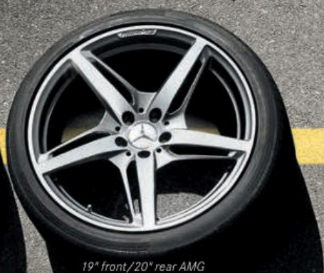
19" front/20" rear AMG split 5-spoke, Titanium