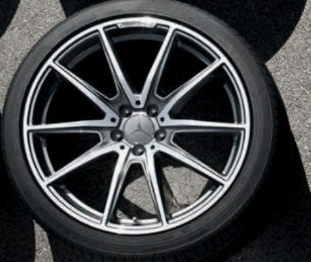
19" front/20" rear AMG twin 5-spoke, Titanium (standard)