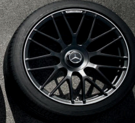
19" front/20" rear AMG forged cross-spoke, Black