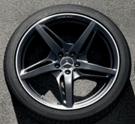
19" front/20" rear AMG split 5-spoke, Black