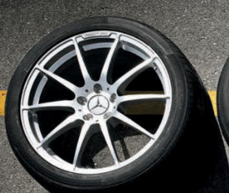
19" front/20" rear AMG forged 10-spoke, Titanium