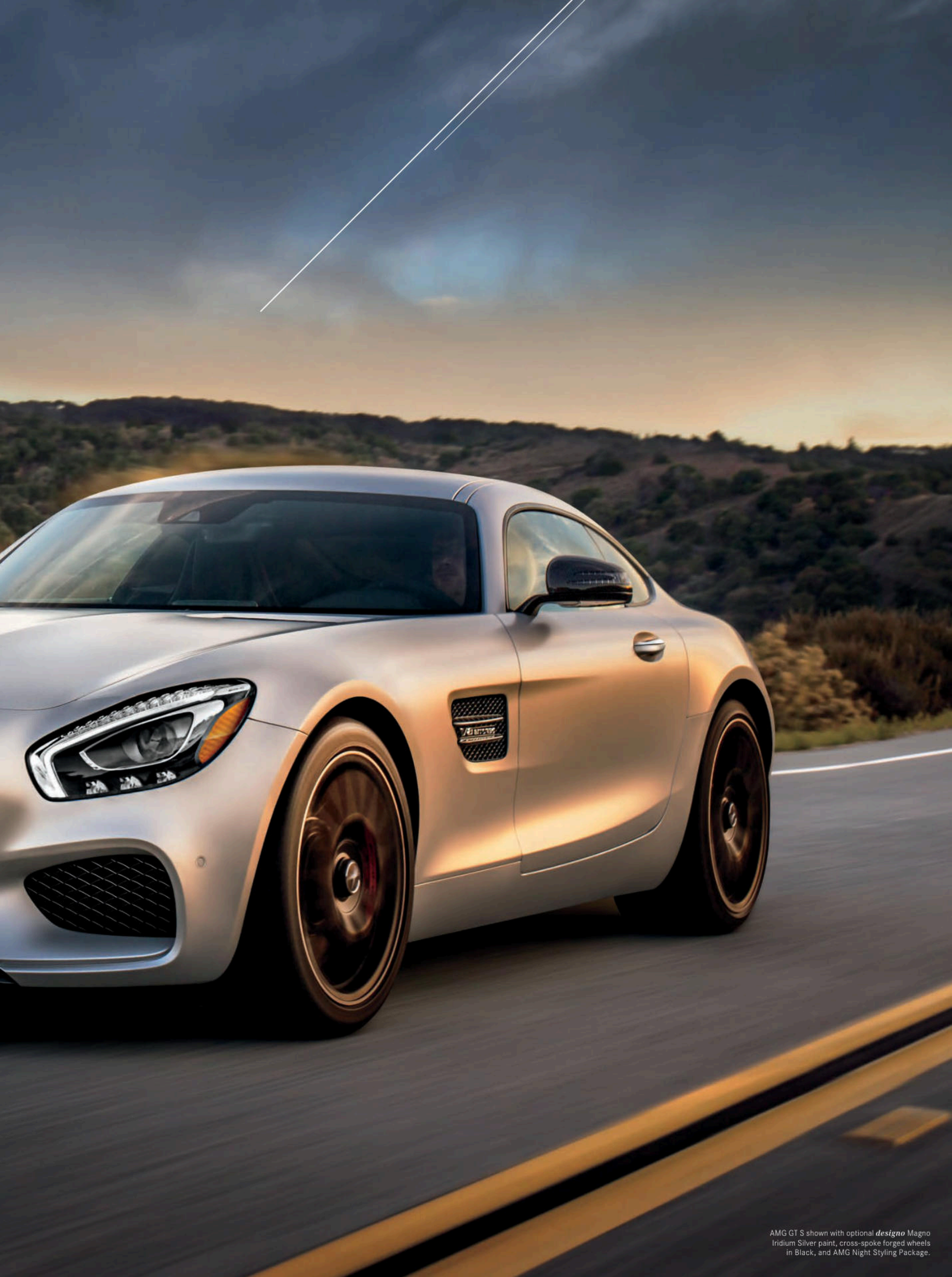
AMG GT S shown with optional designo Magno Iridium Silver paint, cross-spoke forged wheels in Black, and AMG Night Styling Package.