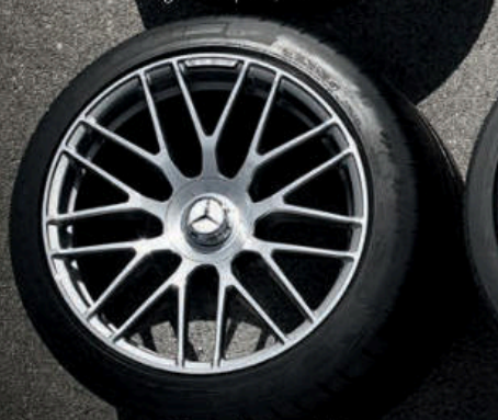
19" front/20" rear AMG forged cross-spoke, Titanium