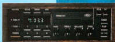
High-level electronic AM stereo/FM stereo cassette audio system.

All models feature formal coach lamps. (Vinyl roofs are available on sedans only.)