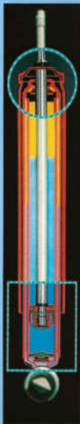
Nitrogen gas-pressurized shock absorbers at all four wheels improve ride and handling.

smooth power is supplied by Grand Marquis' 5.0-liter V-8. The engine features sequential multi-port electronic fuel injection to enhance performance and fuel economy.*