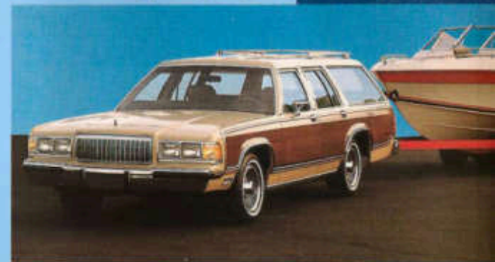
Trailer towing is easy with Grand Marquis optional trailer towing package. It allows Grand Marquis sedan and Colony Park wagon to tow up to 5,000 pounds.