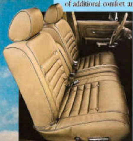
Full grain leather seating surfaces are optional on LS sedan and wagon models.

While Grand Marquis comes standard with an attractive color-coordinated half vinyl roof, you may also order an optional formal coach roof.