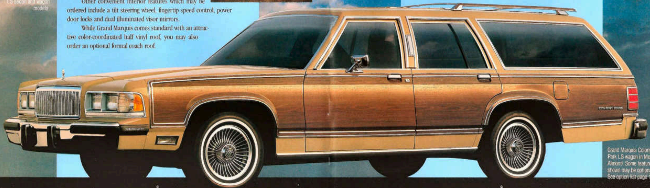
Grand Marquis Colony Park LS wagon in Medium Almond. Some features shown may be optional. See option list page 12.