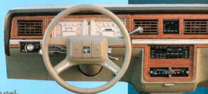
Grand Marquis instrument panel with optional high-level audio system. Some features shown may be optional. See option list page 12.

Grand Marquis GS sedans and GS wagons come with 15-inch white sidewall all-season steel-belted radial tires with luxury full wheel covers. Turbine spoke aluminum wheels are offered on all models. For a more formal appearance, locking wire-style wheel covers may be ordered on GS sedans.