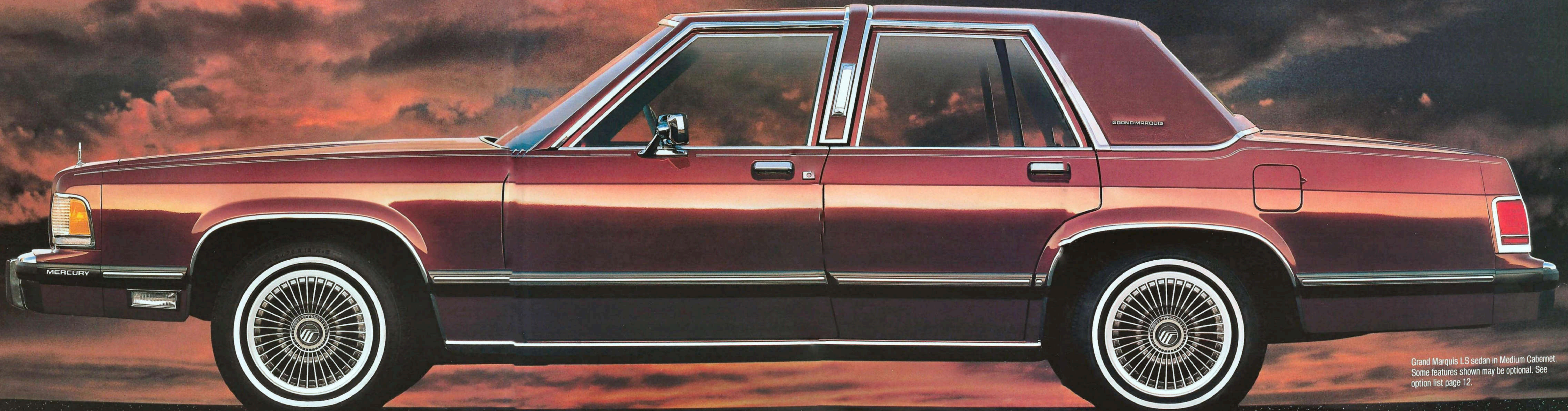
Grand Marquis LS sedan in Medium Cabernet. Some features shown may be optional. See option list page 12.