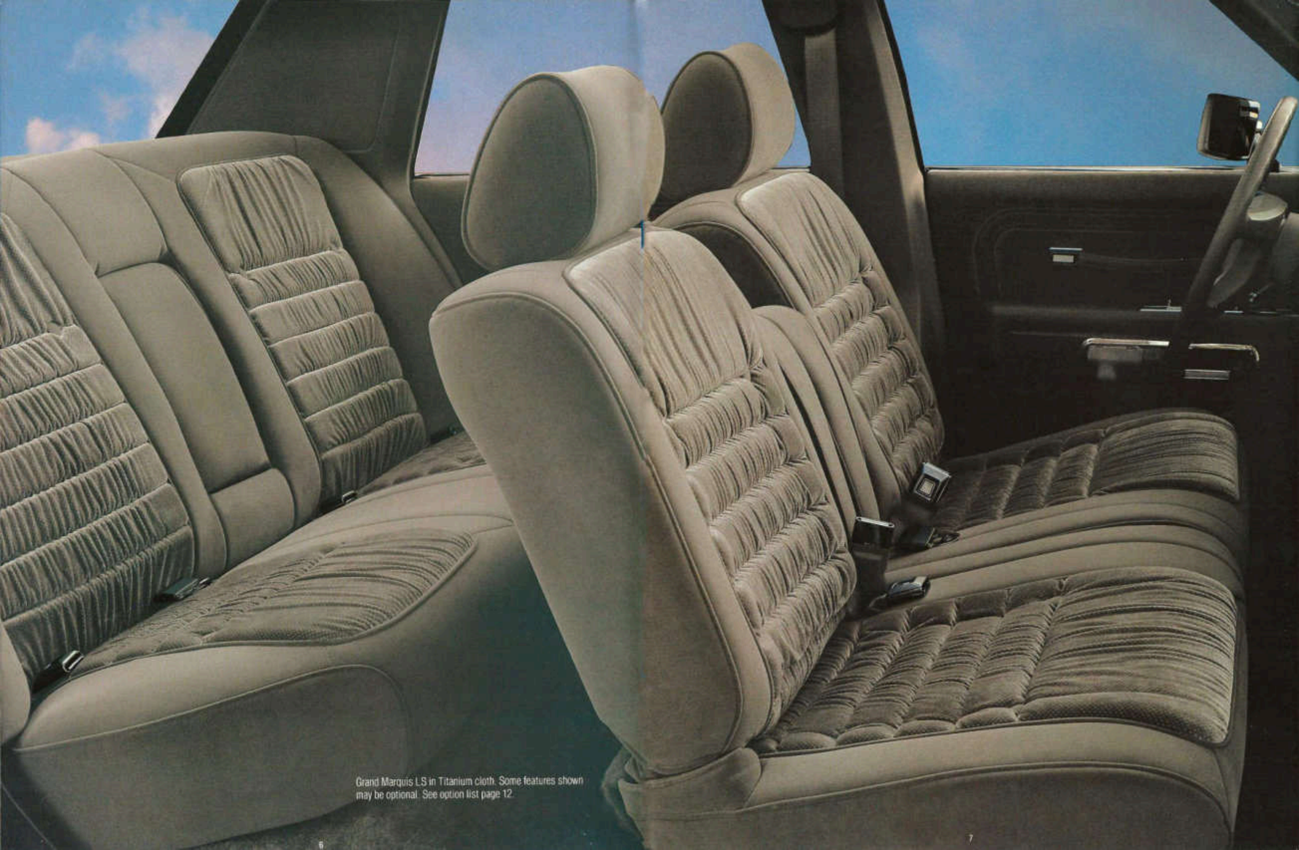
Grand Marquis LS in Titanium cloth. Some features shown may be optional. See option list page 12.