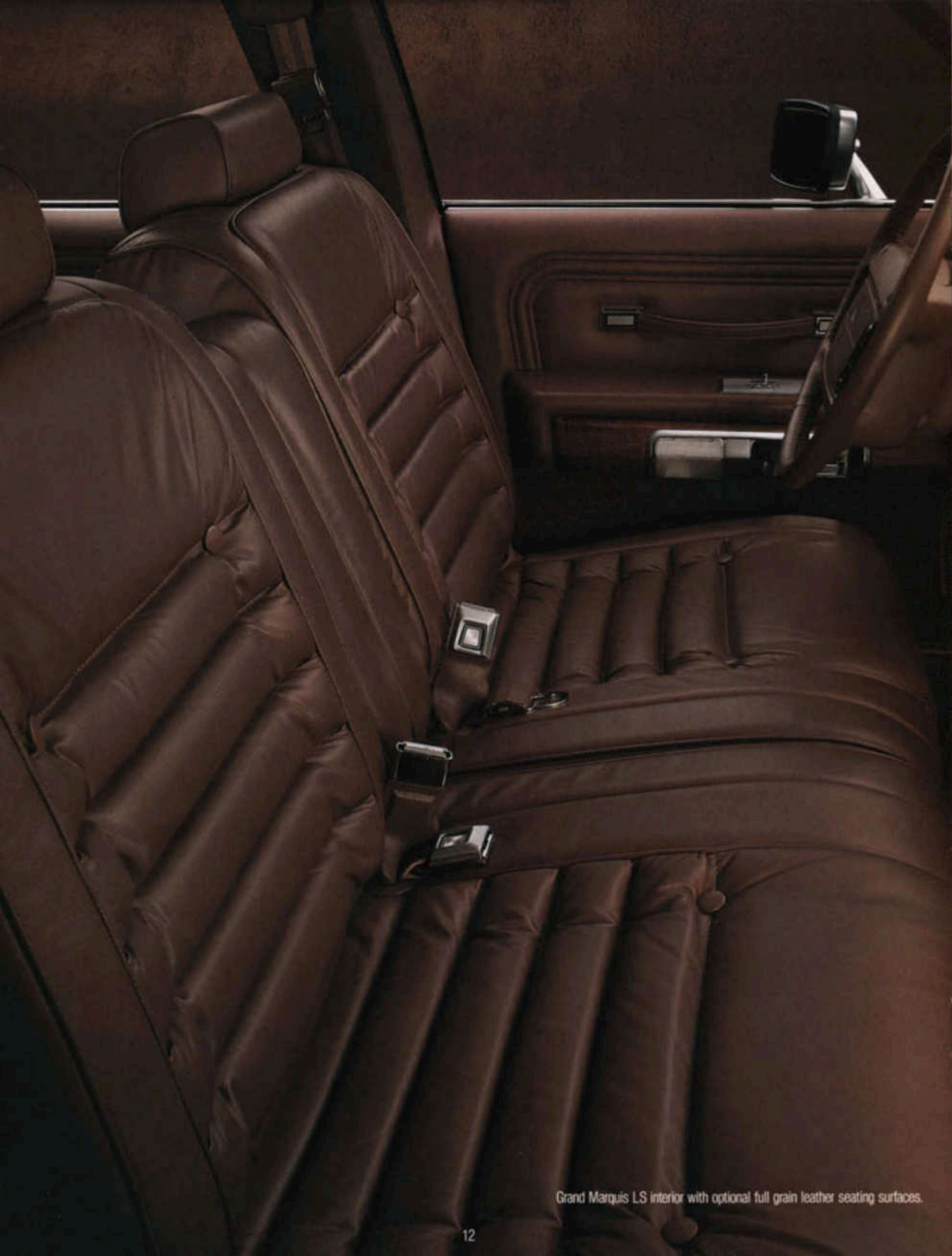
Grand Marquis LS interior with optional full grain leather seating surfaces.