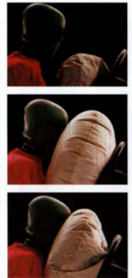
Shown here is a representation of a driver-side air bag Supplemental Restraint System deployment. The air bag inflates in less than one-tenth of a second in the event of a moderate to severe frontal impact, then deflates in a fraction of a second.