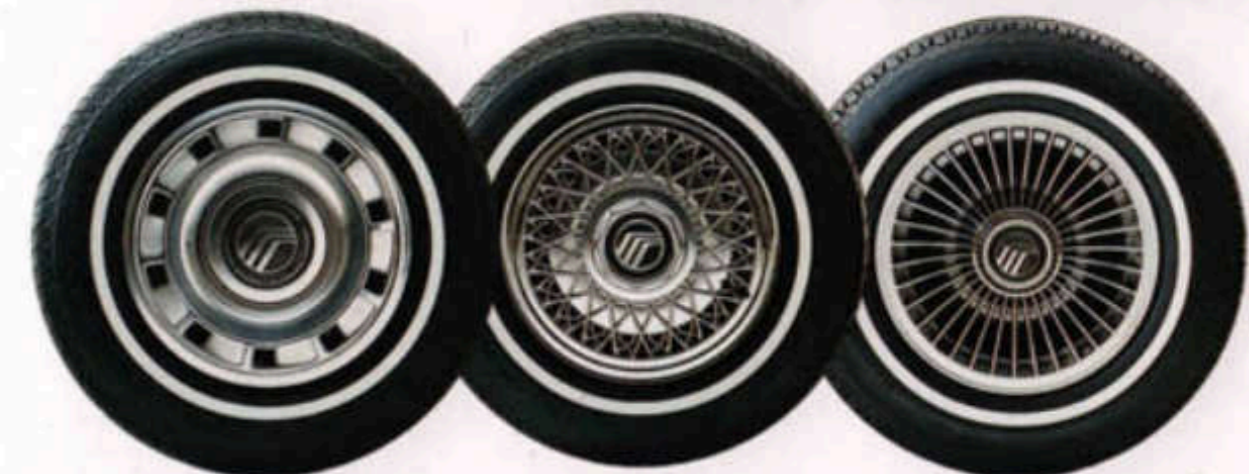
Left to right: full wheel cover, locking wire-style wheel cover, turbine spoke aluminum wheel.