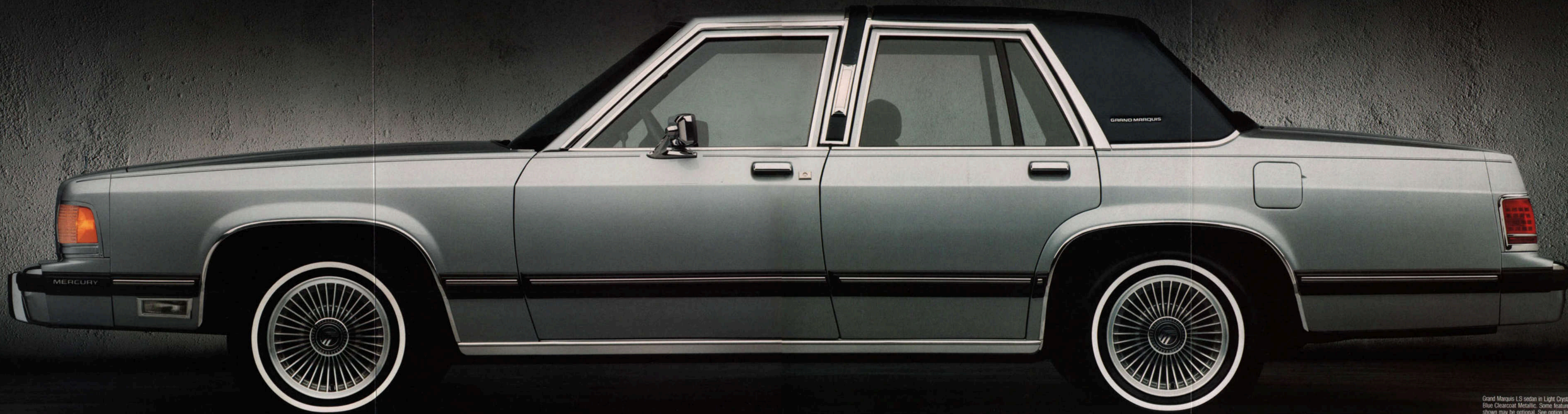
Grand Marquis LS sedan in Light Crystal Blue Clearcoat Metallic. Some features shown may be optional. See option list on pages 14 and 15.