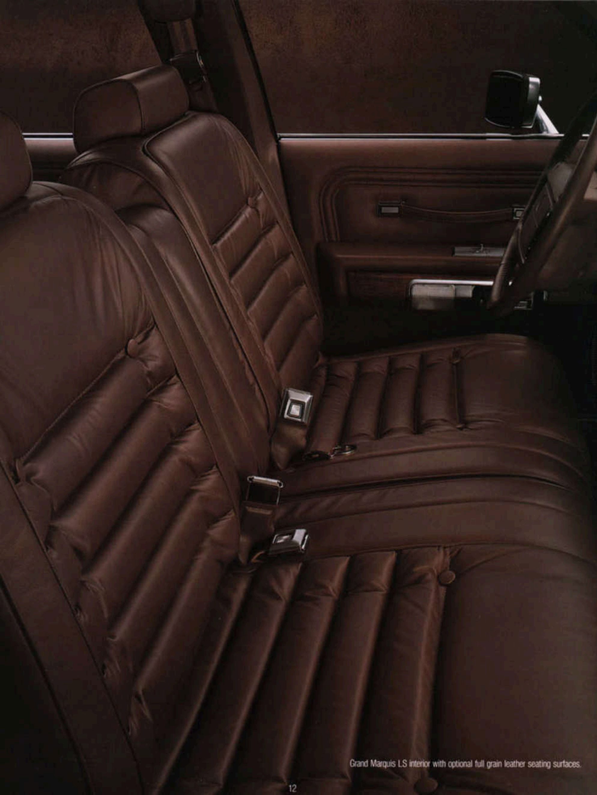
Grand Marquis LS interior with optional full grain leather seating surfaces.