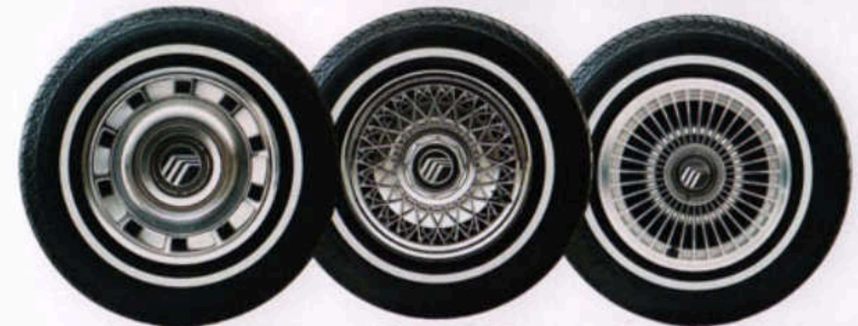
Left to right: full wheel cover, locking wire-style wheel cover, turbine spoke aluminum wheel.