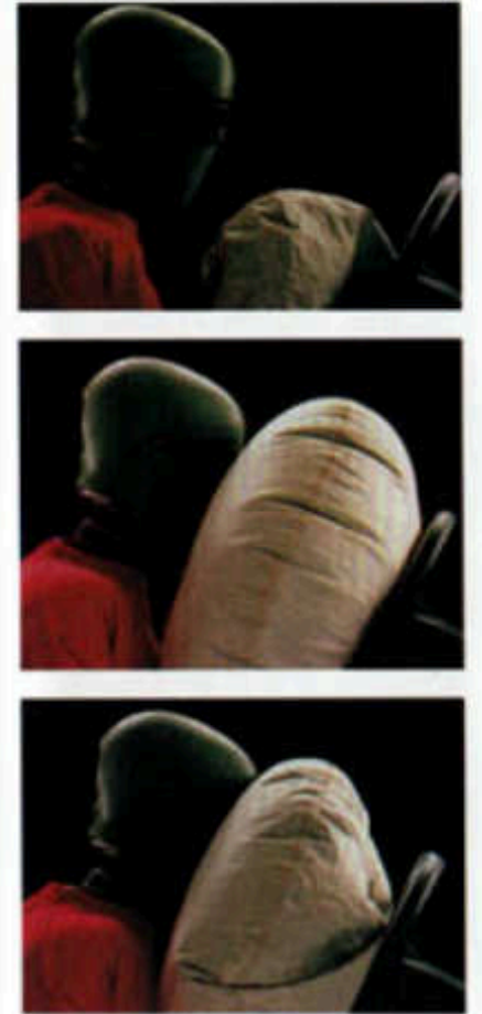
Shown here is a representation of a driver-side air bag Supplemental Restraint System deployment. The air bag inflates in less than one-tenth of a second in the event of a moderate to severe frontal impact, then deflates in a fraction of a second.