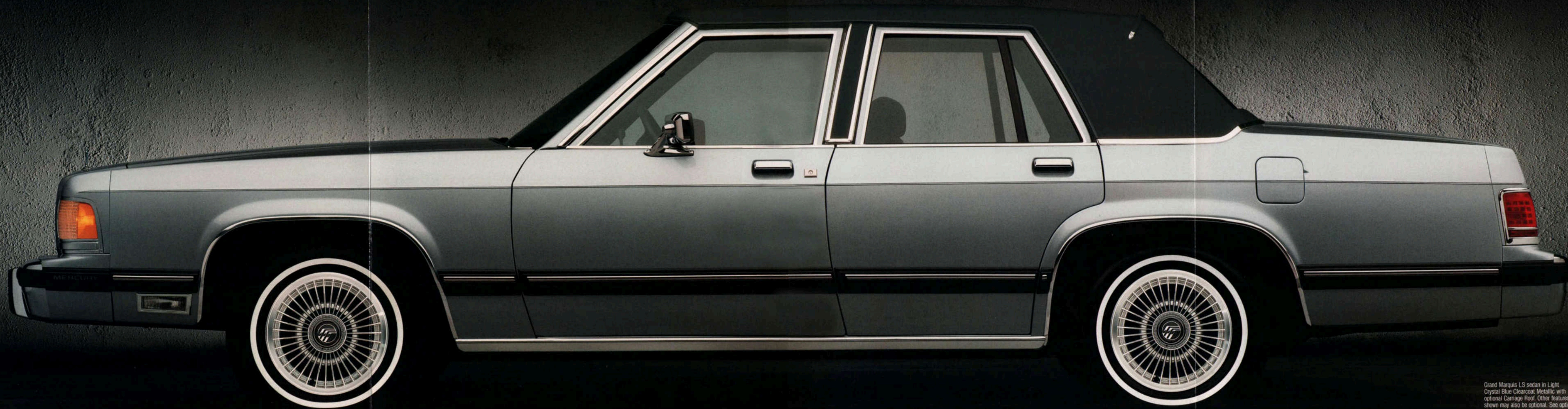
Grand Marquis LS sedan in Light Crystal Blue Clearcoat Metallic with optional Carriage Roof. Other features shown may also be optional. See option list on pages 14 and 15.