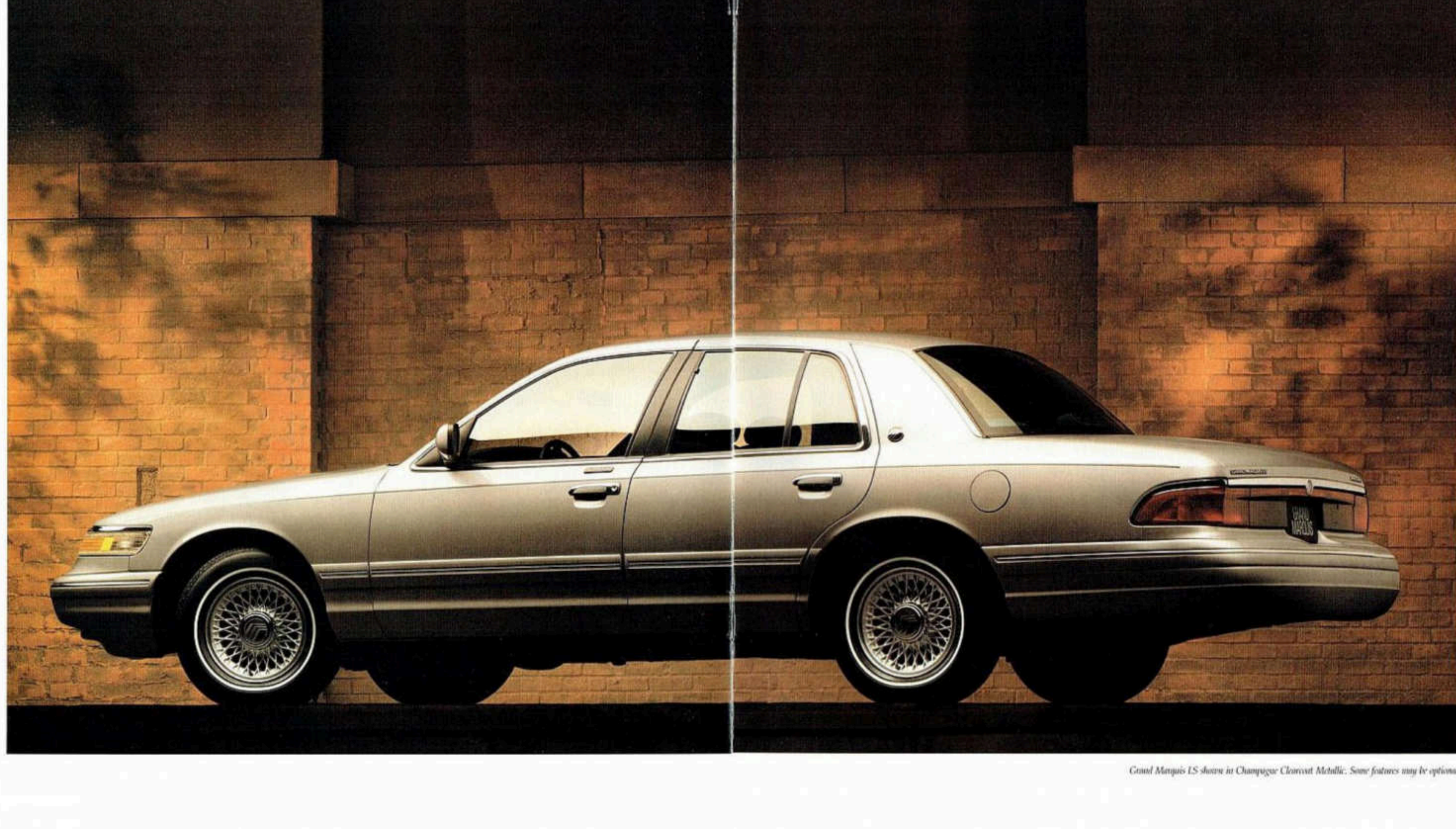
Grand Marquis LS shown in Champagne Clearcoat Metallic. Some features may be optional.

ONE GLANCE TELLS YOU IT'S CLEARLY A GRAND MARQUIS.