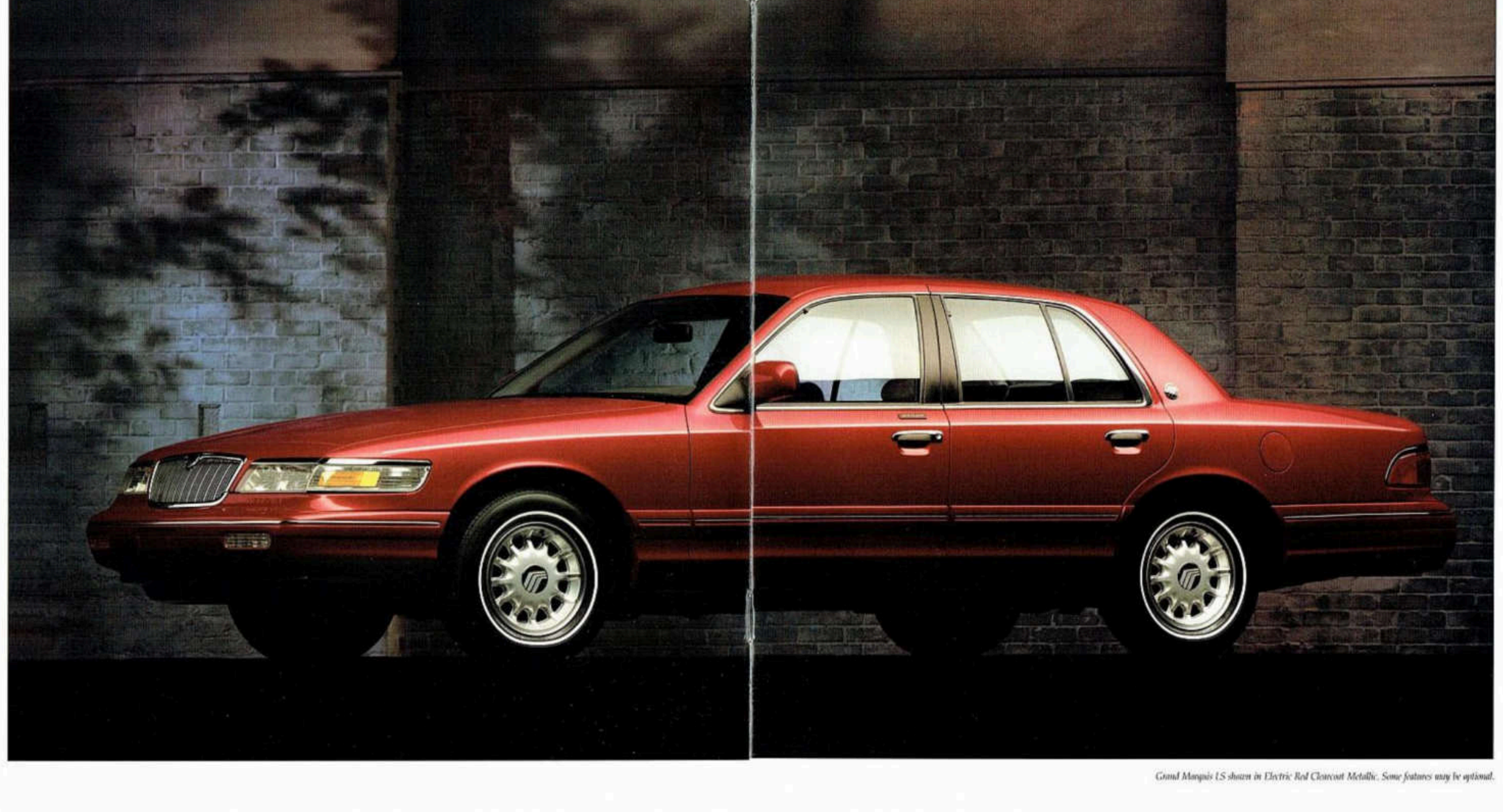
Grand Marquis LS shown in Electric Red Clearcoat Metallic. Some features may be optional.

Grand Marquis has set the standard for full-sized sedans. Now, the 1995 model has been restyled to be more contemporary. It's still spacious enough to seat six passengers comfortably. A powerful overhead cam V-8 and body-on-frame construction contribute to its legendary ride. And, numerous features such as dual air bags, anti-lock brakes and speed-sensitive power steering help make this a most impressive Grand Marquis.