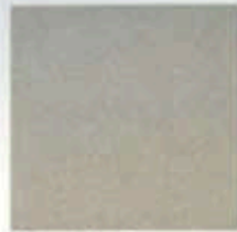
Silver Birch Metallic