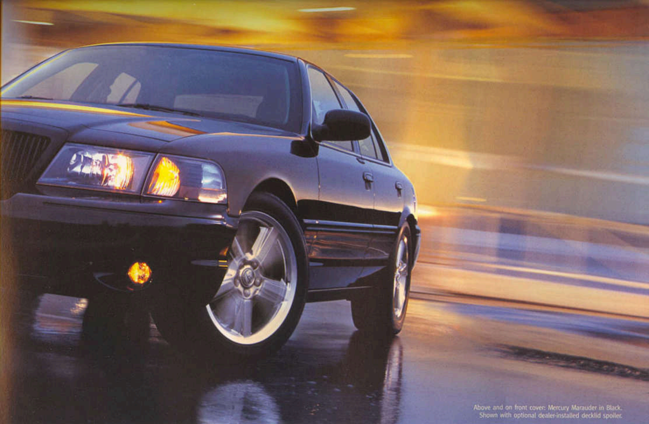
Above and on front cover: Mercury Marauder in Black. Shown with optional dealer-installed decklid spoiler.