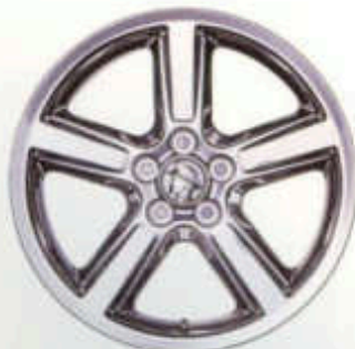
18" 5-Spoke Polished Forged Alloy Wheel Standard