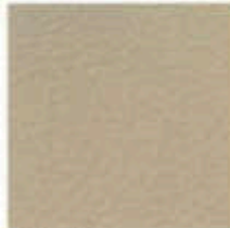
Light Flint leather trim

Mercury uses clearcoat paint for beauty and protection. Colors are representative only. Please see your Lincoln Mercury Dealer for actual paint/trim options.