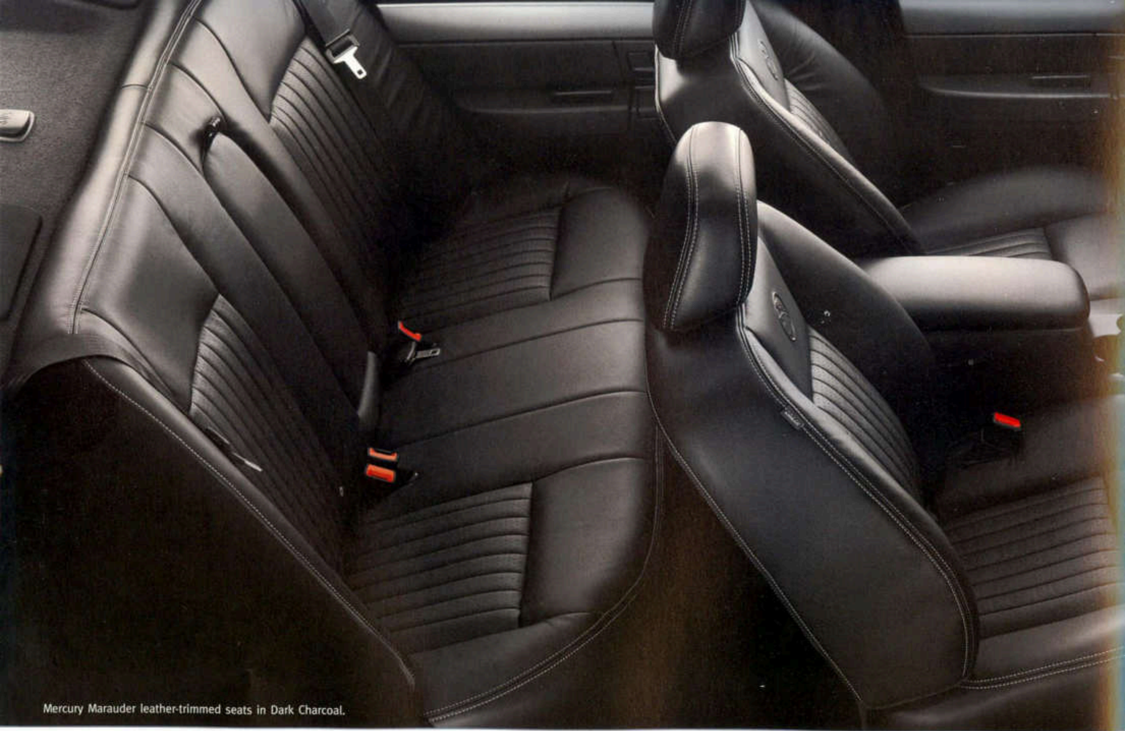
Mercury Marauder leather-trimmed seats in Dark Charcoal.