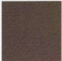
Dark Charcoal leather trim