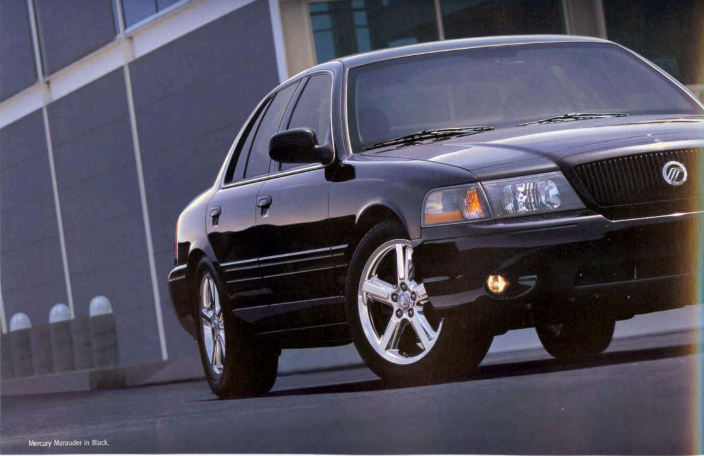
Mercury Marauder in Black.