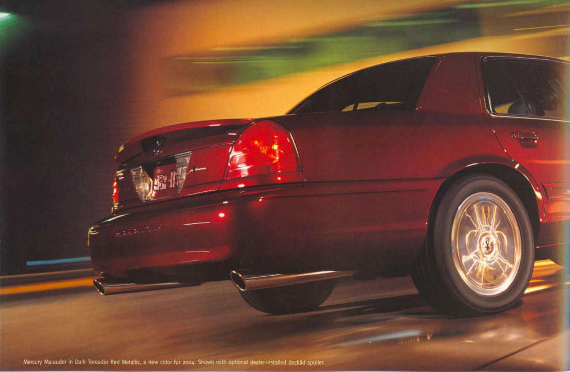
Mercury Marauder in Dark Toreador Red Metallic, a new color for 2004. Shown with optional dealer-installed decklid spoiler.