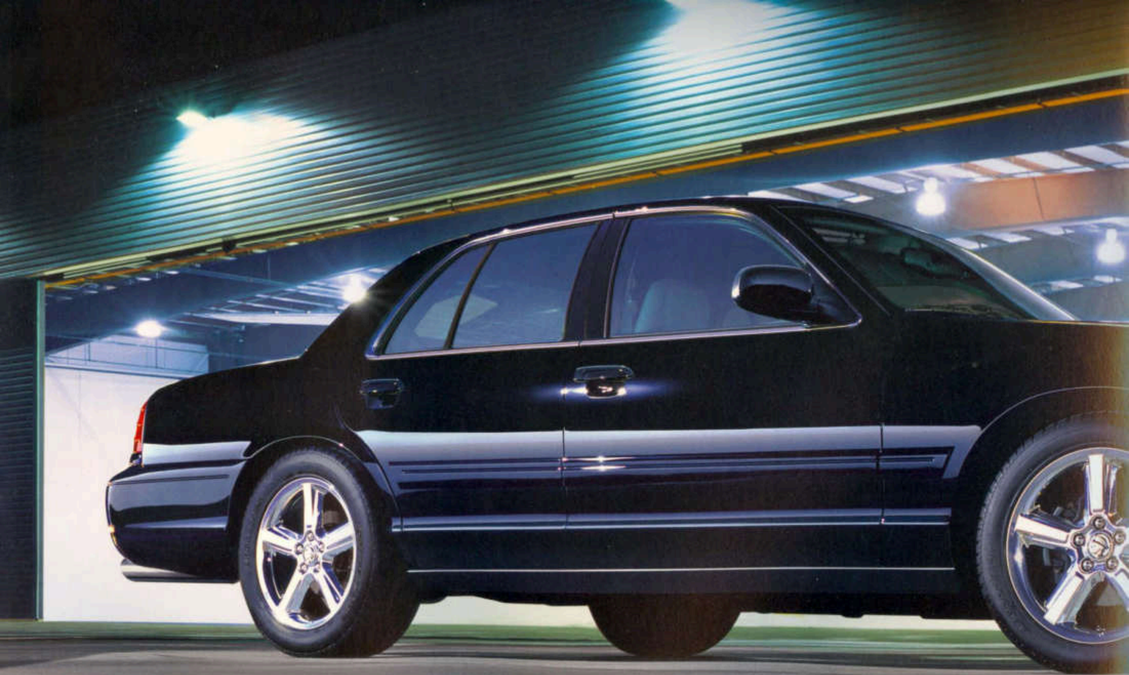
Mercury Marauder in Black.