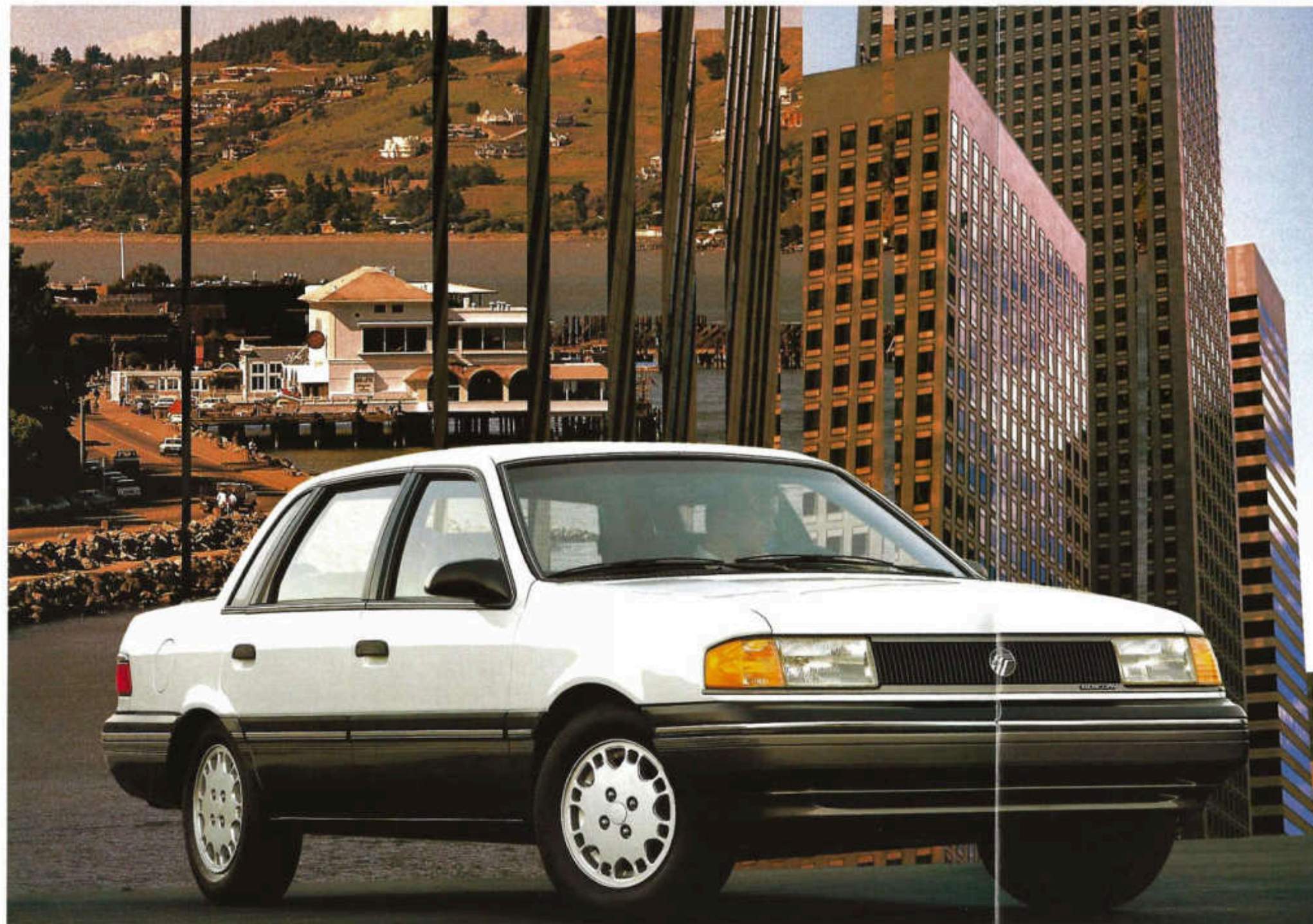
Topaz LTS shown below left in Oxford White and Medium Titanium Clearcoat Metallic. Topaz LS shown below in Medium Titanium Clearcoat Metallic. Topaz GS shown at bottom in Crystal Blue Clearcoat Metallic. Some features shown may be optional. See your dealer for details.

able on LTS, LS and four-door GS models, which also offer an optional driver-side air bag Supplemental Restraint System. (Not available with four-wheel drive.)