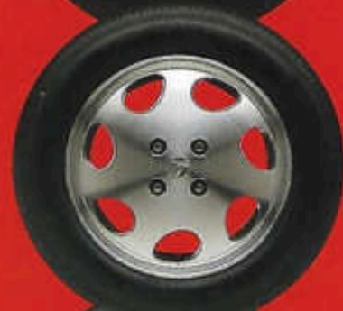
17" 7-hole machined disc wheel