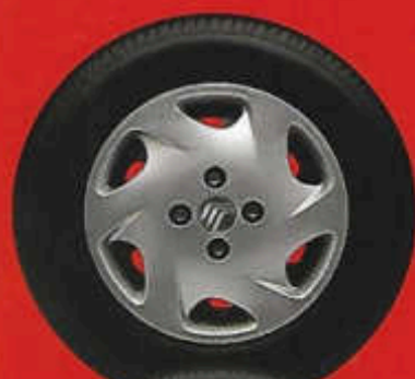
16" machined bobbed wheel cover