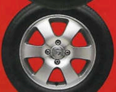
17" Escape package machined disc wheel