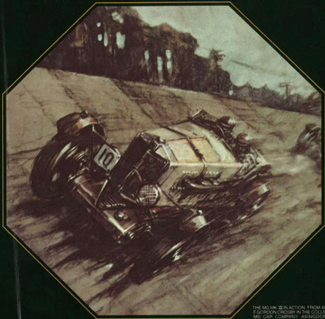
THE MG MK. III IN ACTION. FROM AN ORIGINAL BY F. GORDON CROSBY IN THE COLLECTION OF THE MG. CAR COMPANY, ABINGDON-ON-THAMES.