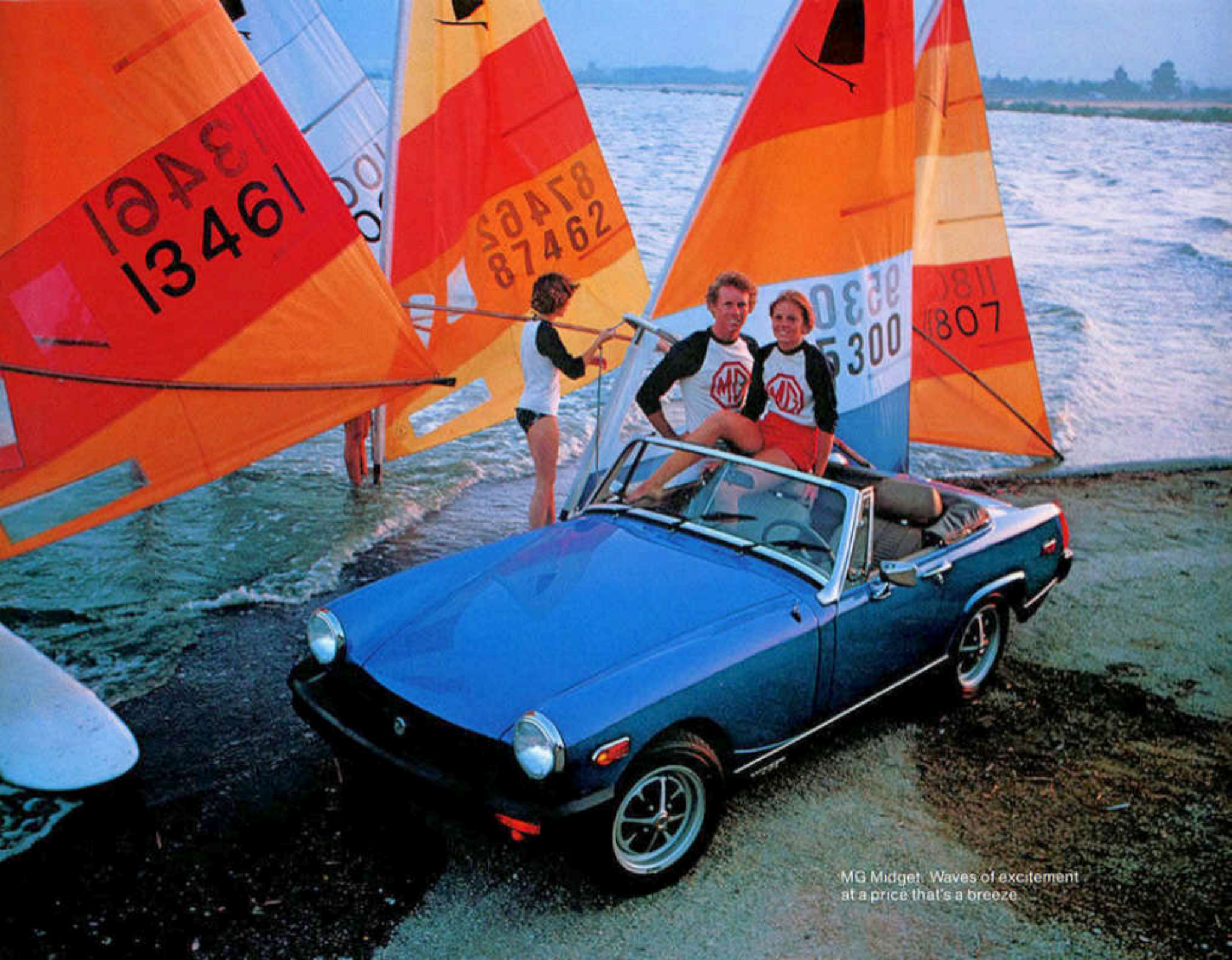
MG Midget. Waves of excitement at a price that's a breeze