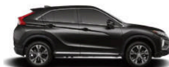
SEL 1.5 2WD or S-AWC