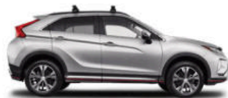
SEL 1.5 TOURING 2WD or S-AWC