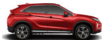
SE 1.5 PANORAMIC SUNROOF 2WD or S-AWC