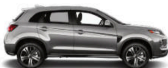
ES 2.0 2WD or AWC