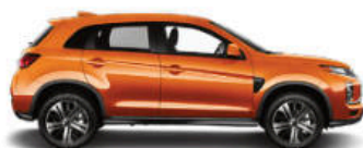
ES 2.0 Convenience Package 2WD or AWC