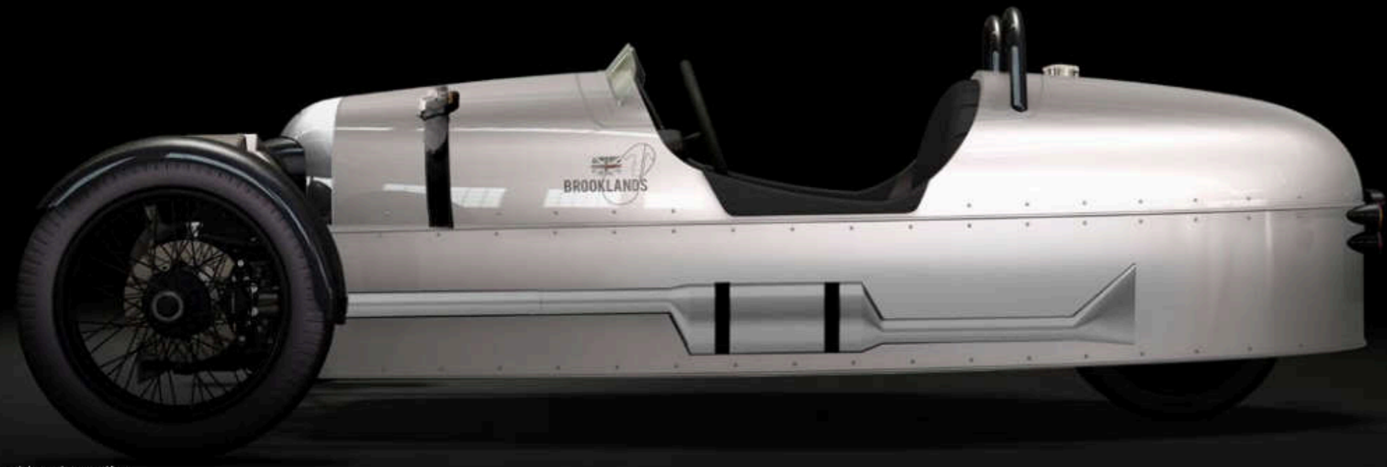
Polished body option