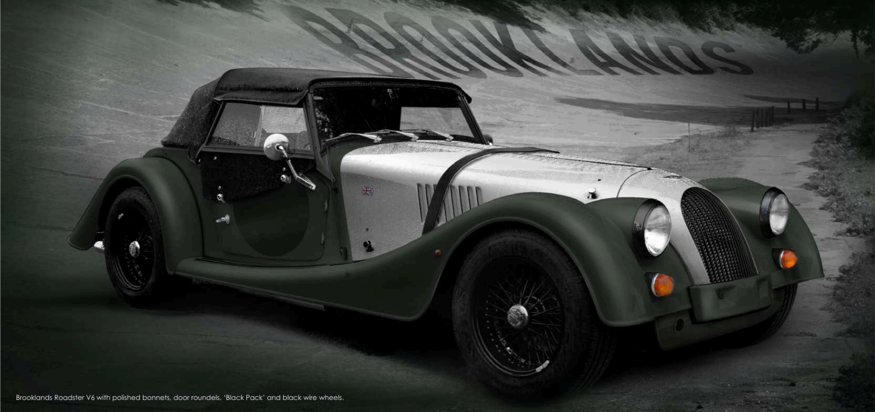
Brooklands Roadster V6 with polished bonnets, door roundels, 'Black Pack' and black wire wheels.