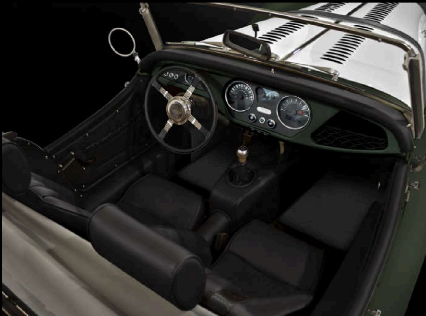
Standard car includes Brooklands steering wheel and NEW perforated Sports seats