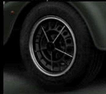
Alloys with Silver accents