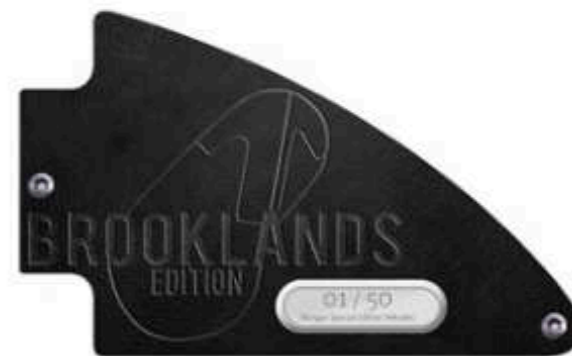
Dash detail with numbered plaque