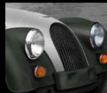
Std. polished headlights