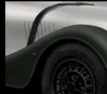
Standard Satin Bonnets