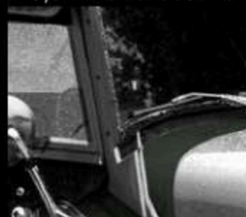
'Black pack' Trims