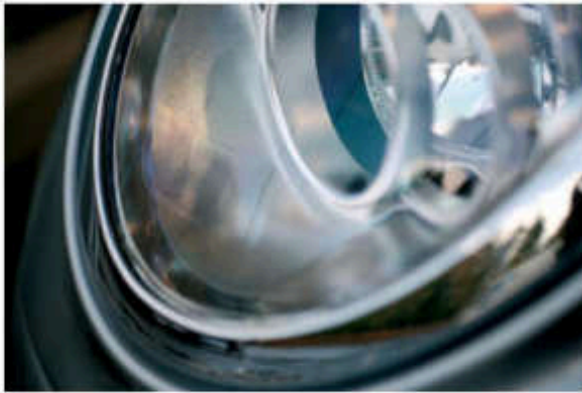
AERO 8 MANUAL