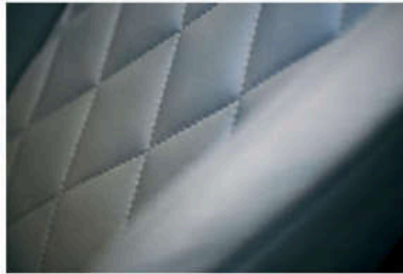
AERO 8 AUTOMATIC

Fuel Consumption Urban 17.1 mpg (16.5 l/100km) Extra urban 34.4 mpg (8.2 l/100km) Combined 25.2 mpg (11.2 l/100km) CO2 269 g/km