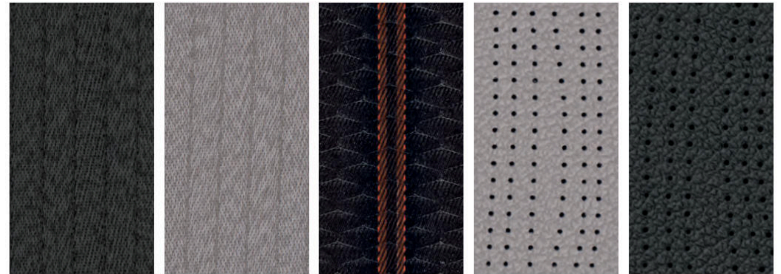
Charcoal Cloth S|SV