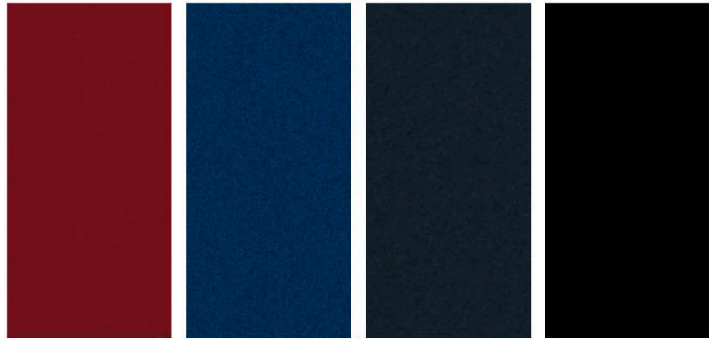
Scarlet Ember Tintcoat 18 Deep Blue Pearl Storm Blue Metallic Super Black

Nissan has taken care to ensure that the color swatches presented here are the closest possible representations of actual vehicle colors. Swatches may vary slightly due to the printing process and whether viewed in daylight, fluorescent or incandescent light. Please see the actual colors at your dealer.