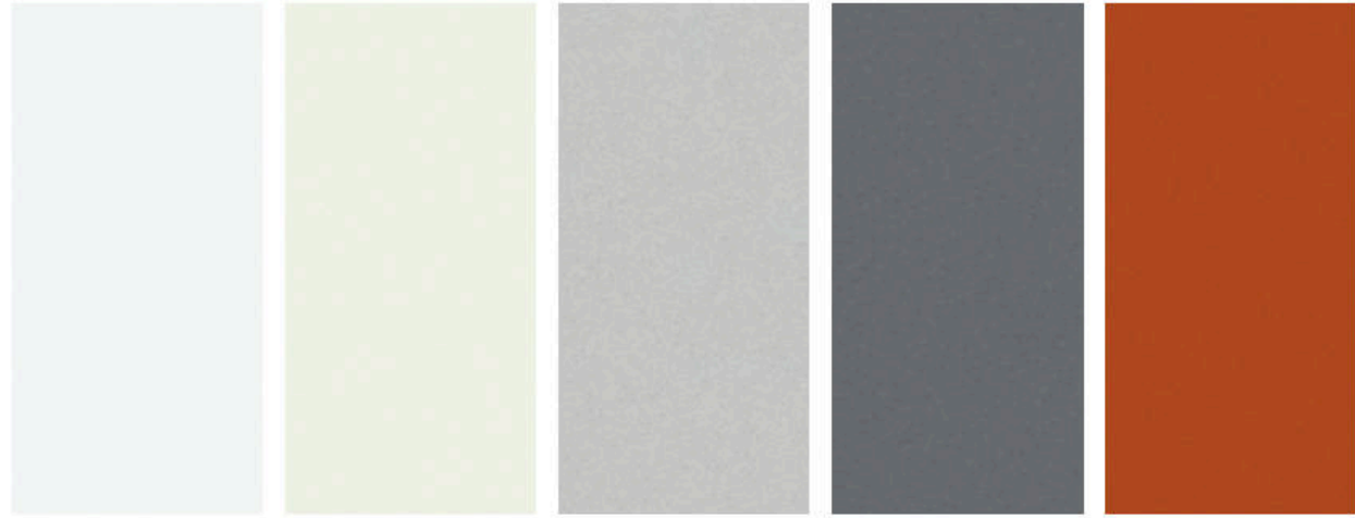
Glacier White Pearl White TriCoat 18 Brilliant Silver Metallic Gun Metallic Sunset Drift ChromaFlair 18

S SV SR SL PLT S SV SR SL PLT S SV SR SL PLT S SV SR SL PLT S SV SR SL PLT