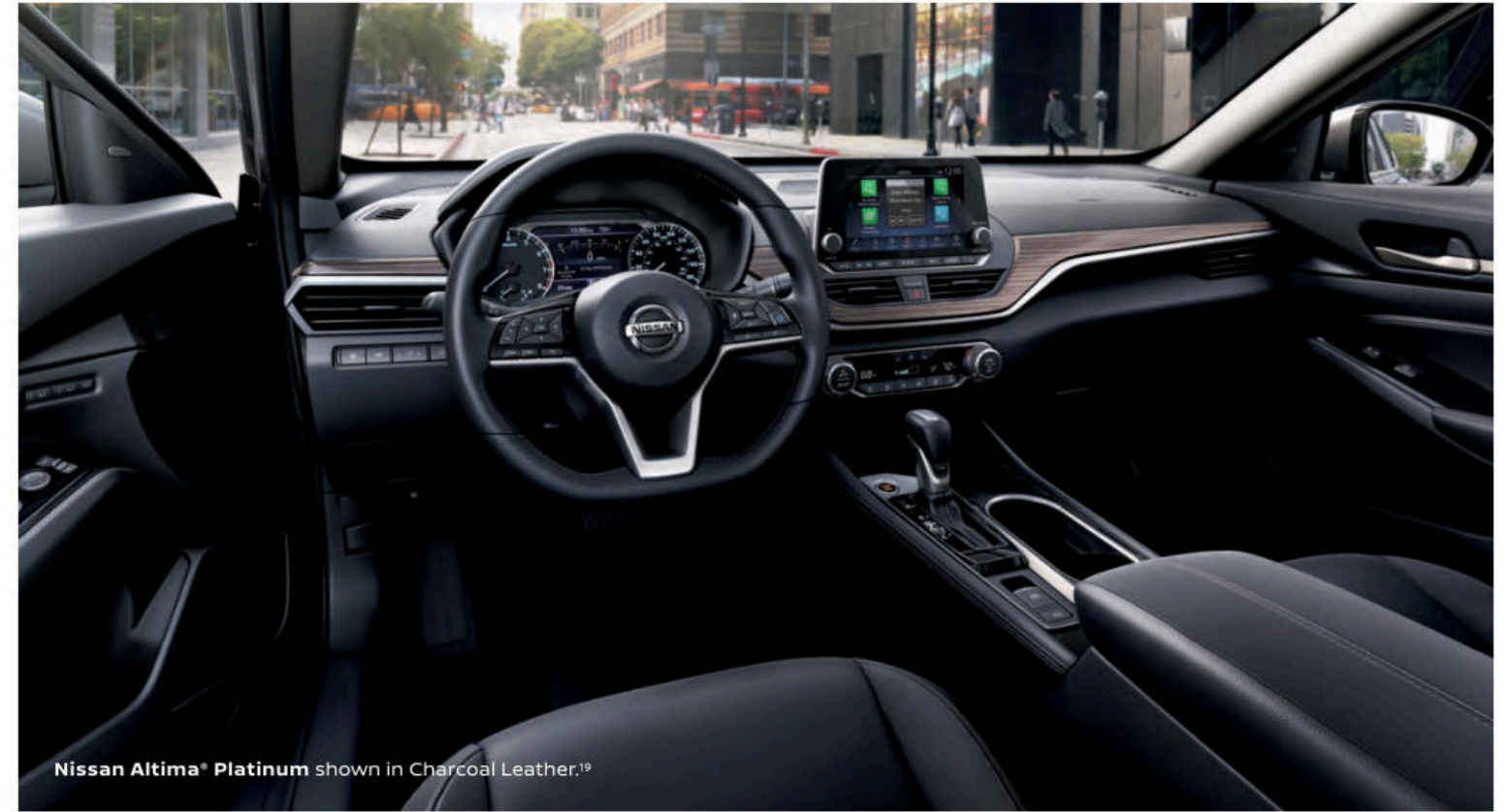
Nissan Altima ® Platinum shown in Charcoal Leather. 19