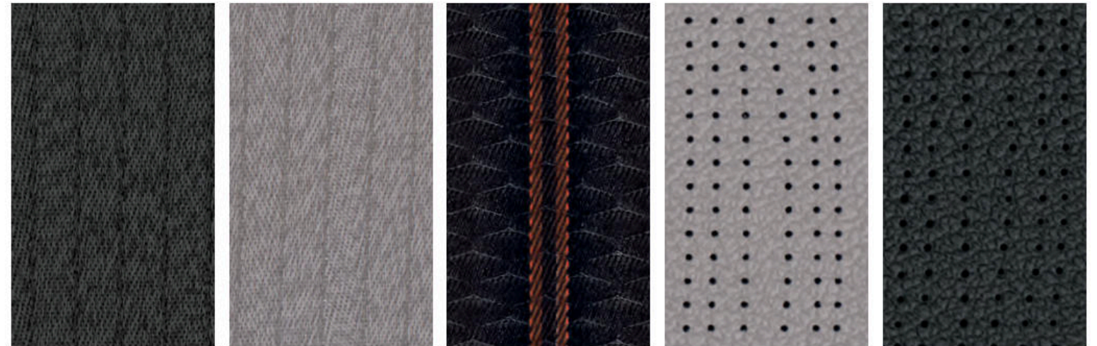
Charcoal Cloth S|SV