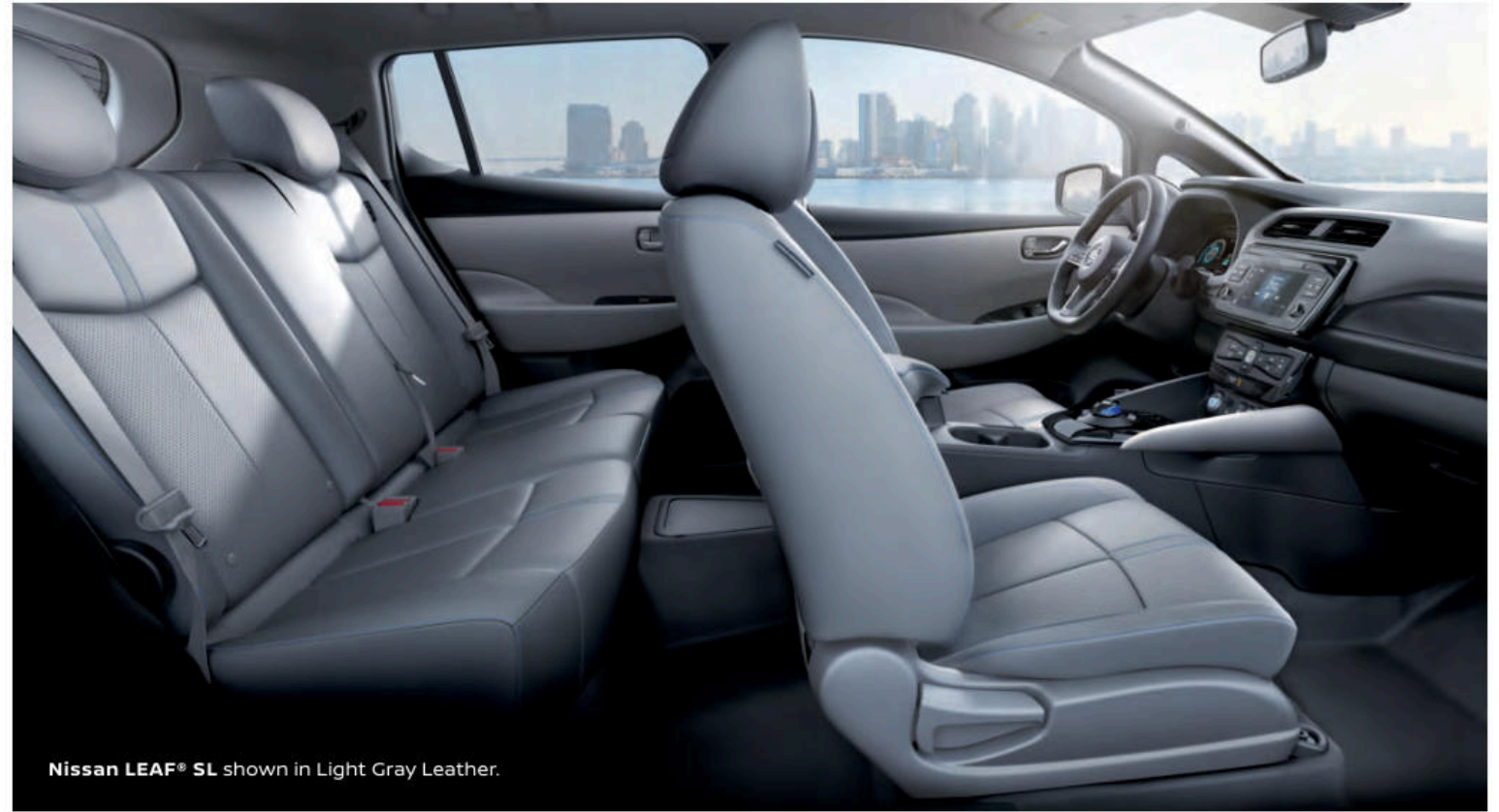
Nissan LEAF® SL shown in Light Gray Leather.