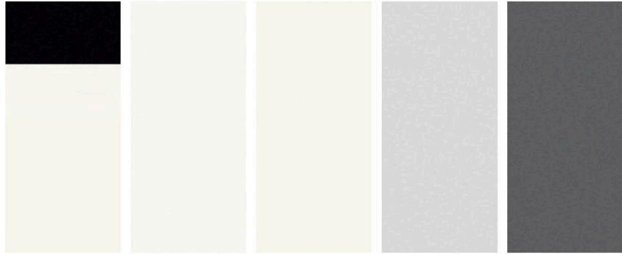
Two-tone Pearl White/Super Black 13 xBJ Glacier White QAK Pearl White 13 QAB Brilliant Silver K23 Gun Metallic KAD