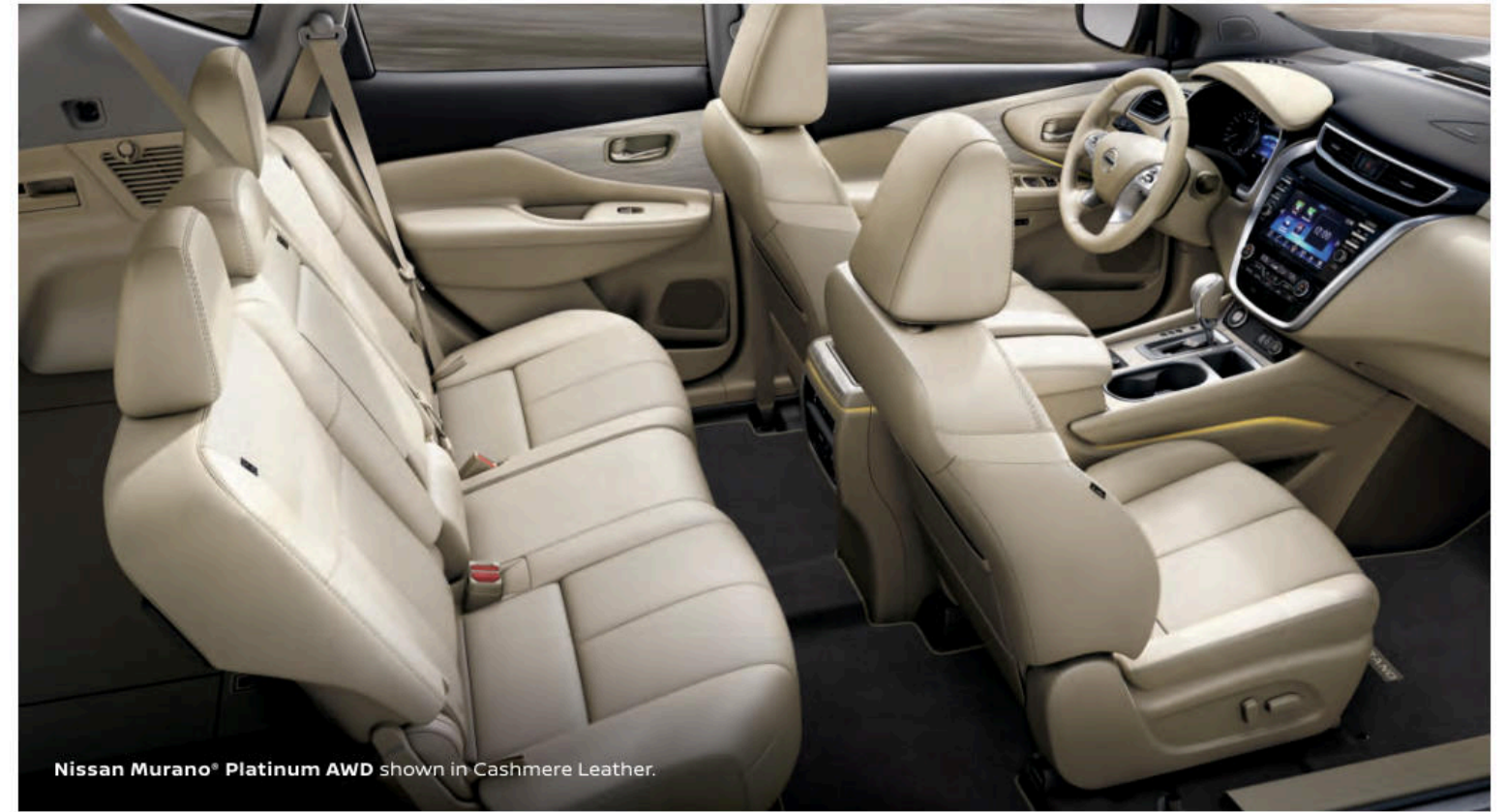
Nissan Murano ® Platinum AWD shown in Cashmere Leather.