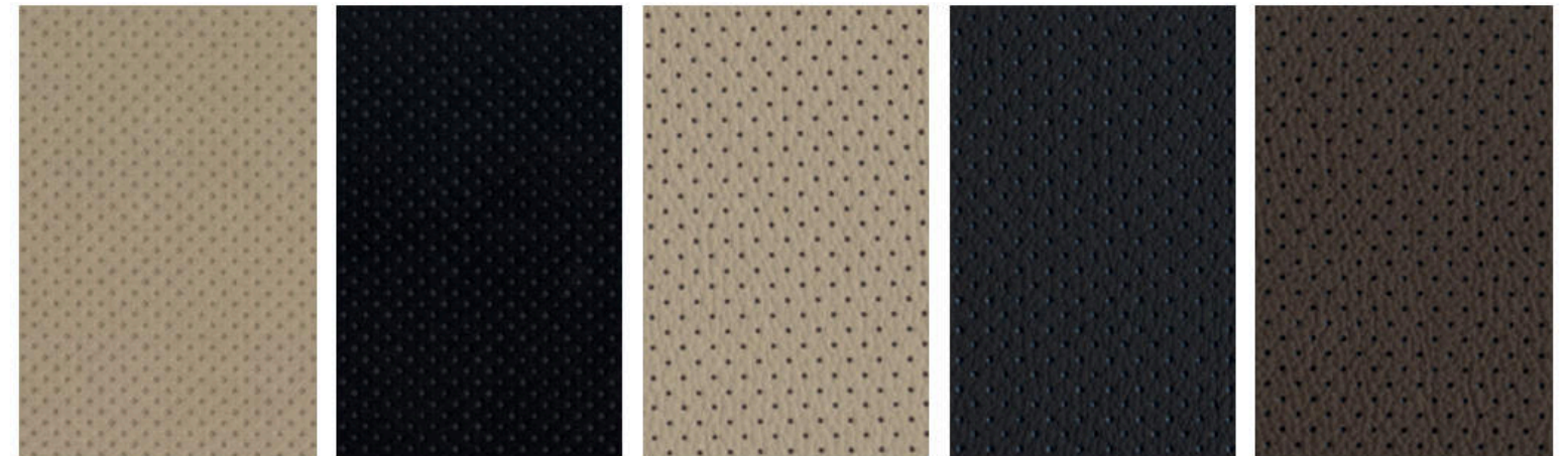
Cashmere Cloth SV Graphite Cloth S | SV Cashmere Leather SL | PLATINUM Graphite Leather SL | PLATINUM Mocha Leather SL | PLATINUM