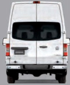
323 CU. FT. CARGO CAPACITY 6