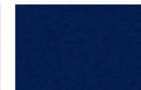
Arctic Blue Metallic R8G SV|SL