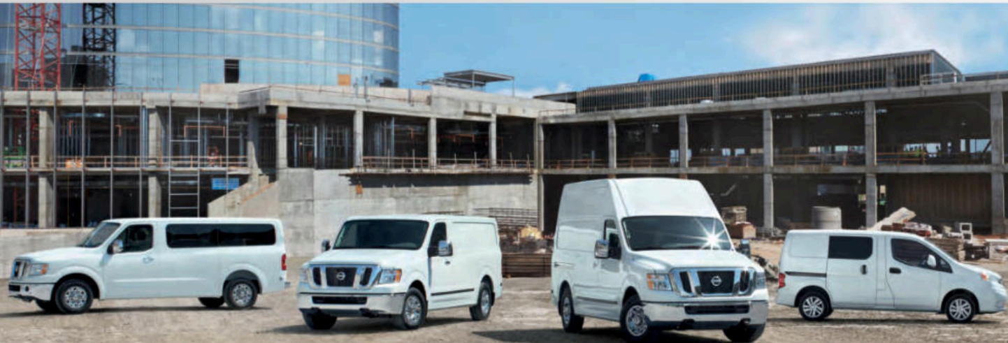
NV3500 ® HD Cargo High Roof with Endurance ® V8 shown. 4,6

Going above and beyond is the Nissan way. After passing all of the brutal quality and durability testing, we're sure you'll have a van you can count on. To prove our confidence and our commitment, we are pleased to introduce America's Best Commercial Van Warranty, a bumper-to-bumper limited warranty for 5 years or 100,000 miles, whichever comes first. 13 And that means we've got your back, so you can keep moving forward. For more details of the limited warranty, please go to NissanCommercialVehicles.com or ask your Nissan Business Certified Dealer. 13