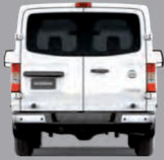
234 CU. FT. CARGO CAPACITY 6