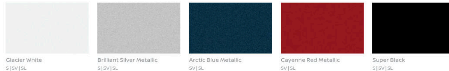
Glacier White S|SV|SL