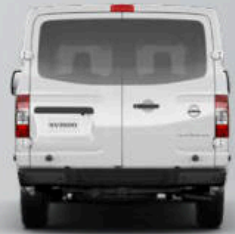
234 CU. FT. CARGO CAPACITY 4