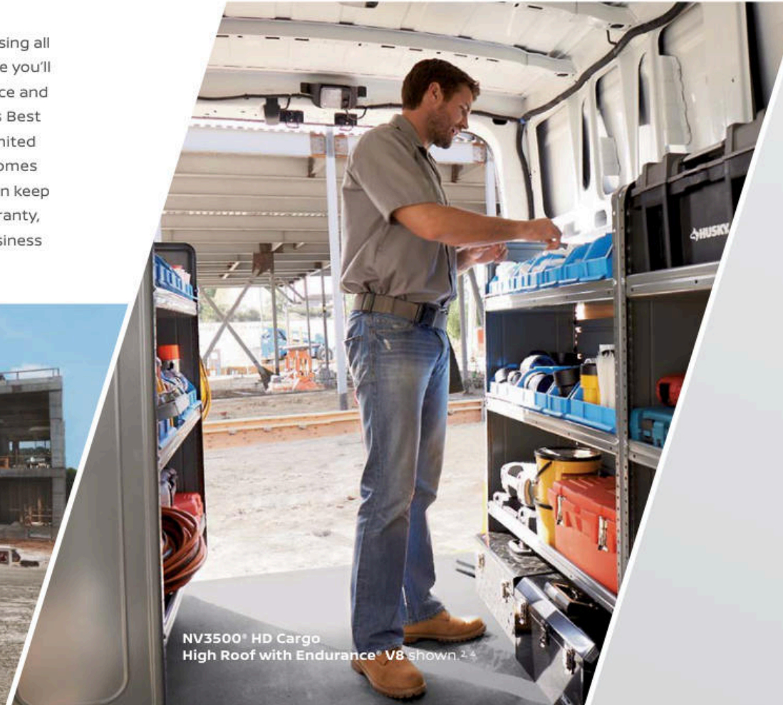
NV3500 ® HD Cargo High Roof with Endurance ® V8 shown. 2-4