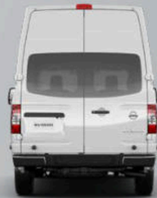
323 CU. FT. CARGO CAPACITY 4