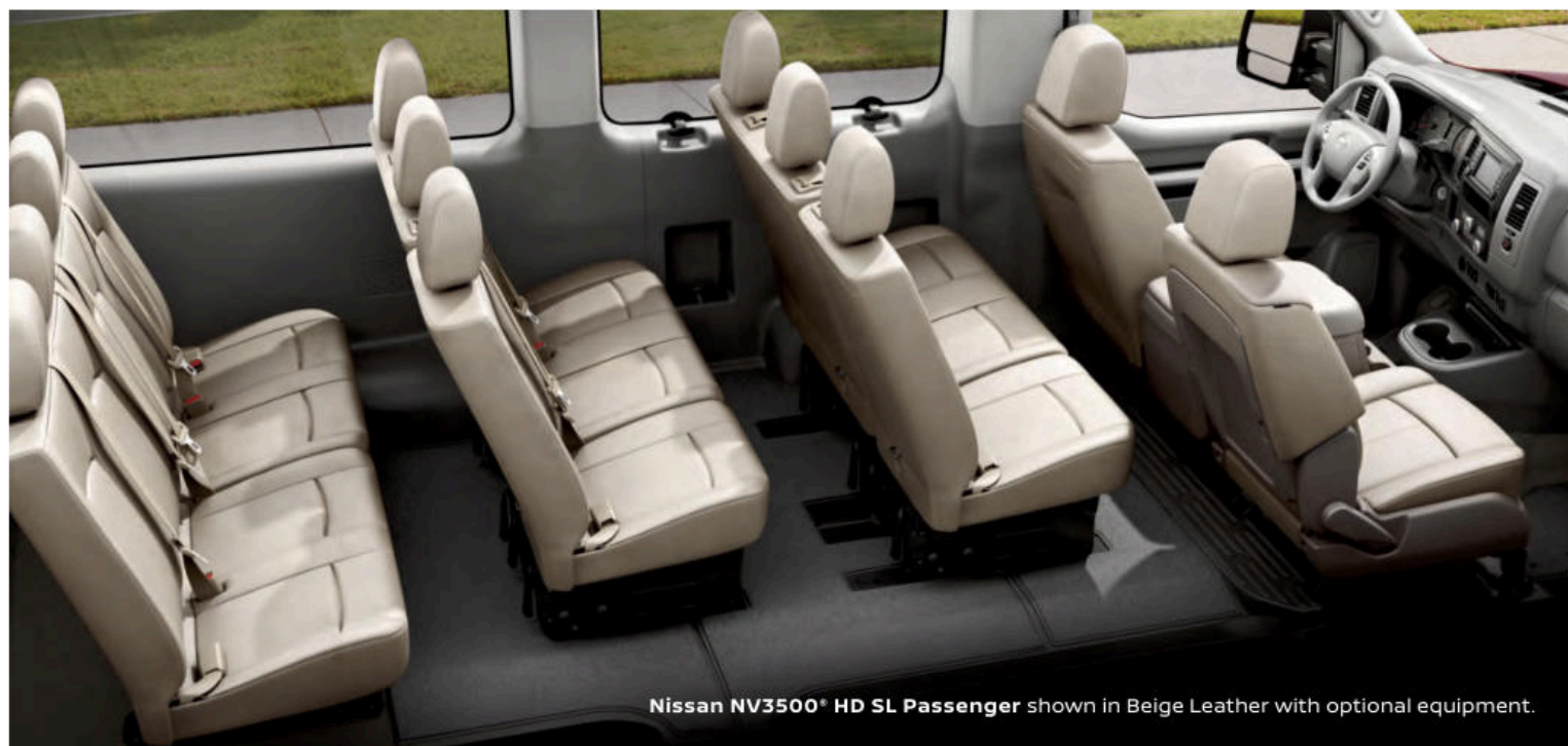
Nissan NV3500 ® HD SL Passenger shown in Beige Leather with optional equipment.

Nissan has taken care to ensure that the color swatches presented here are the closest possible representations of actual vehicle colors. Swatches may vary slightly due to the printing process and whether viewed in daylight, fluorescent or incandescent light. Please see the actual colors at your local Nissan dealer.