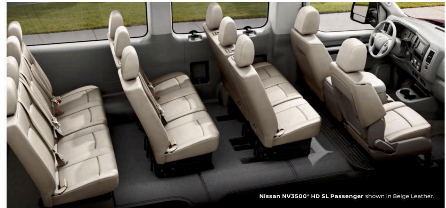
Nissan NV3500 ® HD SL Passenger shown in Beige Leather.