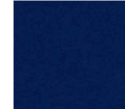
Arctic Blue Metallic 18 SV/SL

Nissan has taken care to ensure that the color swatches presented here are the closest possible representations of actual vehicle colors. Swatches may vary slightly due to the printing process and whether viewed in daylight, fluorescent or incandescent light. Please see the actual colors at your dealer.