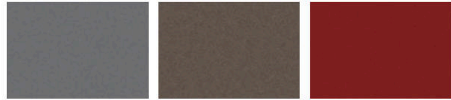
Gun Metallic KAD