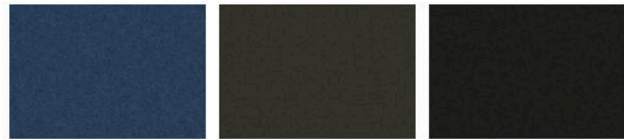
Arctic Blue Metallic RBG