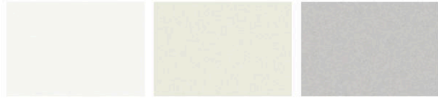
Glacier White QAK