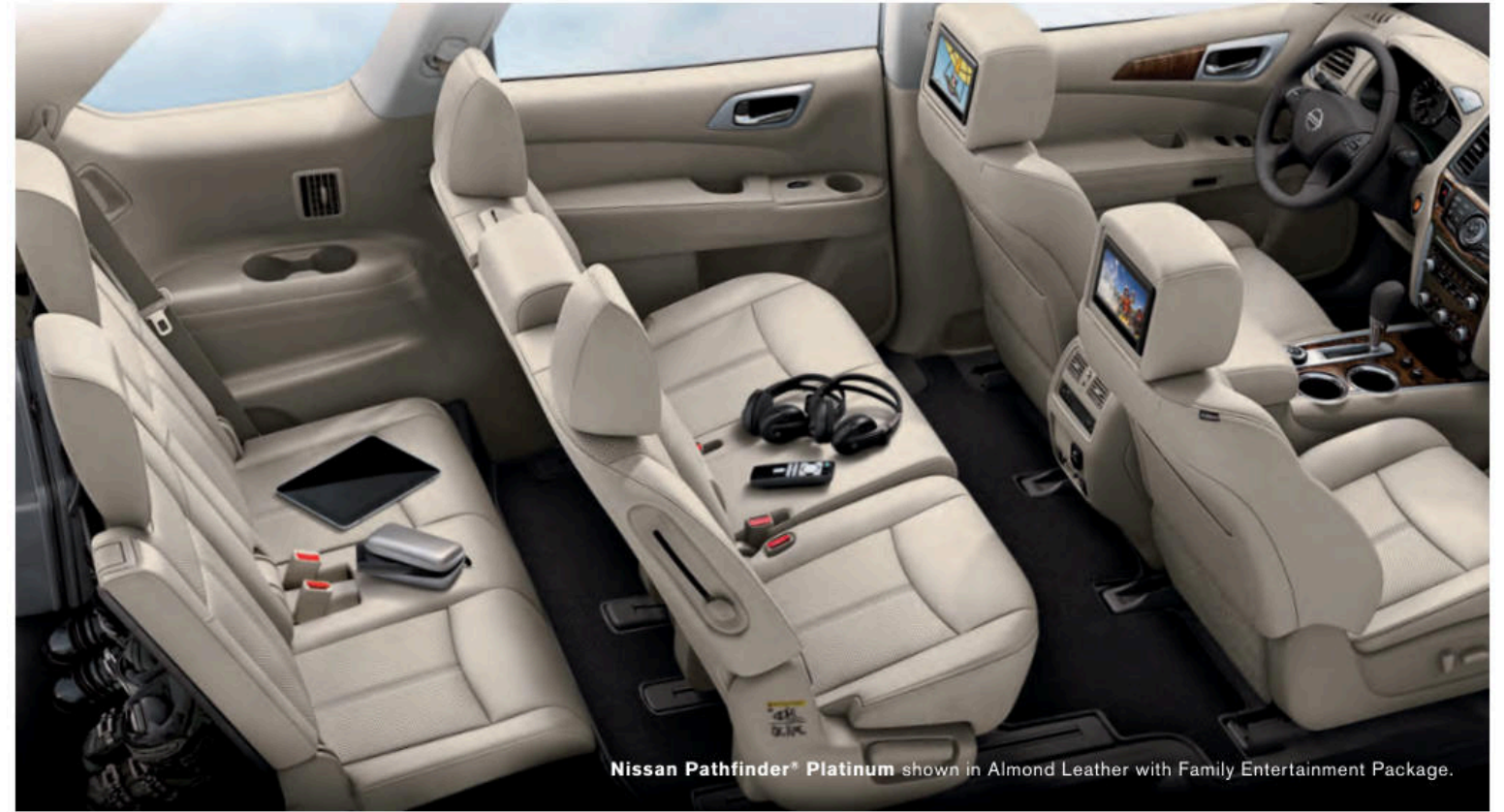
Nissan Pathfinder ® Platinum shown in Almond Leather with Family Entertainment Package.