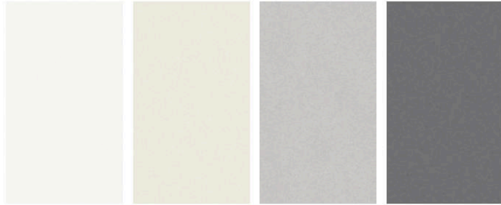
Glacier White QAK