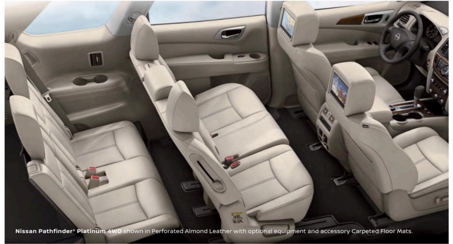
Nissan Pathfinder® Platinum 4WD shown in Perforated Almond Leather with optional equipment and accessory Carpeted Floor Mats.