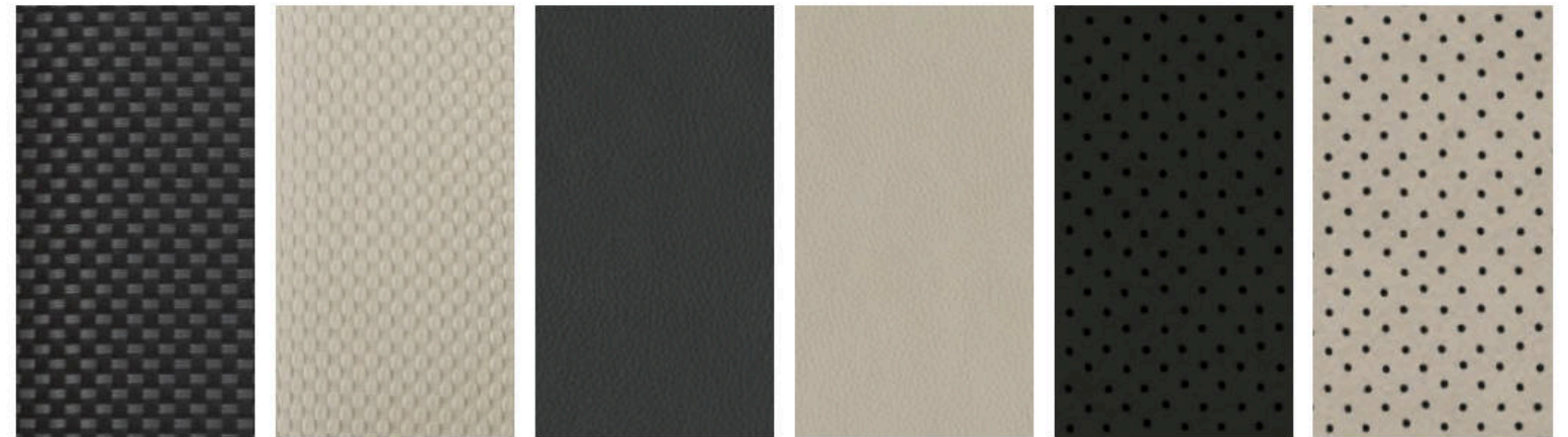
Charcoal Cloth S|SV