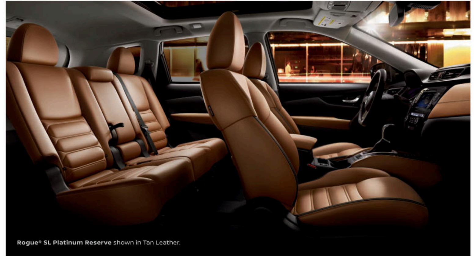
Rogue® SL Platinum Reserve shown in Tan Leather.