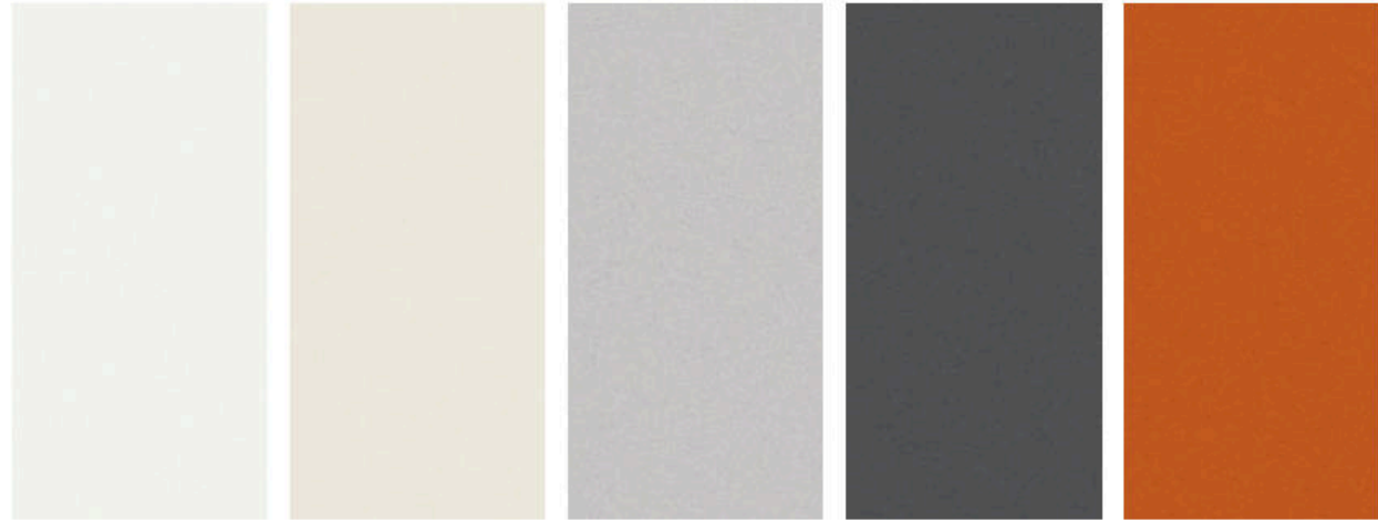
Glacier White QAK Pearl White¹ QAB Brilliant Silver K23 Gun Metallic KAD Monarch Orange¹ EBB