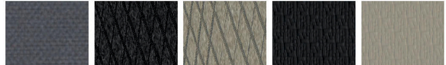
Charcoal Cloth S Charcoal Cloth SV Light Gray Cloth SV Charcoal Prima-Tex ® SV Light Gray Prima-Tex ® SV