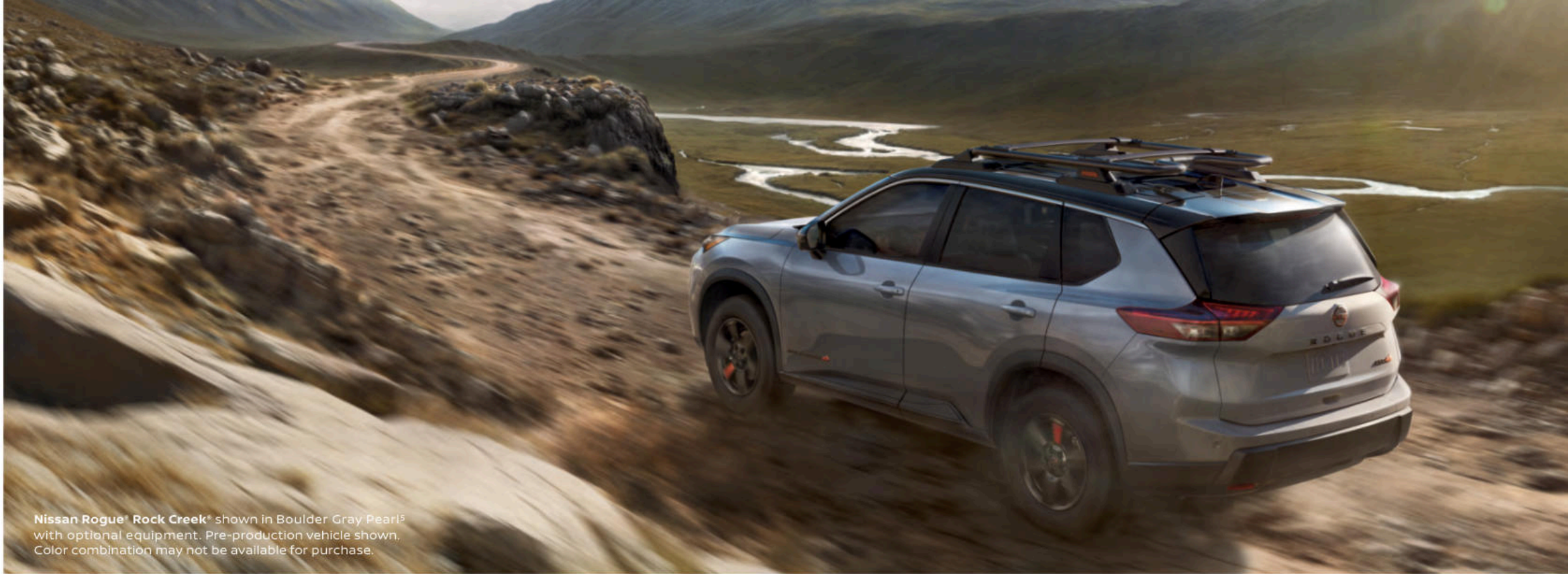
Nissan Rogue® Rock Creek® shown in Boulder Gray Pearl 5 with optional equipment. Pre-production vehicle shown. Color combination may not be available for purchase.

In the new Rogue Rock Creek, adventure is a philosophy to live by. Equipped with an impressive checklist of features, including an HD Intelligent Around View® Monitor with Off-Road Mode, 11 black tubular roof rack, 1 17" dark-painted aluminum-alloy wheels with all-terrain tires, and more, Rock Creek takes you from the indoors to the outdoors, in style and confidence.