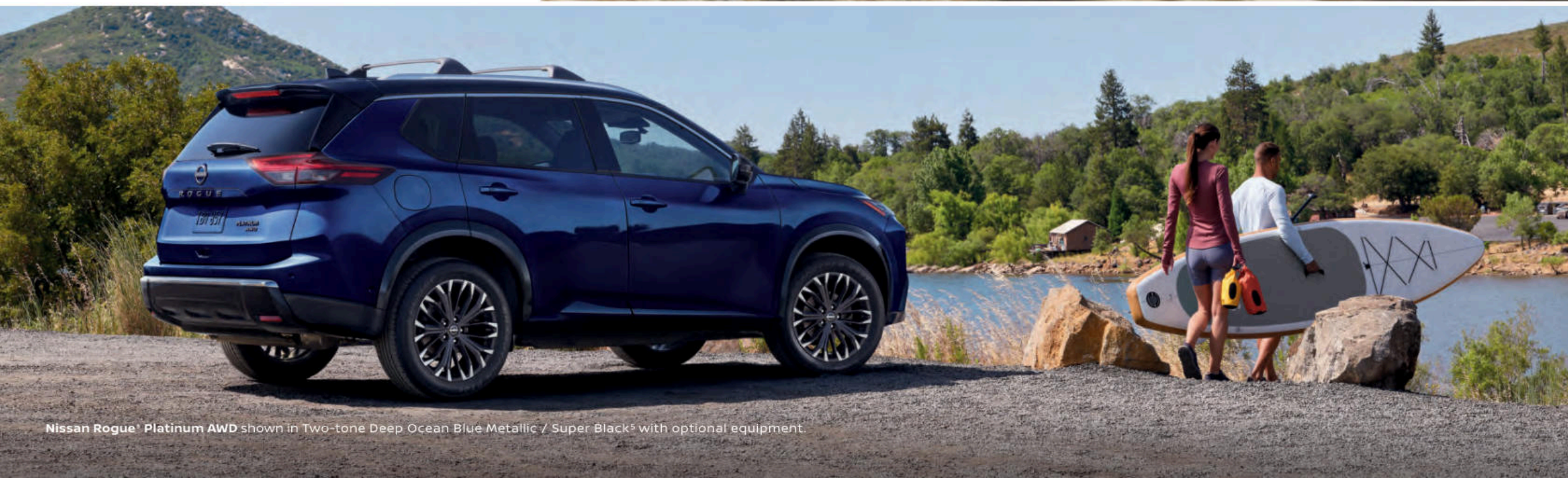
Nissan Rogue® Platinum AWD shown in Two-tone Deep Ocean Blue Metallic / Super Black 5 with optional equipment.