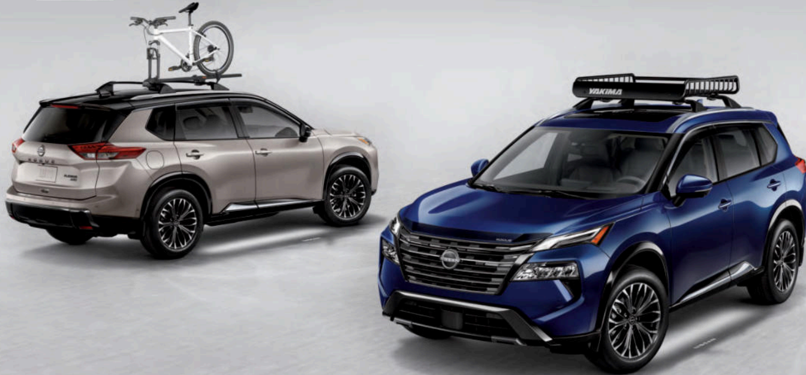
Rear/Left: Nissan Rogue® Platinum AWD shown in Two-tone Champagne Silver Metallic / Super Black 5 with Exterior Ground Lighting w/ Logo, Side-Window Deflectors, Satin Chrome Rear Bumper Protector, Splash Guards (4-piece set), Roof Rail Crossbars, 1, 36 and Affiliated: Yakima® ForkLift – Fork Mount Bike Rack. 1, 35

For more information and to shop online for Rogue Genuine Nissan Accessories, scan the code.