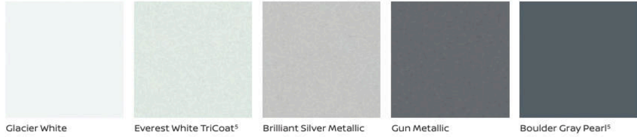
Glacier White Everest White TriCoat 5 Brilliant Silver Metallic Gun Metallic Boulder Gray Pearl 5