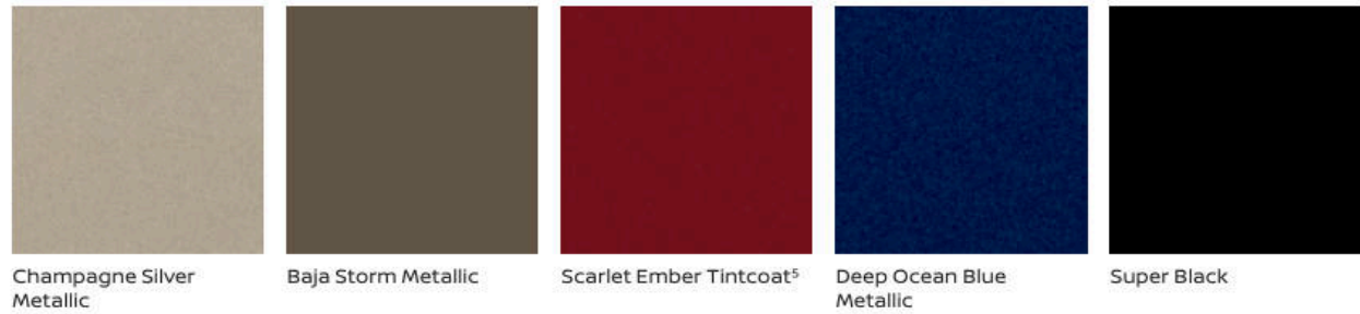
Champagne Silver Metallic Baja Storm Metallic Scarlet Ember Tintcoat 5 Deep Ocean Blue Metallic Super Black

Nissan has taken care to ensure that the color swatches presented here are the closest possible representations of actual vehicle colors. Swatches may vary slightly due to the printing process and whether viewed in daylight, fluorescent or incandescent light. Please see the actual colors at your dealer.