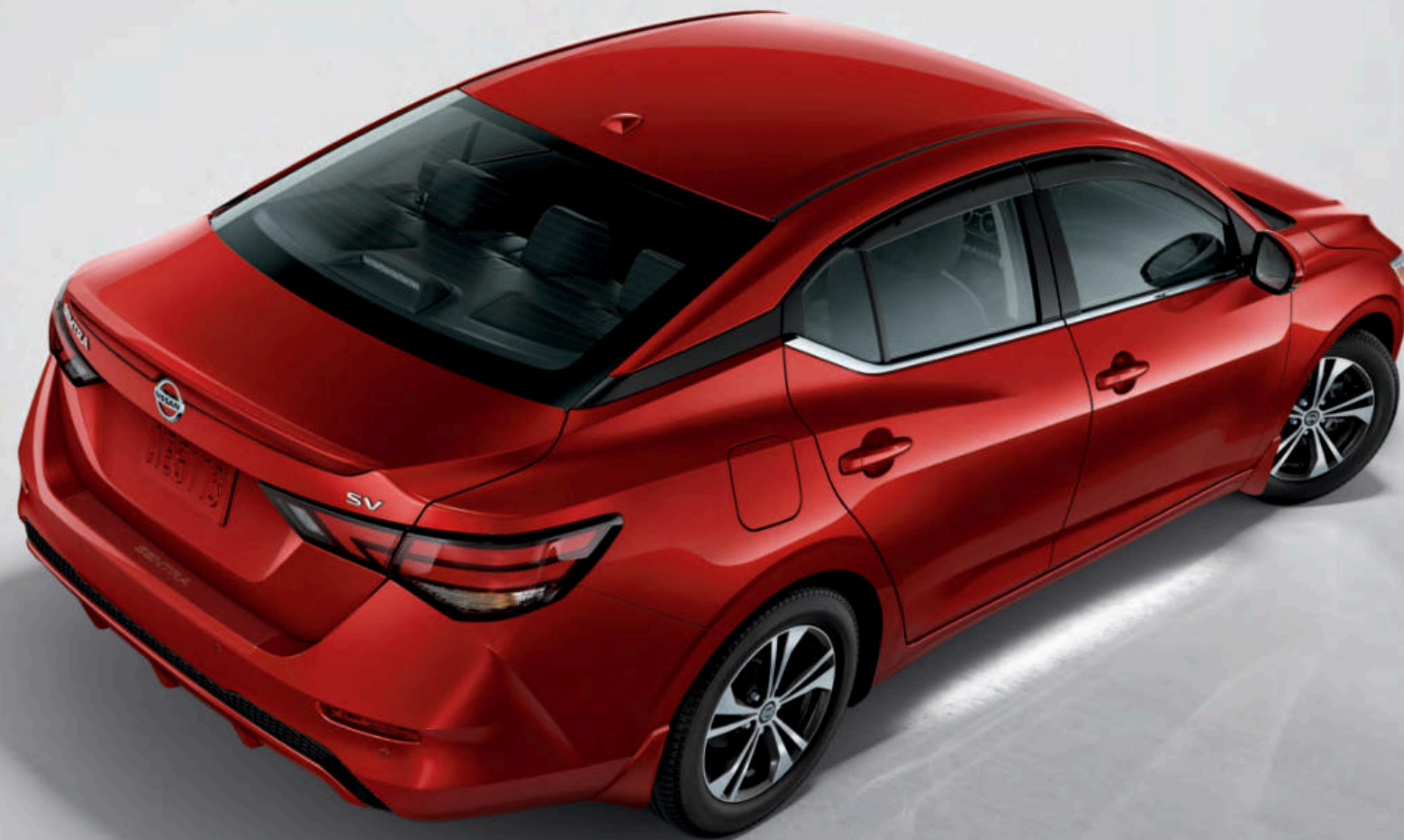
Nissan Sentra® SV shown in Scarlet Ember Tintcoat with Splash Guards, Exterior Ground Lighting, Side-Window Deflectors, Rear Decklid Spoiler, and Clear Rear Bumper Protector.

For more information and to shop online for Sentra® Genuine Nissan Accessories, go to bit.ly/20sentra-estore