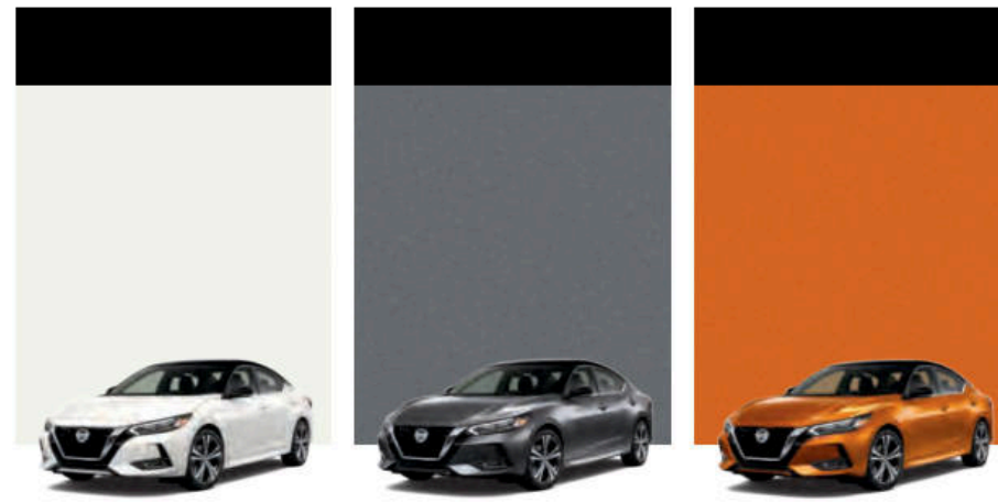
Two-tone Aspen White TriCoat / Super Black 14

Standard P1 Part of SV Premium Package P2 Part of SR Premium Package Nissan has taken care to ensure that the color swatches presented here are the closest possible representations of actual vehicle colors. Swatches may vary slightly due to the printing process and whether viewed in daylight, fluorescent or incandescent light. Please see the actual colors at your dealer.