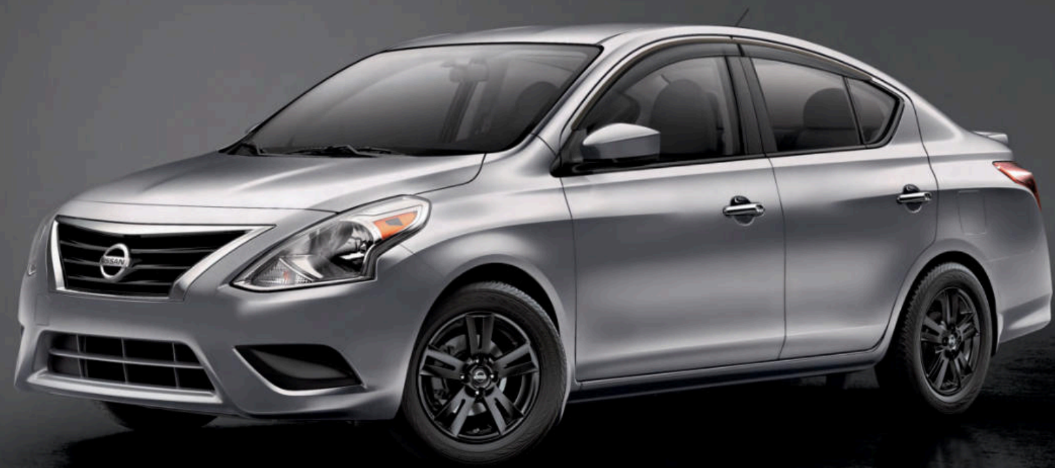
Nissan Versa ® Sedan SV Special Edition shown in Brilliant Silver with 15" Black Aluminum-alloy Wheels, Side-window Deflectors, Rear Decklid Spoiler, and Splash Guards.

For more information and to shop online for Versa ® Sedan Genuine Nissan Accessories, go to bit.ly/18versasedan-estore