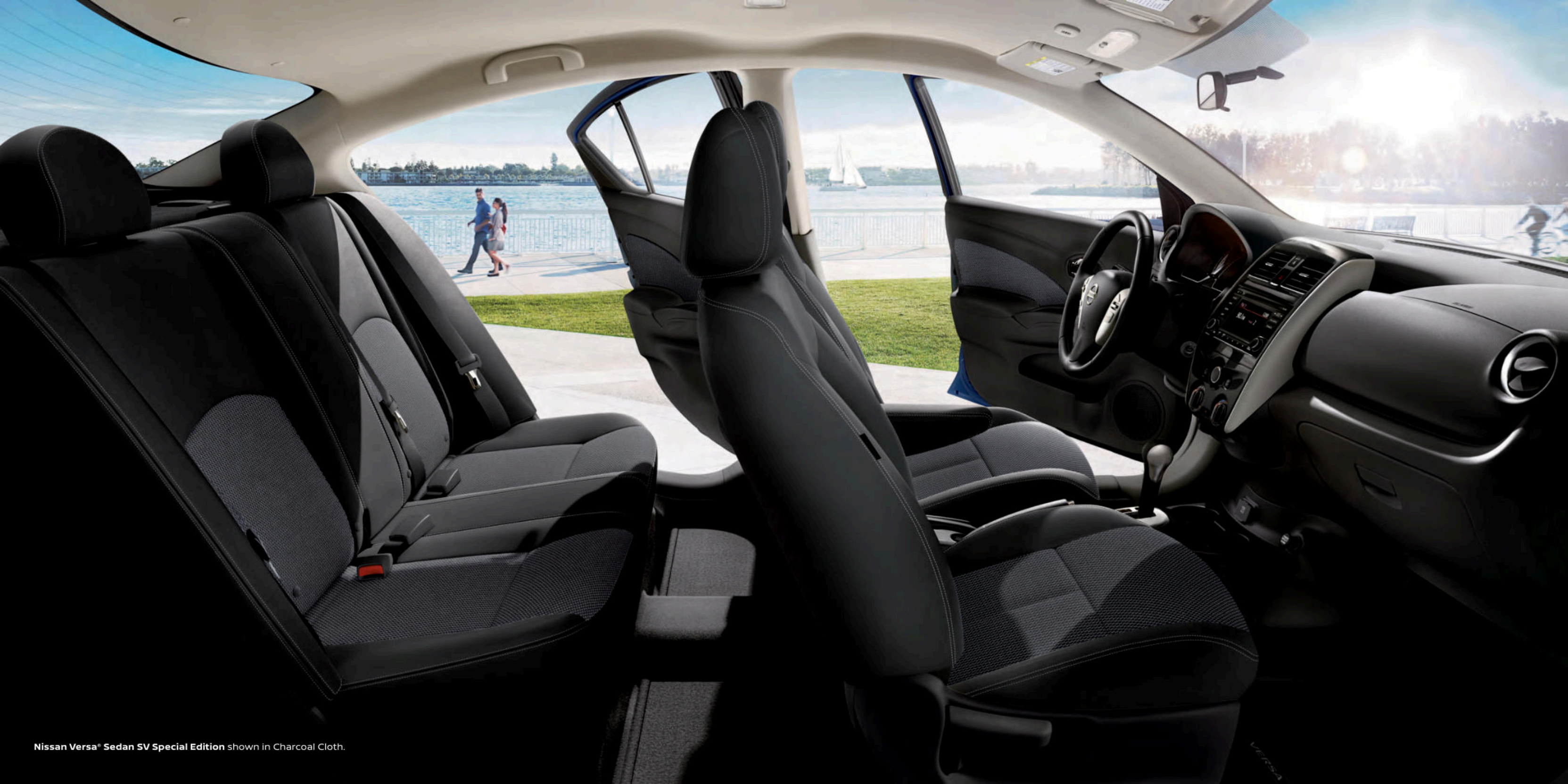
Nissan Versa® Sedan SV Special Edition shown in Charcoal Cloth.