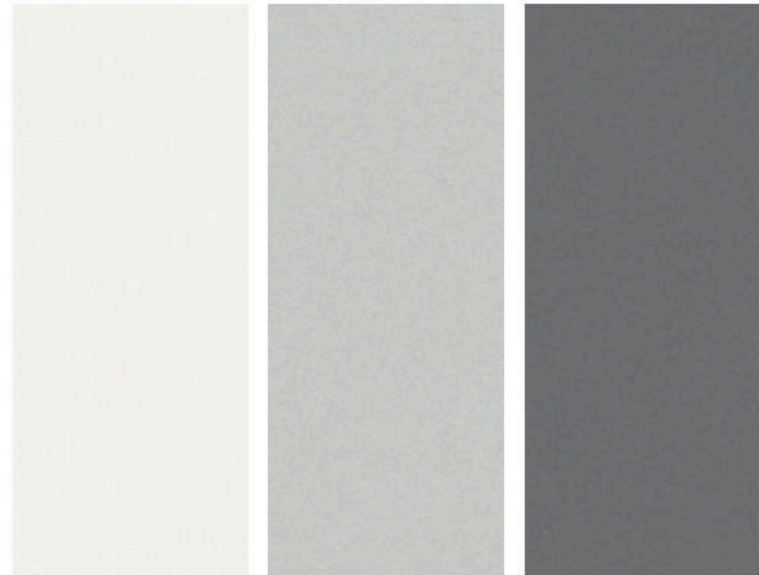
Fresh Powder QM1 Brilliant Silver K23 Gun Metallic KAD