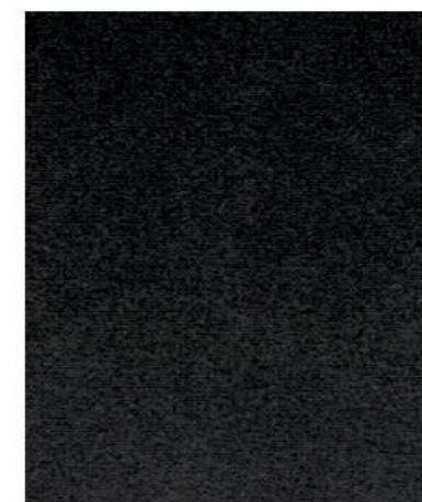
Charcoal Cloth S | S Plus