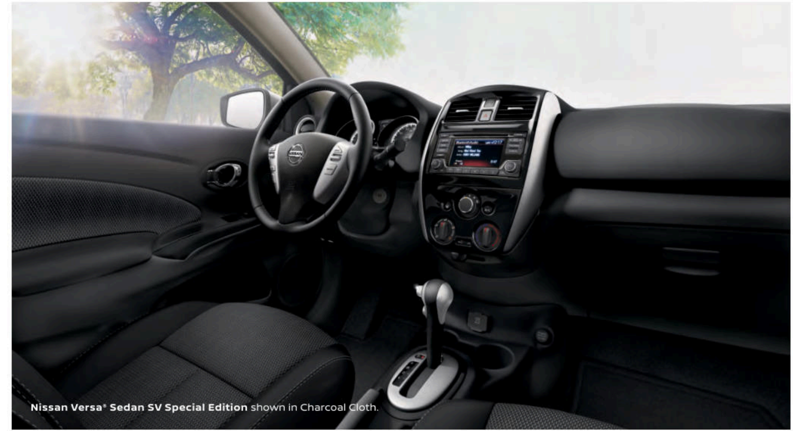
Nissan Versa® Sedan SV Special Edition shown in Charcoal Cloth.