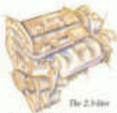
The 2.3-liter High-Output Quad 4 engine, standard on the Achieva SC and SC, shares an 170-horsepower