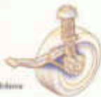
Achieva suspension with MacPherson front drive and rear coil springs are tuned to provide a smooth, even and controlled ride.

energetic combination. Yet, SC deftly tames its power. The touring suspension and P205-55R16 tires on wide 30" aluminum wheels provide a firm ride with flat cornering. The standard power rack-and-pinion steering is crisp and precise. Achieva S offers a feisty, 2.3-liter Quad OHC fuel-injected engine standard. It's matched with a five-speed manual transmission. A 3.1-liter V6 with a new computerized, electronic four-speed automatic transmission is available on all Achieva models. Turn to page 19 for complete engine availability. No matter which Achieva you choose, you'll find it's a road-sensitive car with the driving feel and traits of an import. Drive it. You'll understand.