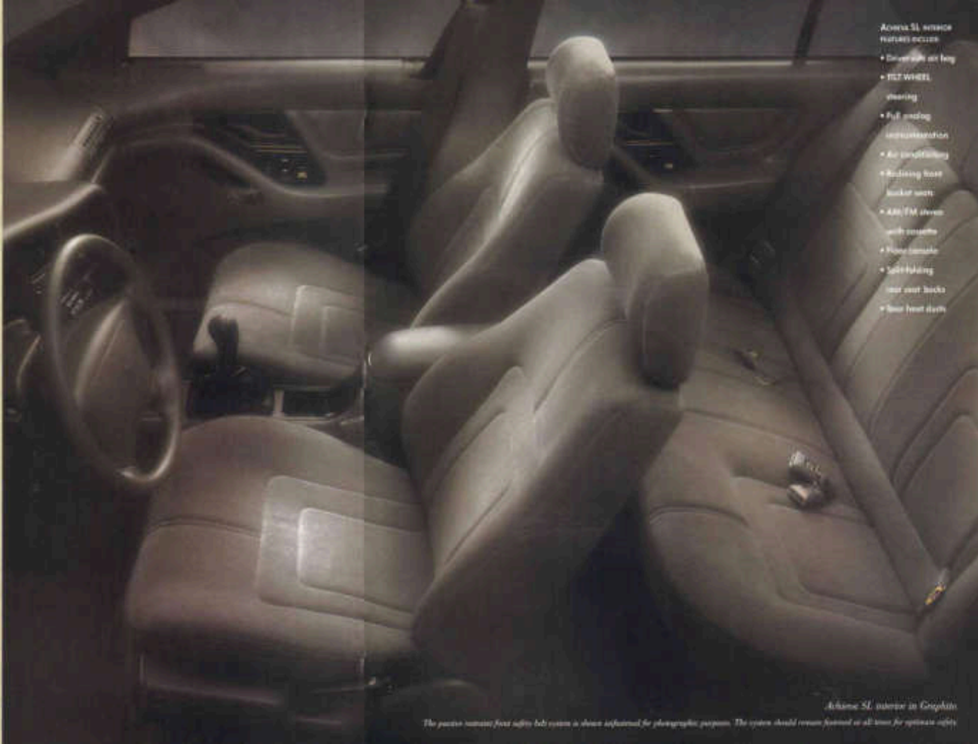
Acura S L interior in Grayskin

The picture illustrates front safety belt system in driver's seat for photographic purposes. The system should remain fastened at all times for optimum safety.