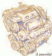
A powerful 167-horsepower, 2.3-liter V6 is available on all Achievas.