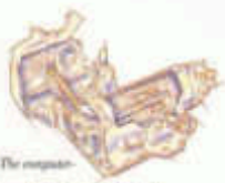
The engine-controlled electronic five-speed automatic transmission offers precise and seamless shifting. It's paired with the 2.3-liter 167-hp engine and available with the Quad OHC and Quad 4 engines.