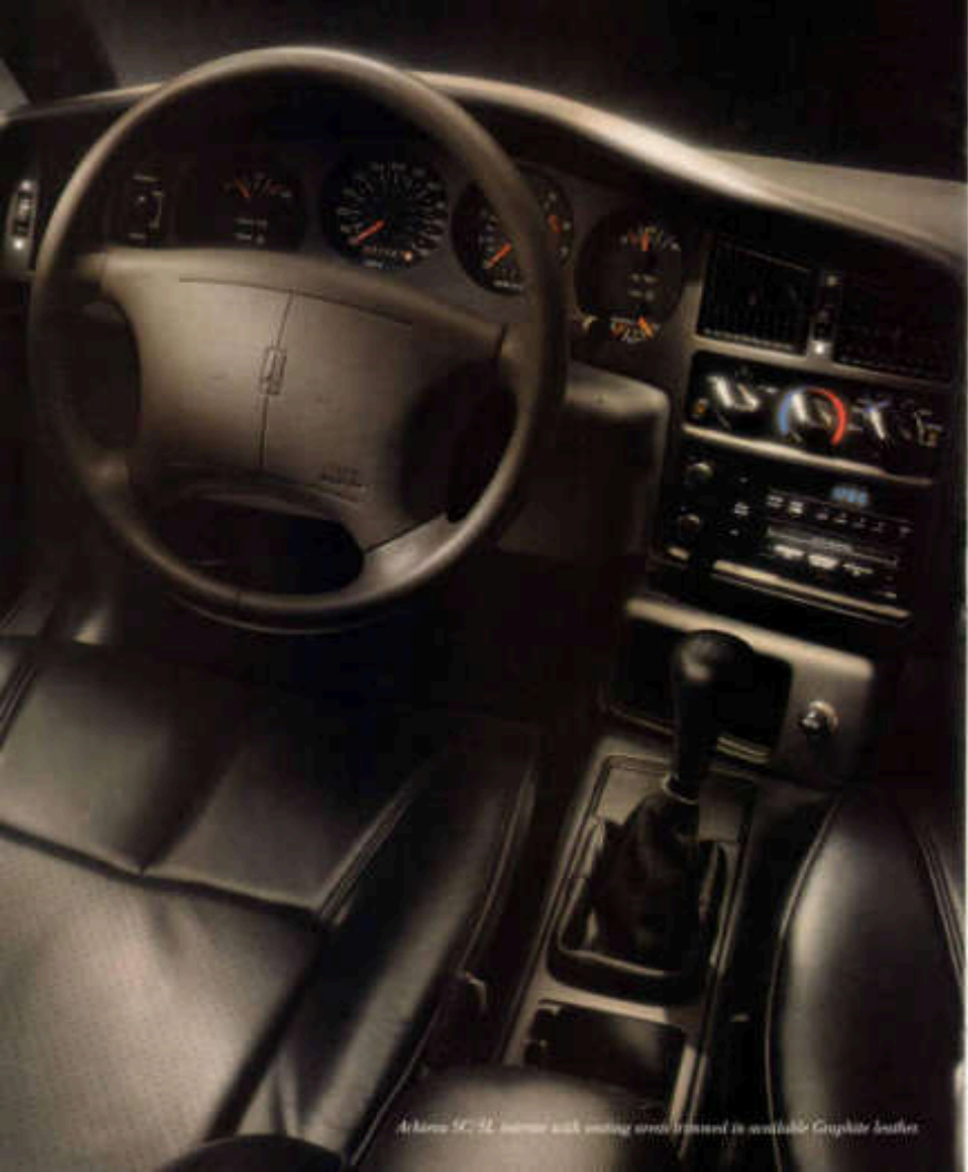
Achieva SC/SL interior with seating areas trimmed in available Graphite leather.