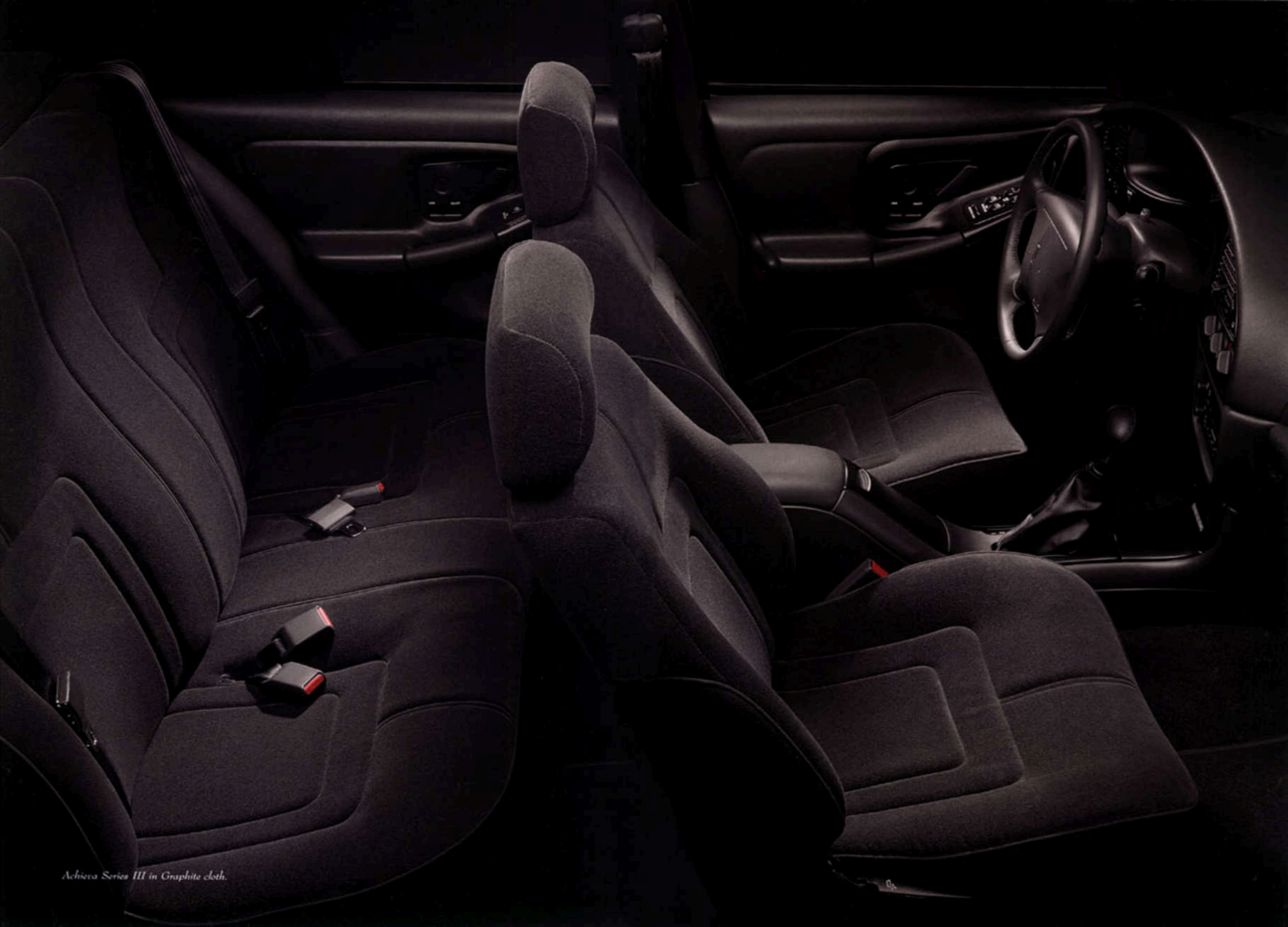
Achieva Series III in Graphite cloth.