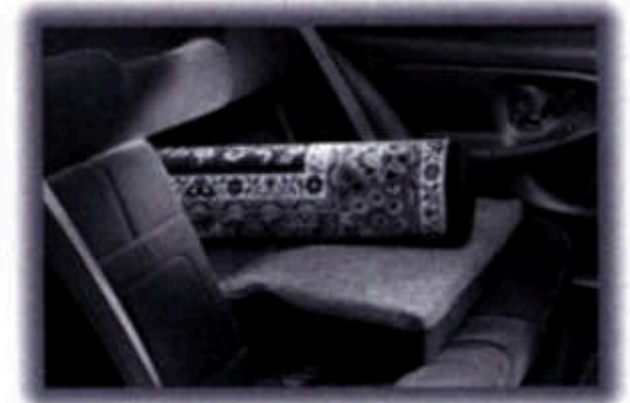
The available split-folding rear seat adds even more convenience and cargo-carrying versatility to Achieva Series III.

Other unexpected Achieva standard interior features include air conditioning, TILT-Wheel adjustable steering column, automatic programmable power door locks, auxiliary power outlet, front and rear carpeted floor mats, and much more.