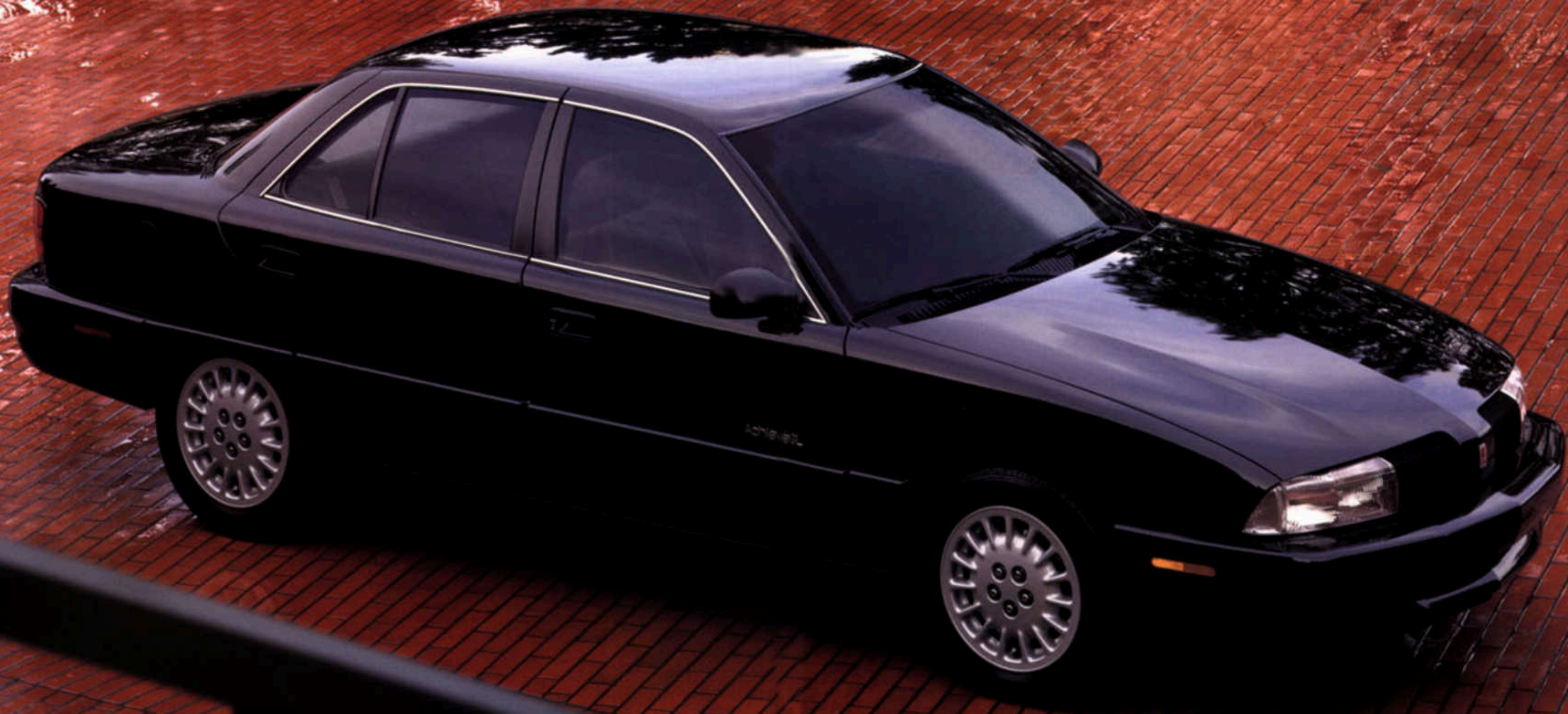
Achieva sedan in Black.