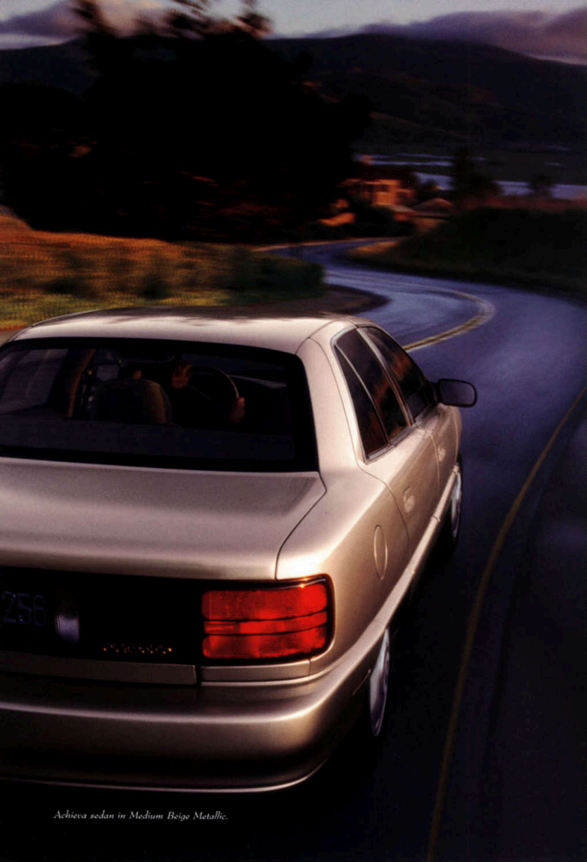
Achieva sedan in Medium Beige Metallic.