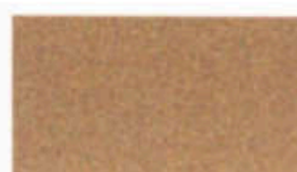
Medium Beige Metallic