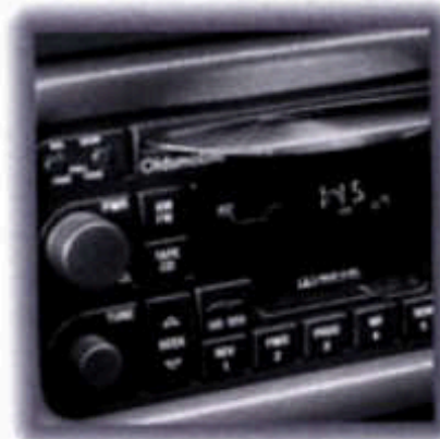
Available in the Series III model is an AM/FM stereo with both cassette and CD players.

Comfort begins as soon as you settle into an Achieva. The supportive contour bucket seats with recliners help you stay alert but relaxed for hours on the road. A newly redesigned instrument panel, equipped with large analog gauges, lets you quickly check speed, engine and temperature status. And, all controls are placed within easy reach and are designed for quick adjustment.