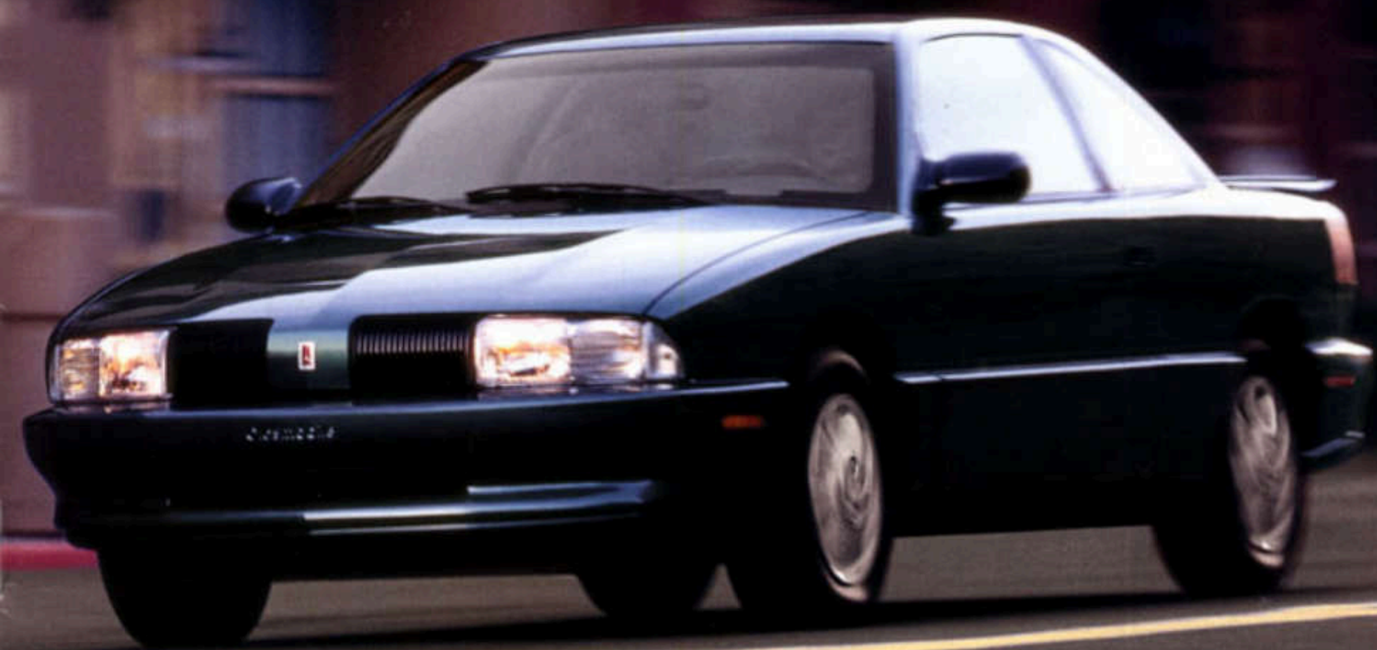
Achieva coupe in Bright Green Metallic.