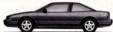
Cutlass Supreme Coupe