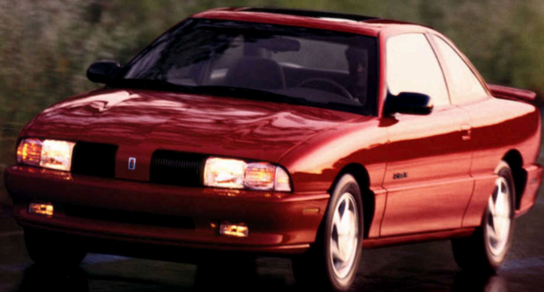
Acheva coupe with Sport Package in Bright Red. Shown with optional 15-inch aluminum wheels.