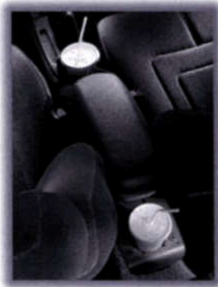
Achieva features two cupholders and a center storage armrest as standard equipment.

ECOLOGICALLY SOUND GENERAL MOTORS IS COMMITTED TO THE NATURE CONSERVANCY® AND ITS WORK OF PROTECTING NATURAL HABITATS. GM CONTRIBUTES GENEROUSLY TO THE CONSERVANCY'S EFFORTS AND DOES ITS SHARE TO PROTECT THE ENVIRONMENT BY USING CFC-FREE REFRIGERANT AND THE LATEST ON-BOARD DIAGNOSTIC SYSTEM (OBD-II) TO HELP REDUCE ENGINE EMISSIONS.