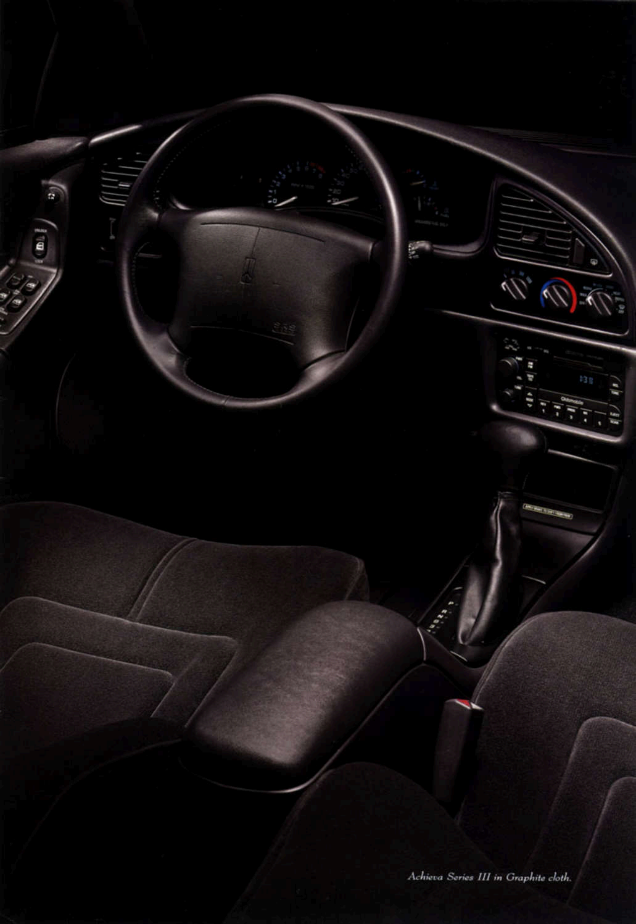
Achieva Series III in Graphite cloth.