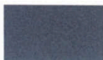
Light Green Metallic