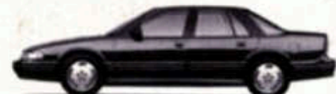
Cutlass Supreme Sedan