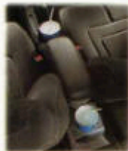
Stay organized and in touch. Dual cupholders, an auxiliary power outlet and a center storage area are standard.

Enhancing Achieva's comfort and convenience are other features like reclining front bucket seats, wrap-around instrument panel with tachometer, center console with floor shifter, front seat back map pockets, illuminated entry/exit system, remote trunk and fuel-filler door releases, and much more.