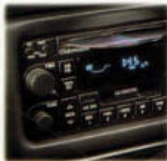
An AM/FM stereo is standard in every Achieva. Series II models add a cassette player, and even offer an available CD/ cassette combination.

"Ouch" is not the response a new car should evoke. "Oooh" is more like it. That's the reaction you and your passengers can expect inside the Achieva coupe or sedan. For you, standard features like driver's-side lumbar support, TILT-Wheel adjustable steering column, and large, easy-to-reach controls