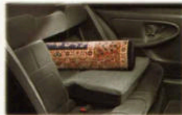
The convenient split-folding rear seat back, standard on Series II and available on Series I, lets you maximize all that interior and trunk space to suit your particular cargo-carrying needs. You can even carry bulky or long items plus a rear passenger without infringing on his or her comfort.

make the drive more enjoyable. For your passengers, rear-seat heat ducts and a roomy interior space with ample rear headroom and legroom eliminate the need to ask, "are we there yet?" Aaah.