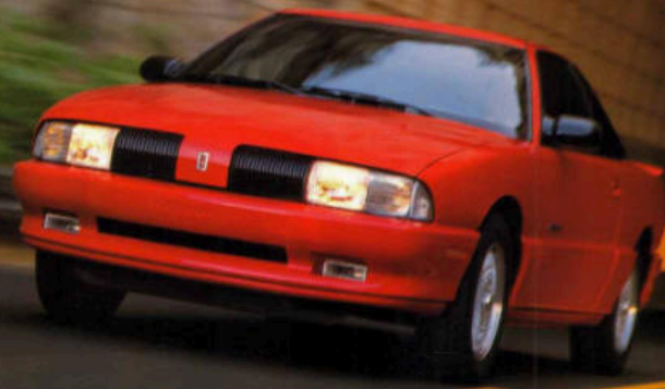
Achieva. The way you drive. Right. Red.

I want my car to be as predictable as gravity. Which is the reason I picked an Achieva. Especially when it gets wet or icy out there. With standard equipment like ABS and an automatic transmission with enhanced traction system, it's almost as predictable in the wet as it is in the dry. I've driven cars costing more than Achieva that don't even offer traction control. I think these cars are just spinning their wheels.