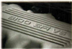
Achieva's standard 3100-Incubator, 24-Valve Twin-Cam engine gives you confidence and efficiency. Even more power and torque are available with the optional 3100 SFI V6.

When it comes to driving, safety is not an option. It's a must. That's why you'll find so many standard safety and security features on every Achieva. The list starts with anti-lock brakes and daytime running lamps to help you avoid trouble in the first place. For