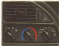
With some competitors, you'll pay extra even for "must have" items like air conditioning. On Achieva, it's standard.

According to Consumers Digest , "When it comes to choosing a Best Buy...value reigns supreme." Is it any wonder that the editors selected the Achieva coupe and sedan as a "Best Buy" in 1996? With its long list of standard