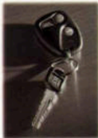
To help feel secure, Achieva's PASSLock vehicle security system "recognizes" the proper key and prevents attempts to start the engine without it. And the available remote-control keyless entry system features "rolling codes" that change with every use.

protection in the event of a collision, Achieva provides dual frontal air bags, safety-cage construction with side-impact reinforcements, and front and rear crush zones. Your security is enhanced by battery run-down protection and automatic programmable power door locks. And peace of mind comes from either of Achieva's two responsive, low-maintenance* engines.