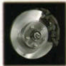
Rain or shine, the Achieva auto-lock brake system helps you maintain steering control in white-knuckle situations.