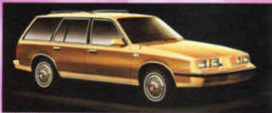
Olds Frenza Cruiser