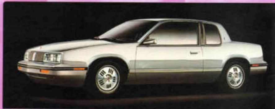
Olds Calais Supreme Coupe

step up to Olds in style. Like all Oldsmobiles—each has been meticulously orchestrated by people who care about the quality of what they do. Yes, there is a special feel in an Oldsmobile and for 1985, it goes like this.