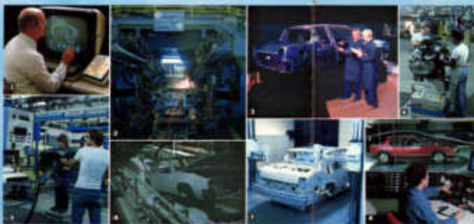
1. Computers aid in design and manufacture. 2. Robotic body forming. 3. Precision paint of all body parts. 4. Worker tasks. 5. Instrument panel covering station. 6. Final body of cutlass enters. 7. Rubber body cover with wire coat. 8. Final tuning.

Robots—some as big as a two-story building, others as small as a personal computer—provided exact body dimensional control.