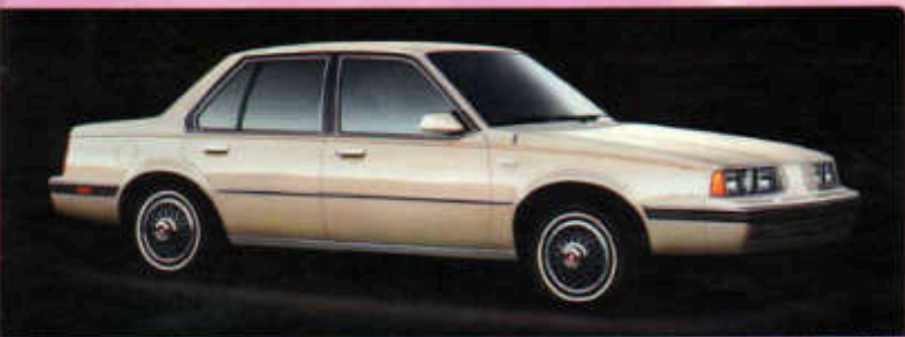
Olds Frenza L.S. Sedan