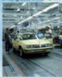
Quality that was designed in... is in fact, built in.

Cutlass also makes use of more one-piece component units than ever before. They are held firmly in place thus reducing the chance for annoying rattles to occur. Quiet.