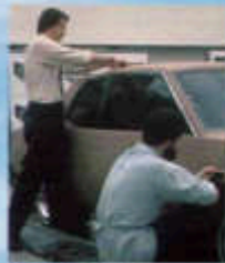
Quality starts with design.

Cutlass was designed so that all the ingredients that go into manufacturing, production and quality assembly match Cutlass' personal requirements exactly.