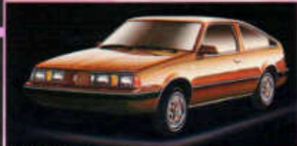
Olds Frenza Soft Coupe