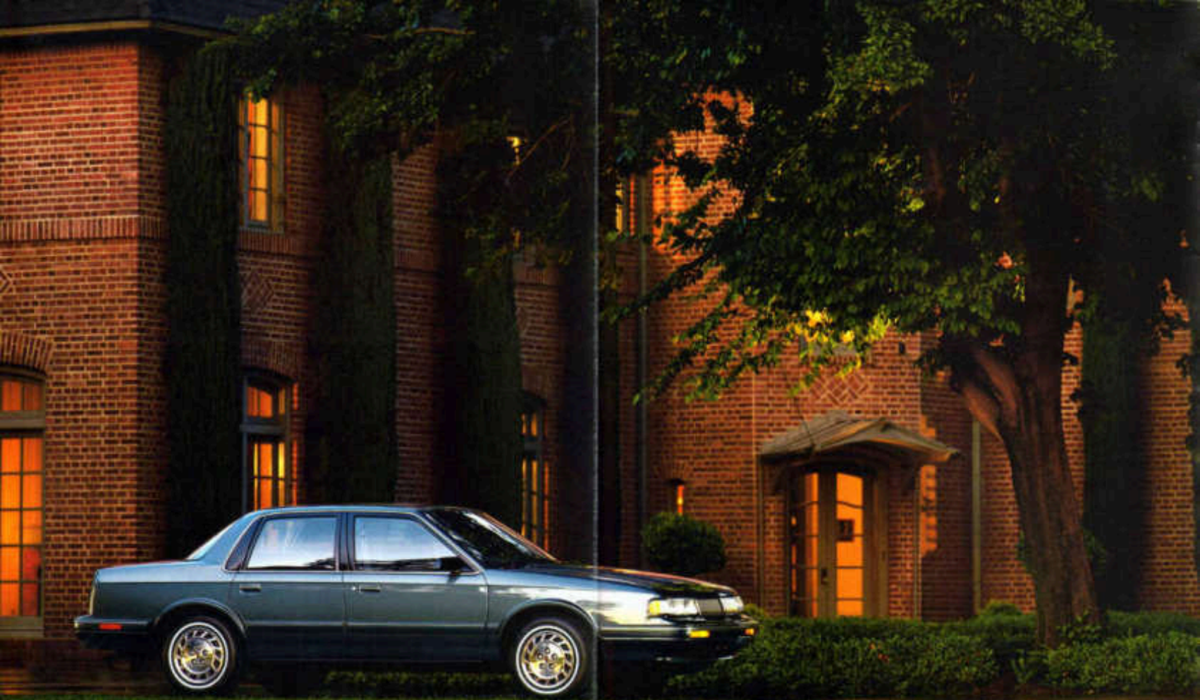
Cadillac Coupe DeVille in Dark Green Gray Metallic