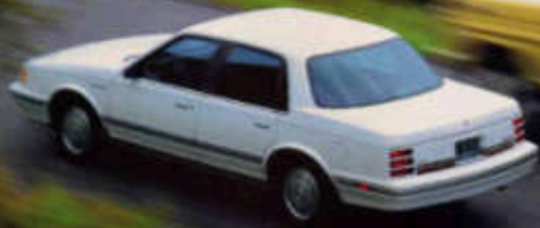
Cutlass Ciera 5 in Bright White