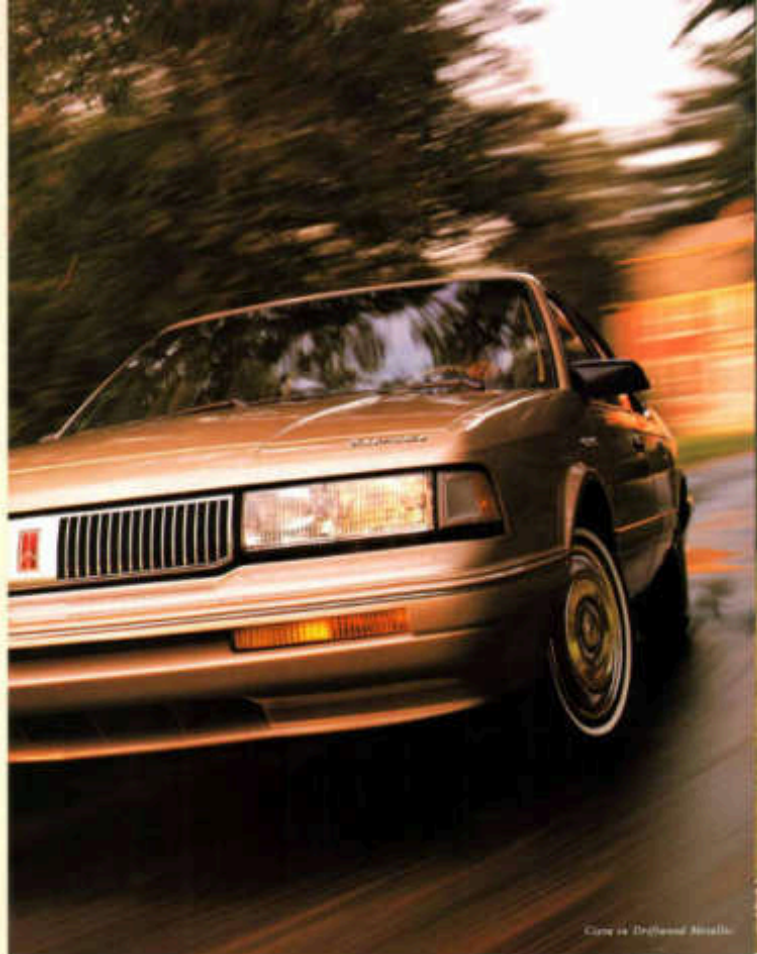
Car is Drifwood Model.

— We invite you to CONFIDE. Drive with other sedans in its class.