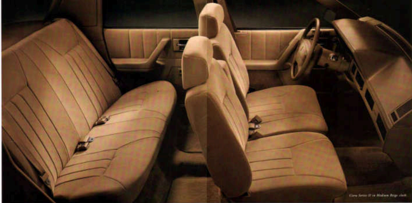
Clean Series II in Medium Ring cloth.