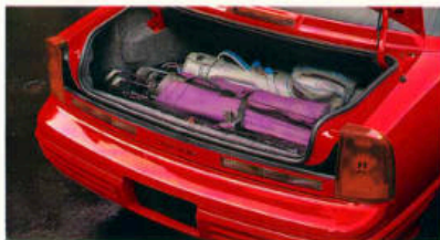
Supreme Convertible's trunk space has not been sacrificed... with over 12 cubic feet of capacity.