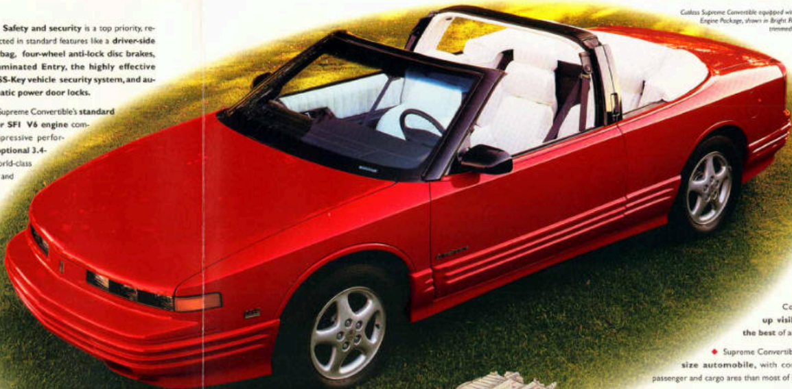
Cutlass Supreme Convertible equipped with 3.4-Liter DOHC V6 Engine Package, shown in Bright Red with seating area trimmed in new White leather

◆ Safety and security is a top priority, reflected in standard features like a driver-side airbag, four-wheel anti-lock disc brakes, Illuminated Entry, the highly effective PASS-Key vehicle security system, and automatic power door locks.