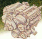
Optional 3.4-Liter DOHC V6 generates 210 horsepower and 215 lbs. ft. of torque

◆ Supreme Convertible comes with The Oldsmobile Edge, an exclusive customer satisfaction program featuring Guaranteed Satisfaction, Free 24-Hour Roadside Assistance, Bumper-To-Bumper Plus Warranty, and Courtesy Transportation.