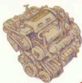
Standard 3.1-Liter SFI V6 generates 160 horsepower and 185 lbs. ft. of torque

The Orlando Sentinel writes of the Supreme Convertible, "It's one of those rare cars that just makes you feel good. All the time." (April 22, 1993). While most convertibles are a lot of fun to drive on sunny days, there is usually a price to pay in terms of cowl shake, wind noise, poor top-up visibility, lack of rear seat room, and other drawbacks. With the Supreme Convertible, you can "feel good all the time" with a uniquely balanced approach to open-air motoring.